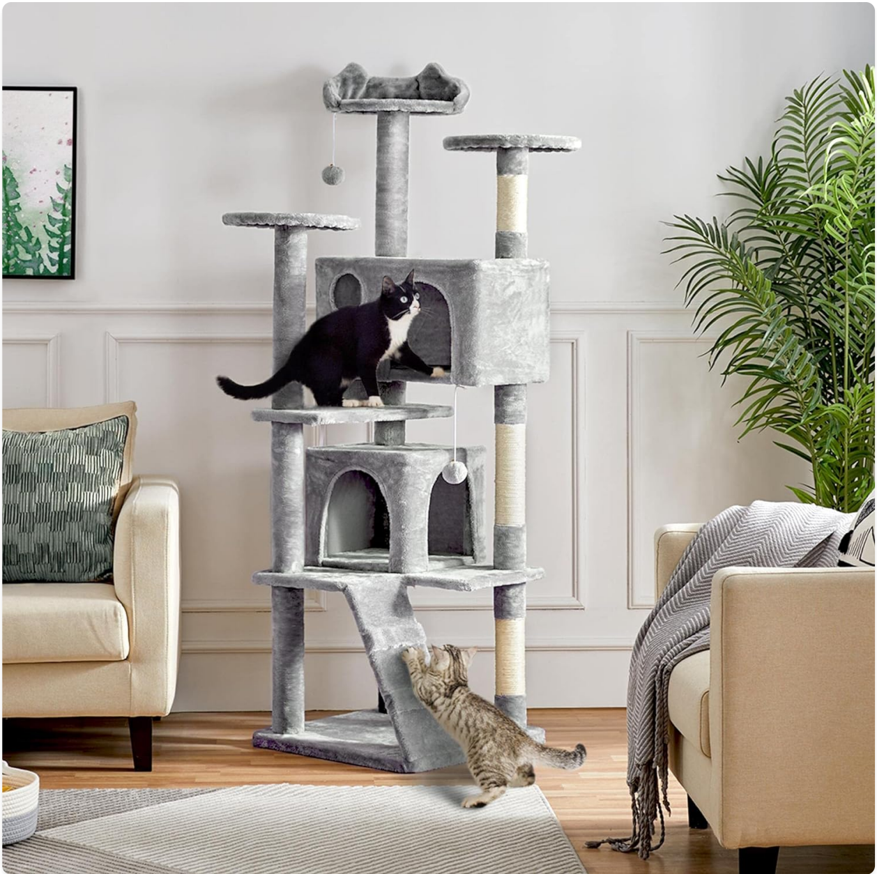
The Yaheetech 70in Multi-Level Cat Tree provides a versatile activity center for cats.