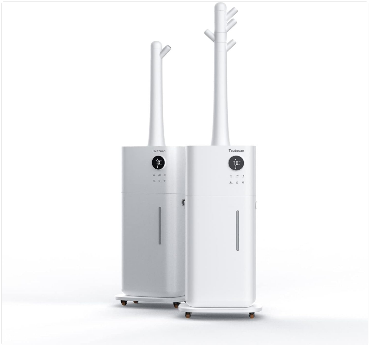
The Toutouan Tower Humidifier, a tall, white, rectangular unit with a multi-directional mist outlet on top, designed for large area humidification.