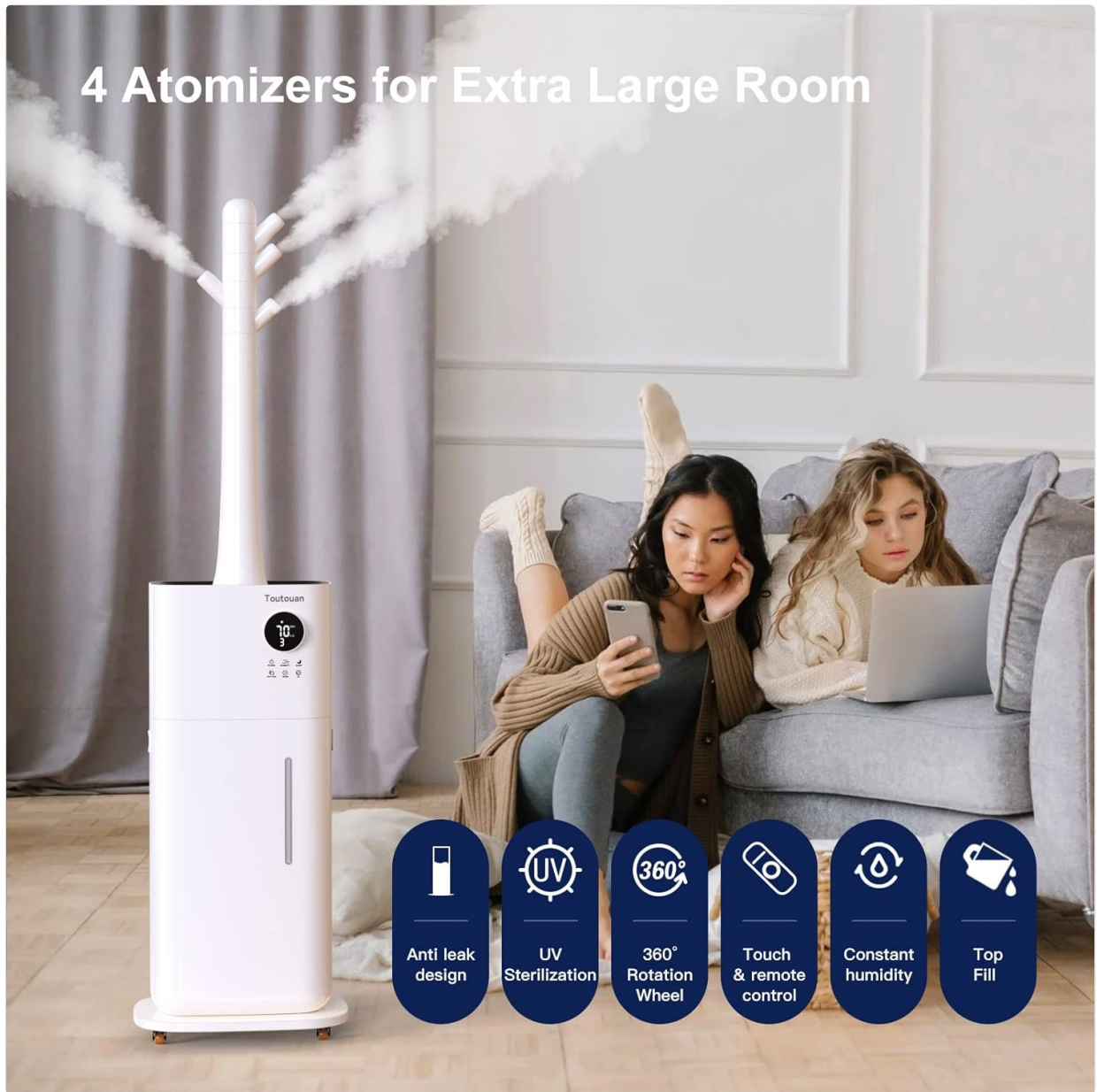
The humidifier in a living room setting, highlighting its four atomizers for extra large room coverage and features like anti-leak design, UV sterilization, 360° rotation, touch & remote control, constant humidity, and top fill.