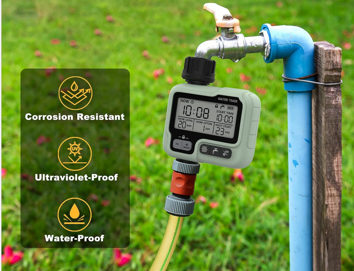
Image: The timer's stable and durable design, emphasizing its corrosion, UV, and waterproof properties.