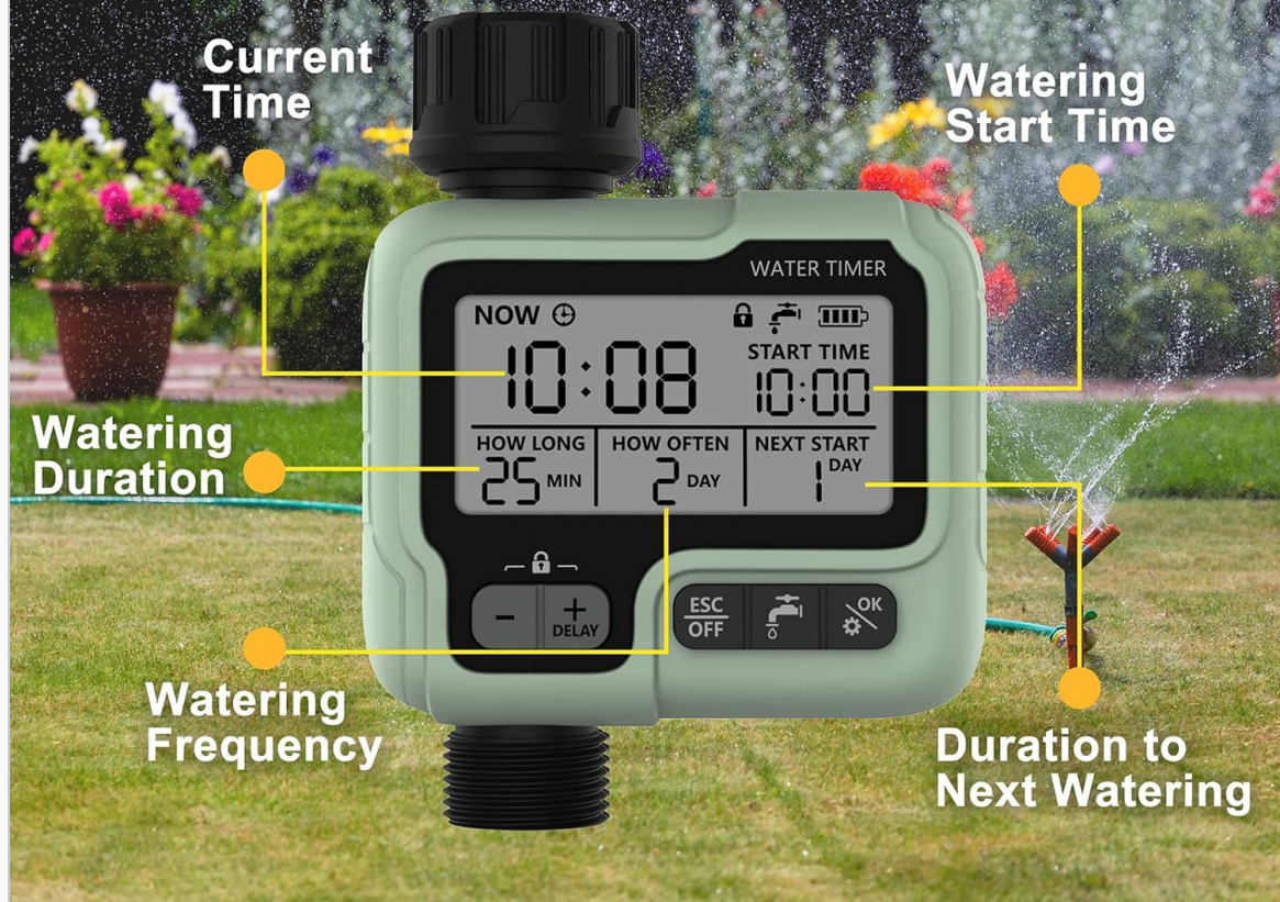
Image: The timer's display showing options for setting watering duration and frequency.