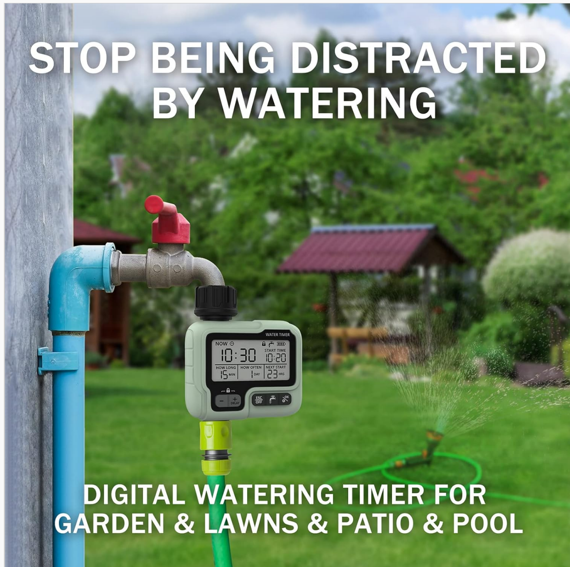
Image: Kazeila Water Timer securely connected to an outdoor faucet.