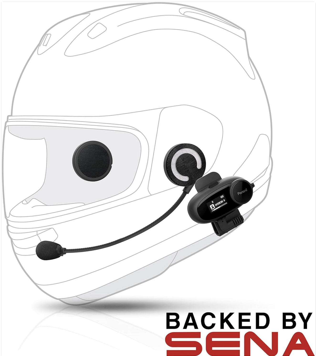
Figure 3.1: Parani M10 Main Unit Controls and Ports.