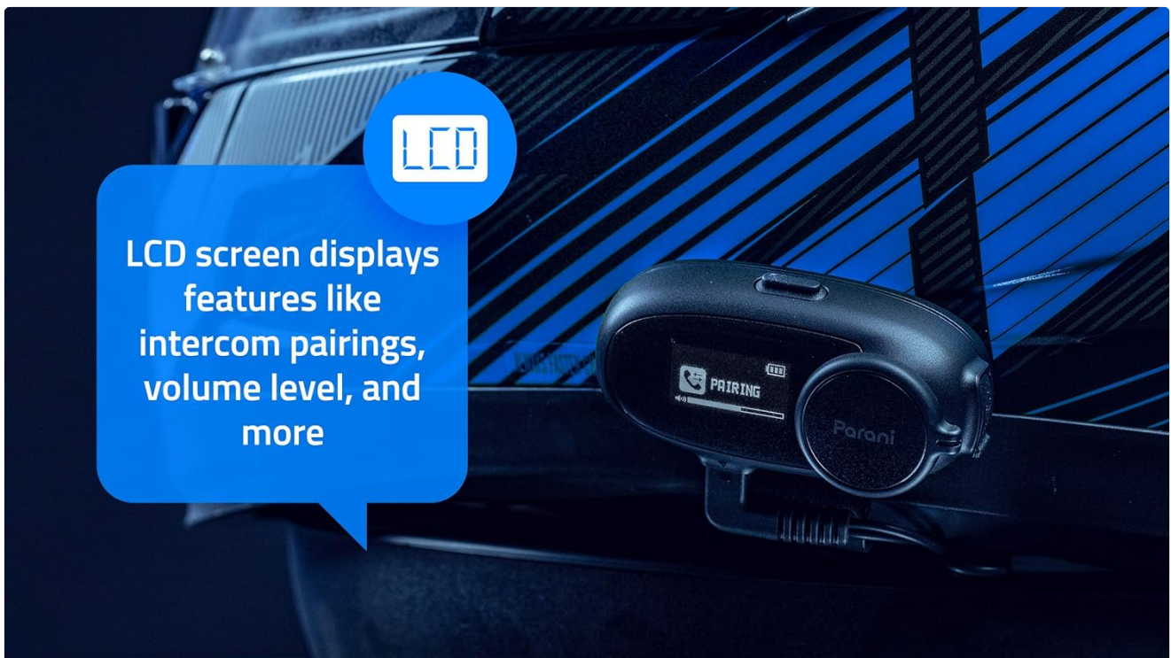
Figure 5.1: LCD display showing pairing status and volume.

Rotate the Jog Dial clockwise to increase volume and counter-clockwise to decrease volume. The LCD display will show the current volume level.