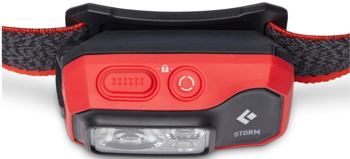
Top view of the headlamp, showing the power and mode buttons for control.