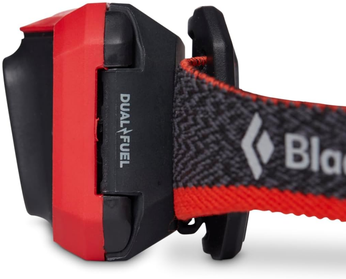
Side view of the headlamp indicating the 'Dual Fuel' compatibility and battery compartment.