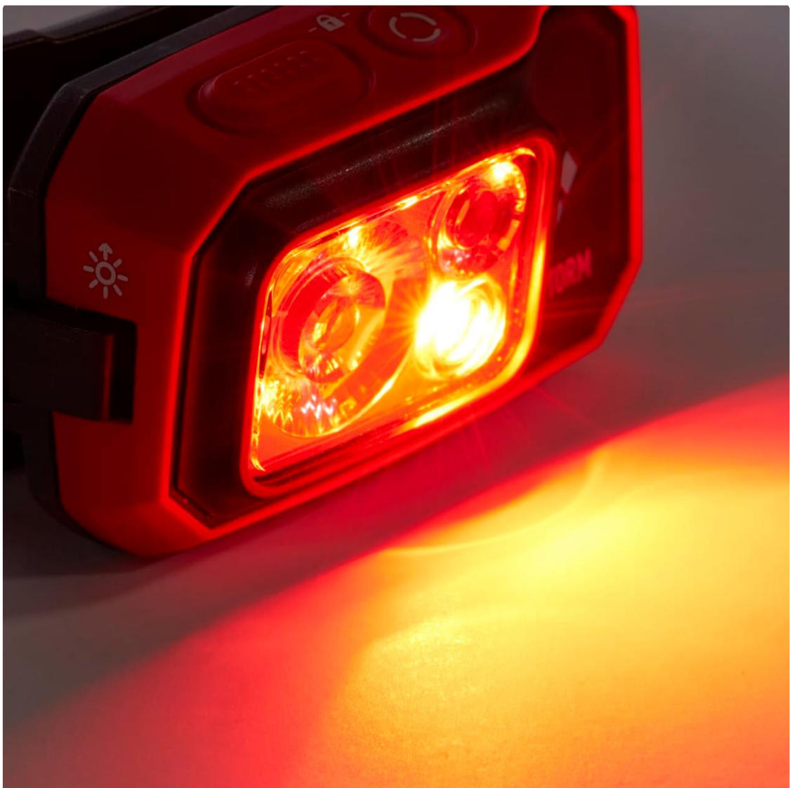
The headlamp illuminated in red light mode, suitable for preserving night vision.