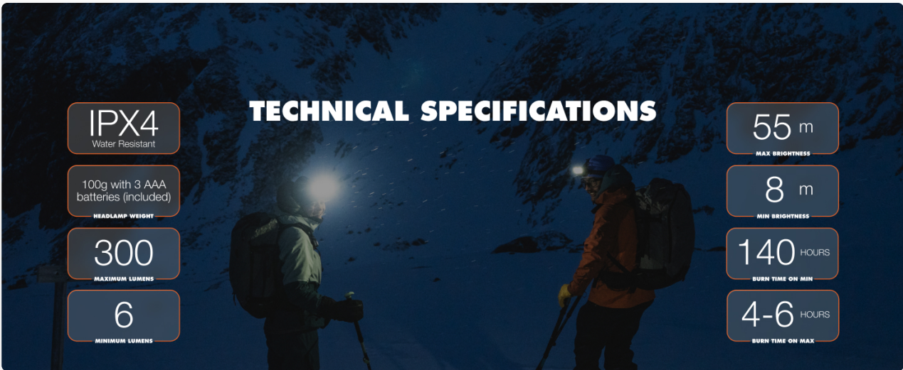
Image: Detailed technical specifications of the Astro 300 Headlamp.