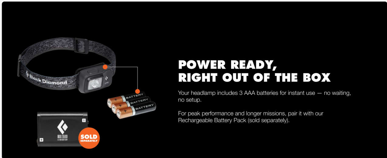
Image: Illustration of the battery compartment and the 3x AAA batteries required for operation. The optional BD 1500 rechargeable battery pack is also shown.