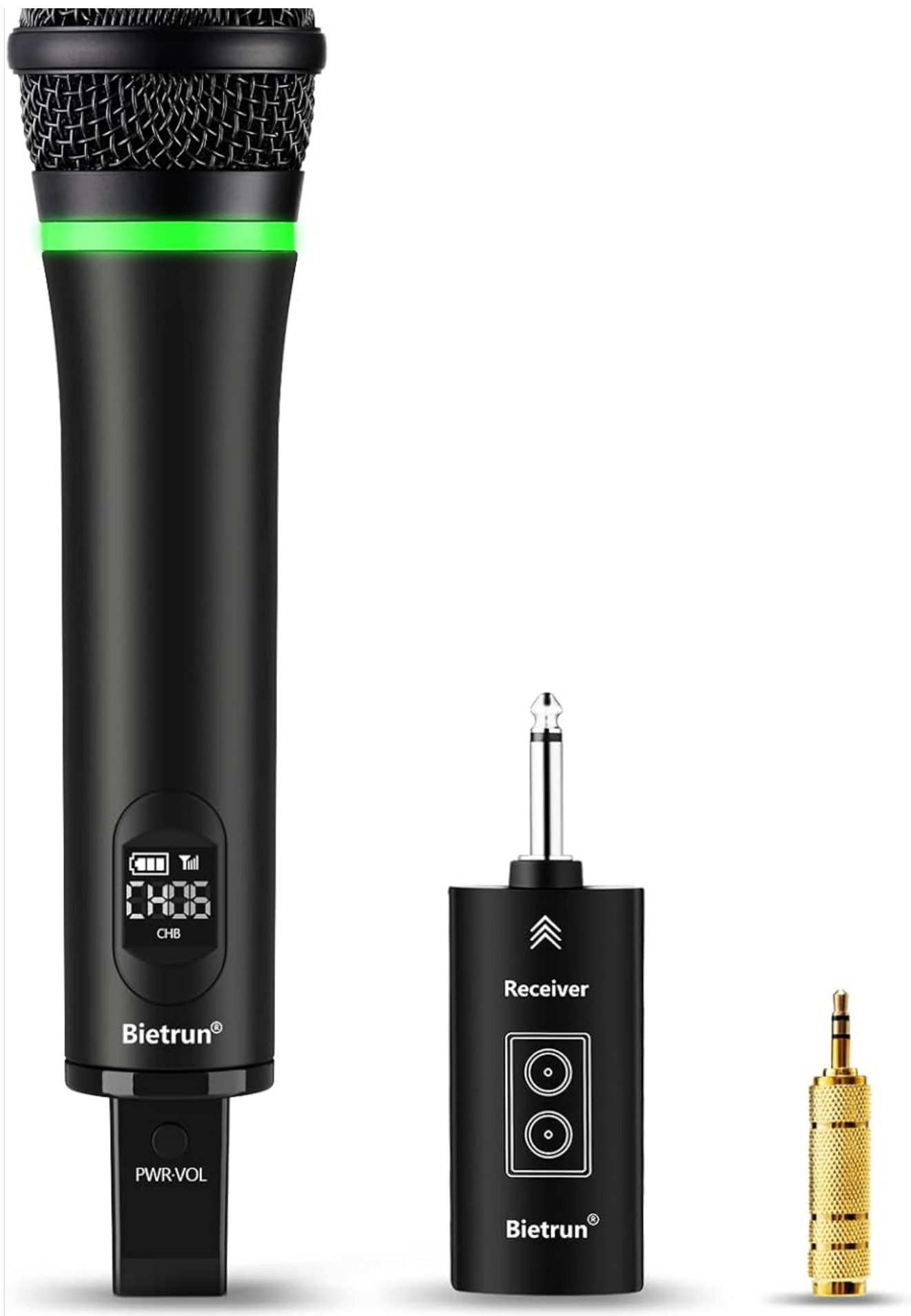
Image: The Bietrun Wireless Microphone, its receiver, and a 6.35mm to 3.5mm converter.