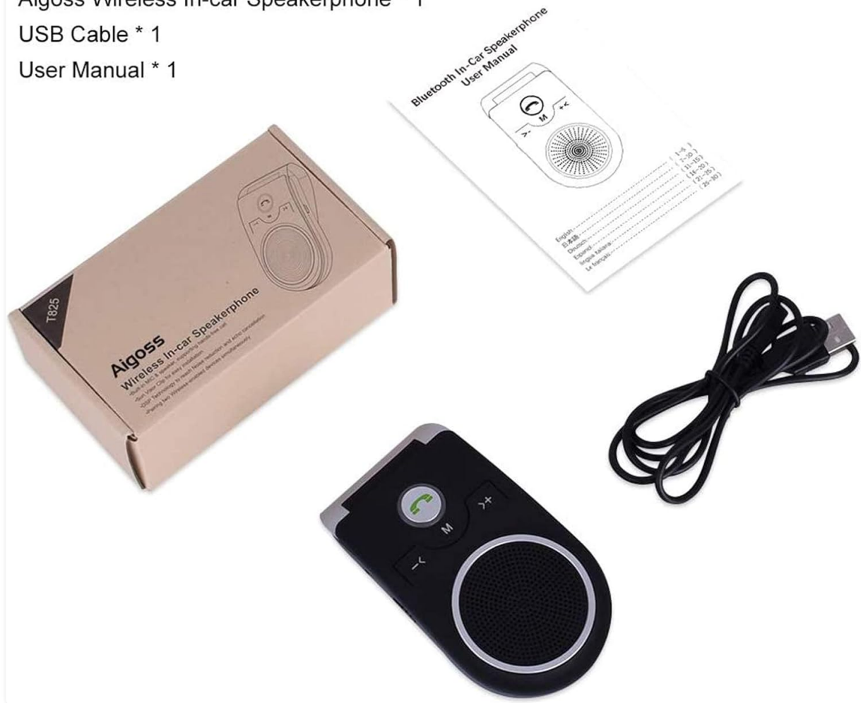
Image: The Aigital T825 speakerphone, its packaging box, a USB charging cable, and the included user manual.