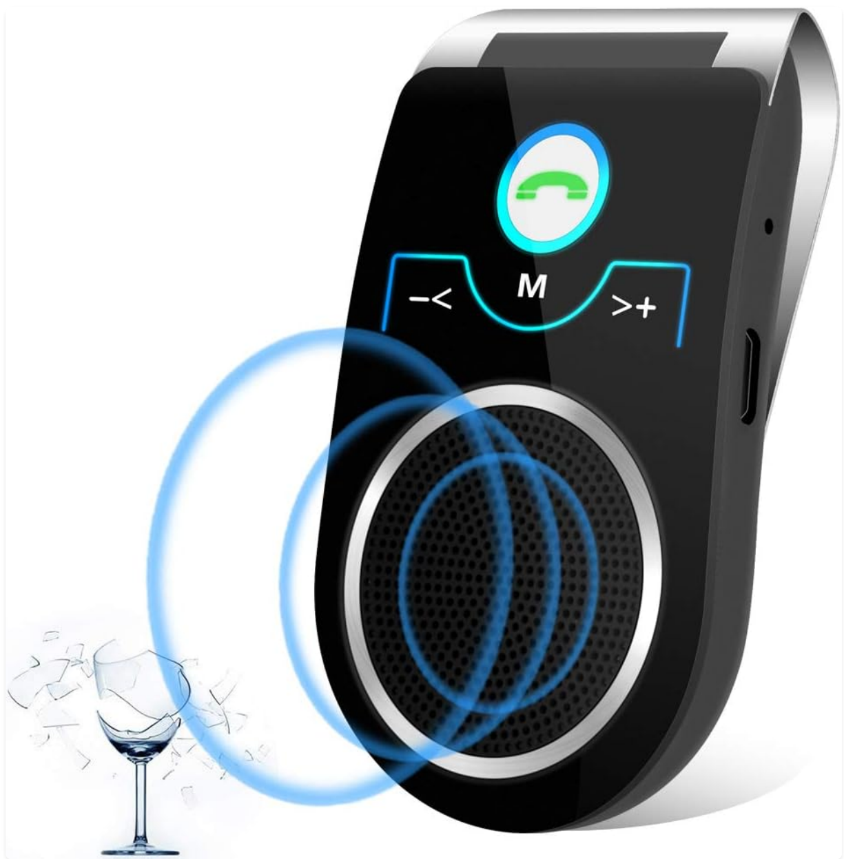
Image: Front view of the Aigital T825 Bluetooth Car Speakerphone, highlighting its main buttons and speaker.