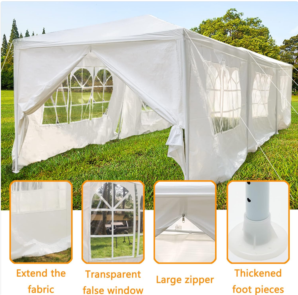
Figure 4.3: Key features of the gazebo including window design and foot stability.