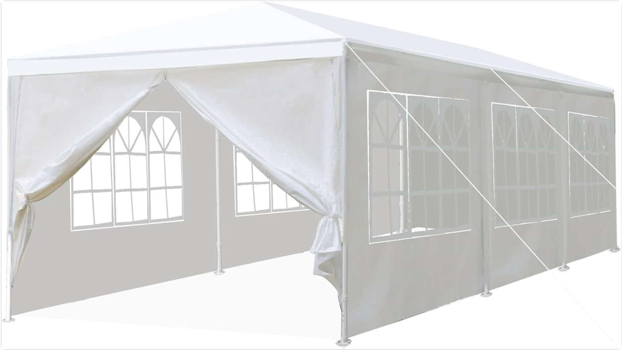
Figure 4.2: Fully assembled 10x30 Outdoor Gazebo.

securing the structure to the ground. It also shows the attachment of the sidewalls.