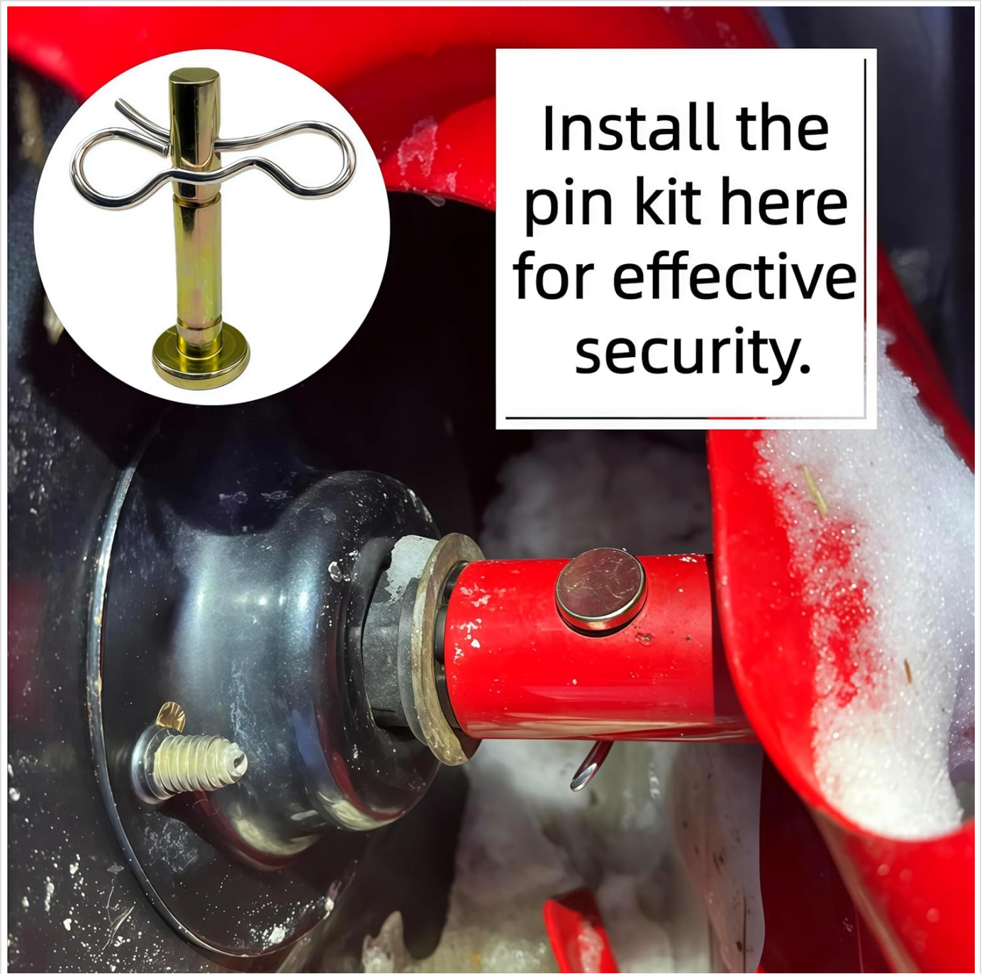
Image: A close-up view of a hand installing a shear pin and cotter pin into the auger shaft of a red snowblower, with snow visible around the components.

Video: A step-by-step demonstration of how to replace shear pins and cotter pins on a snowblower auger. This video shows the process of clearing the old pin, inserting the new shear pin, and securing it with a cotter pin using pliers.