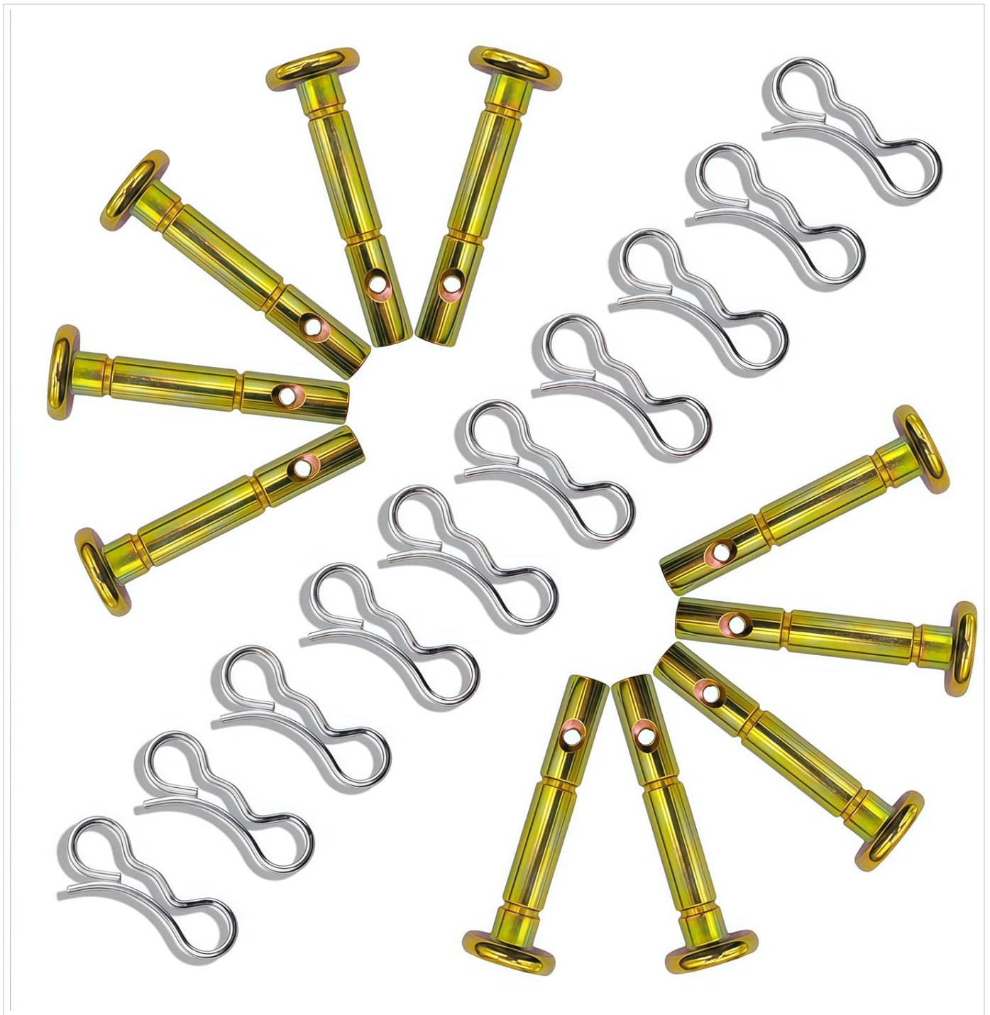
Image: A collection of gold-colored shear pins and silver-colored cotter pins, spread out on a white background, illustrating the contents of the kit.