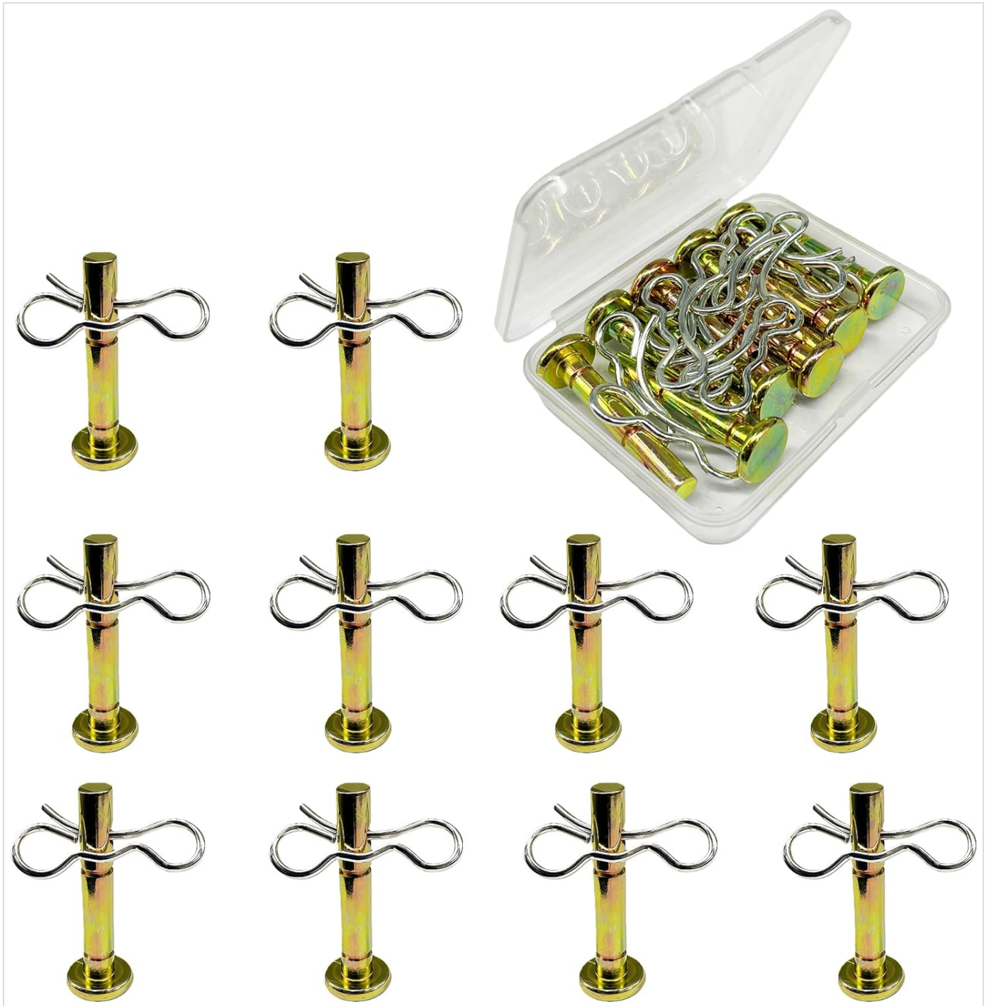
Image: Multiple gold-colored shear pins and silver-colored cotter pins neatly organized within a clear plastic storage case.