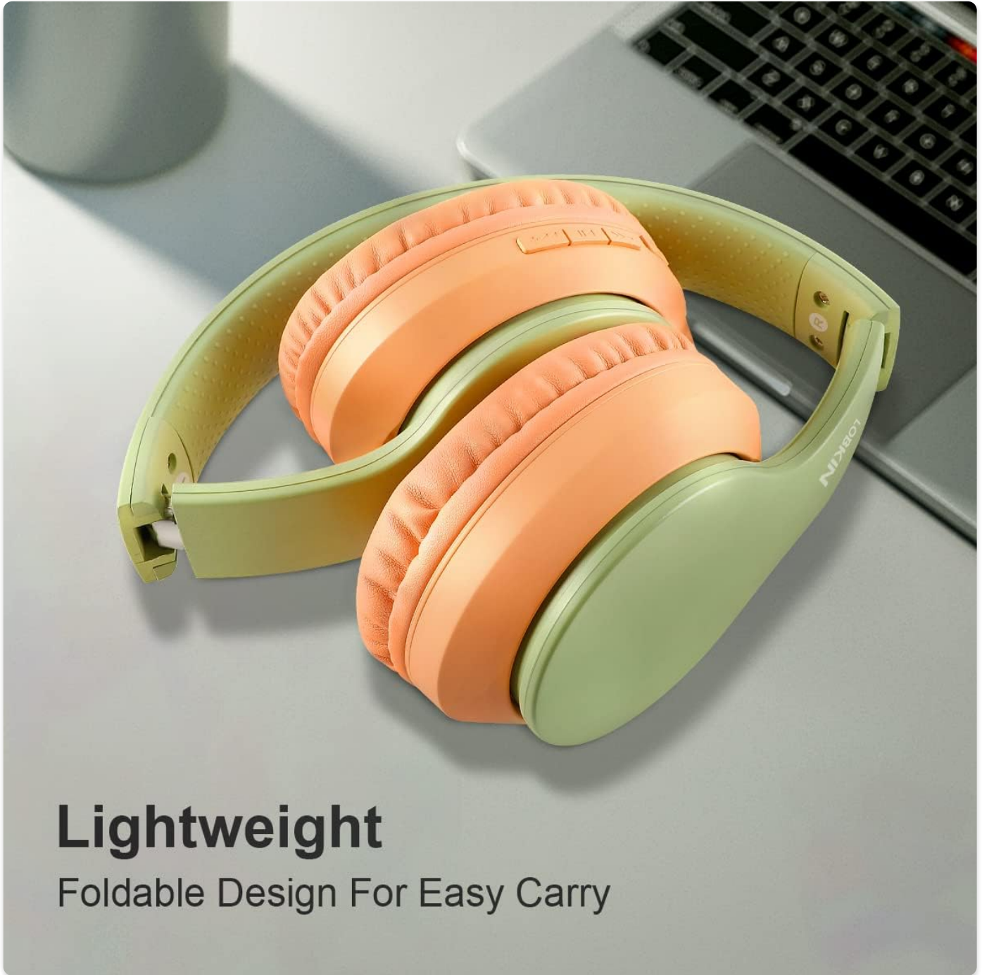
Image: The LOBKIN S22 headphones folded into a compact form, demonstrating their portability and ease of storage. This design helps protect the headphones when not in use.