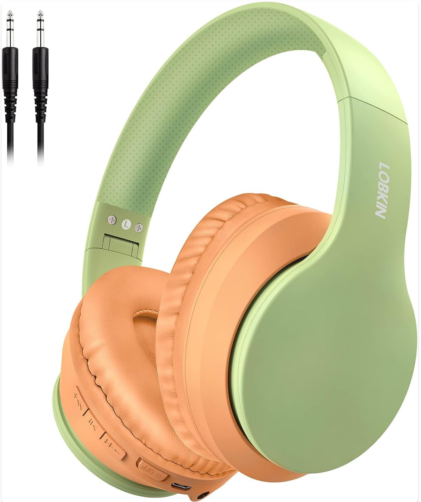
Image: LOBKIN Bluetooth Headphones S22 in Olive Green. These over-ear headphones feature a foldable design and come with a 3.5mm audio cable.