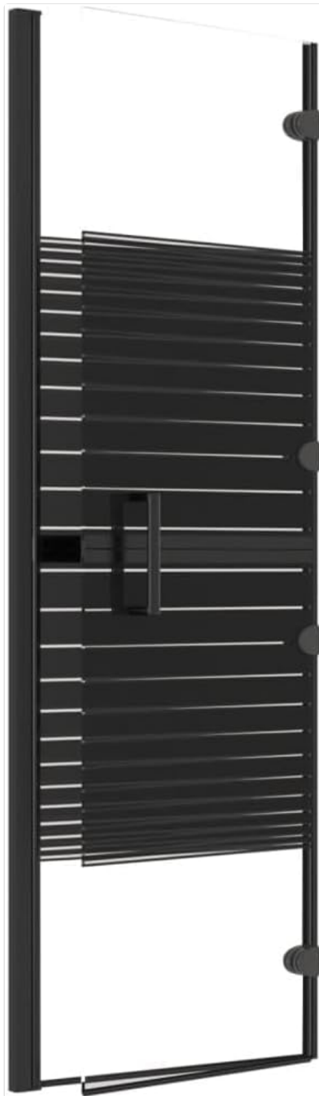
Figure 4: The shower enclosure in a partially folded state, demonstrating the access mechanism.