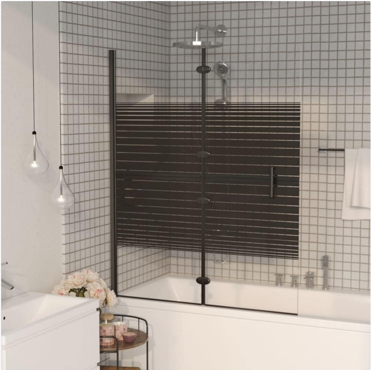
Figure 1: vidaXL Folding Shower Enclosure installed in a bathroom setting.