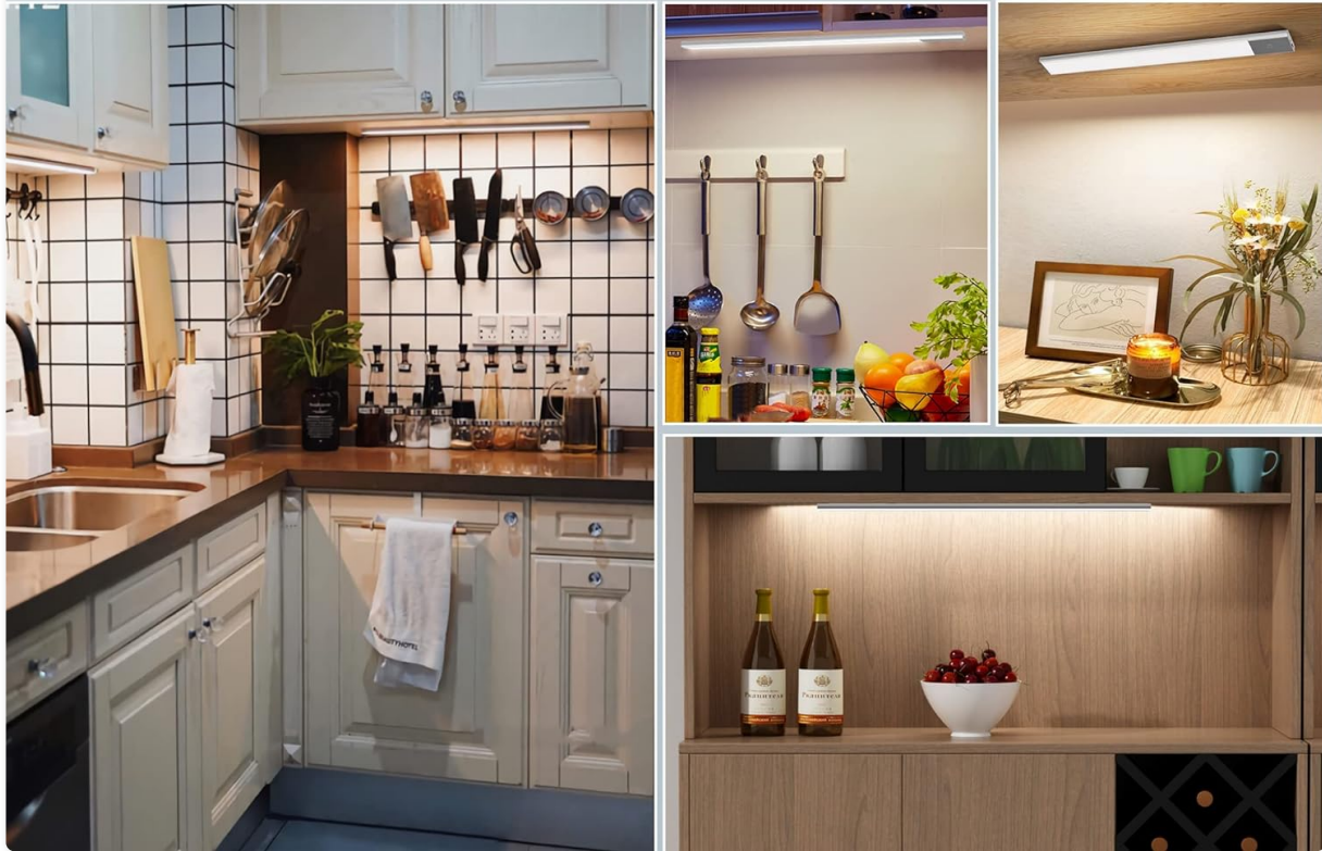
Image: A visual demonstration of the light's glare-free output, as seen through a phone camera.