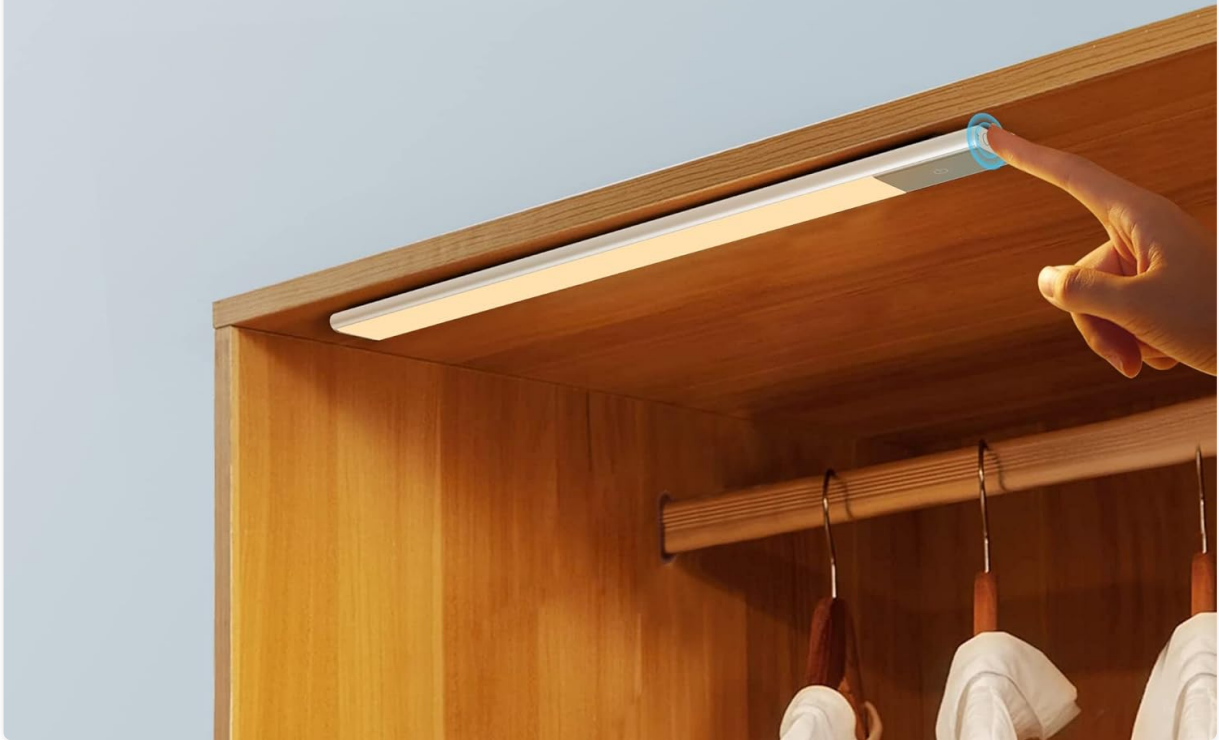
Image: Visual representation of the light dimming from 10% to 100% brightness, controlled by a long press on the touch area.