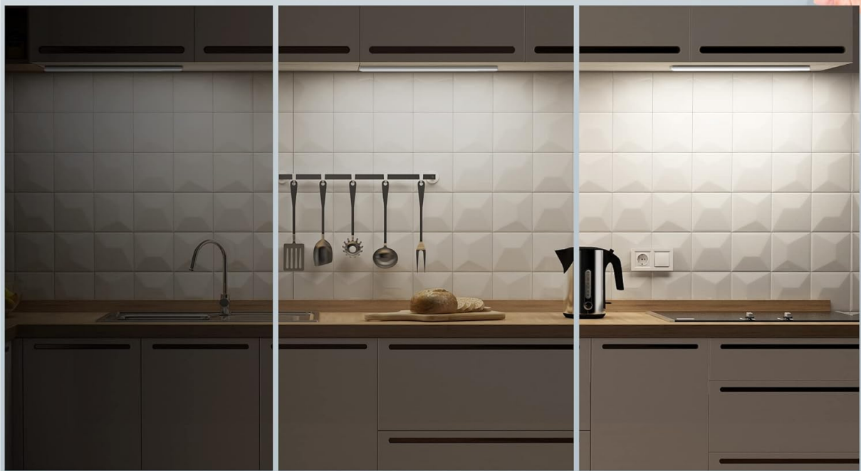
Image: The SOAIY 40cm Dimmable LED Cabinet Light, a sleek, silver-colored light bar.