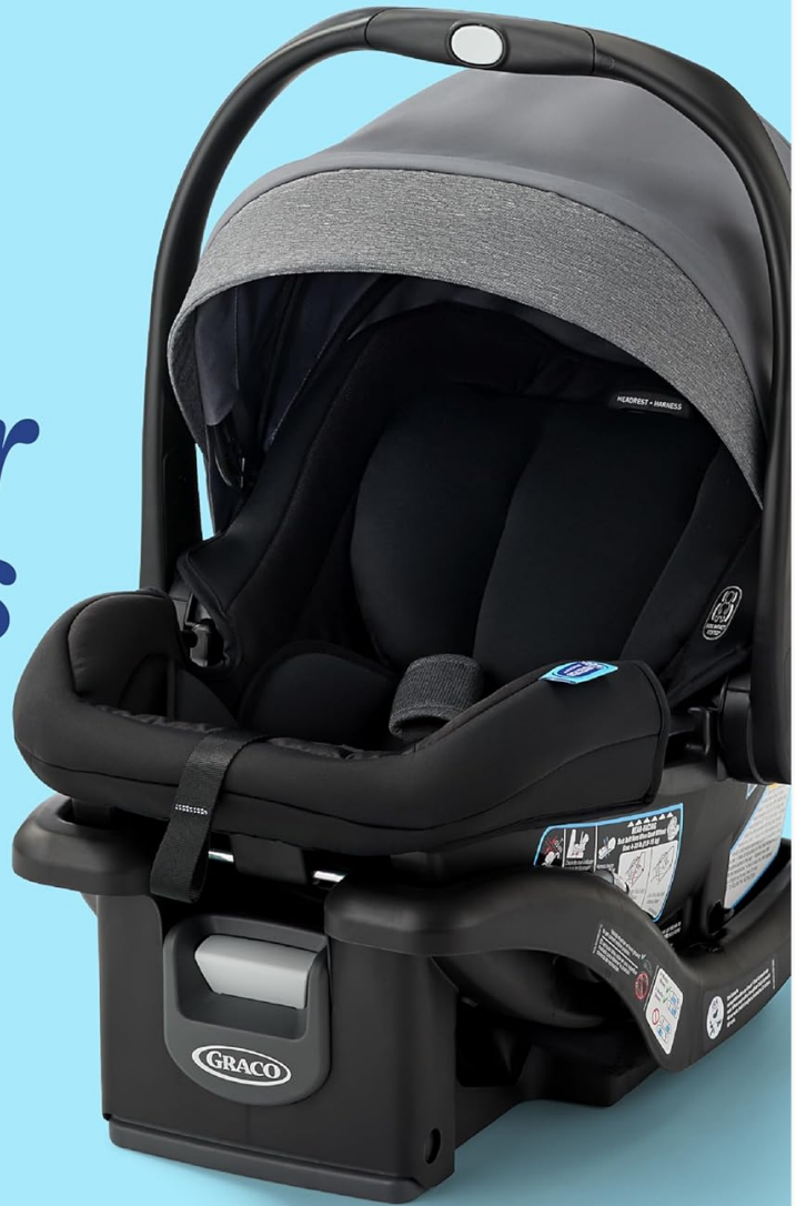
Image: The SnugRide 35 Lite Elite Infant Car Seat, designed for rear-facing infants.