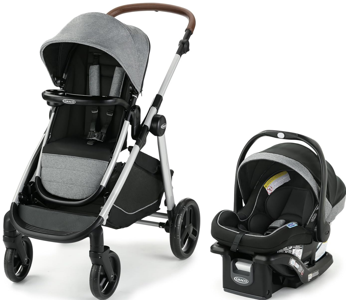
Image: The Graco Modes Nest2Grow Travel System, featuring the stroller and the SnugRide 35 Lite Elite Infant Car Seat.