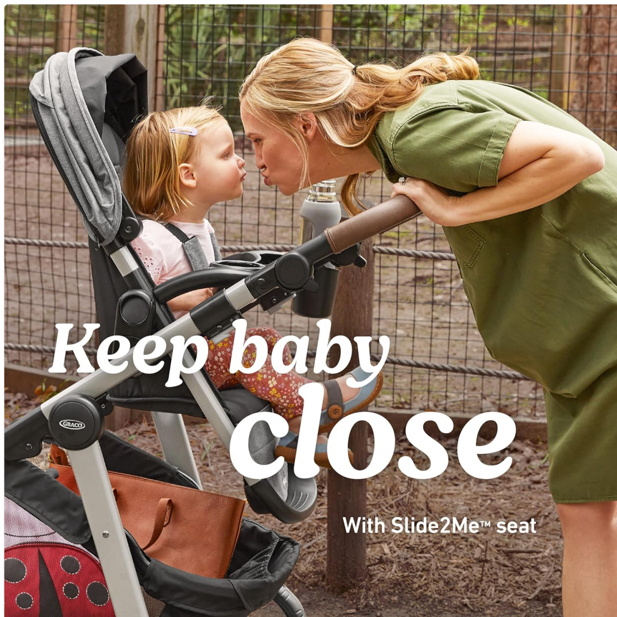
Image: A mother interacts with her baby in the stroller, demonstrating the Slide2Me seat in a raised position to bring the child closer.

The Slide2Me seat allows you to adjust the height of the toddler seat or infant car seat. Locate the adjustment mechanism on the side of the seat frame. Activate it to raise or lower the seat to one of the three available height positions, bringing your child closer or creating more space.