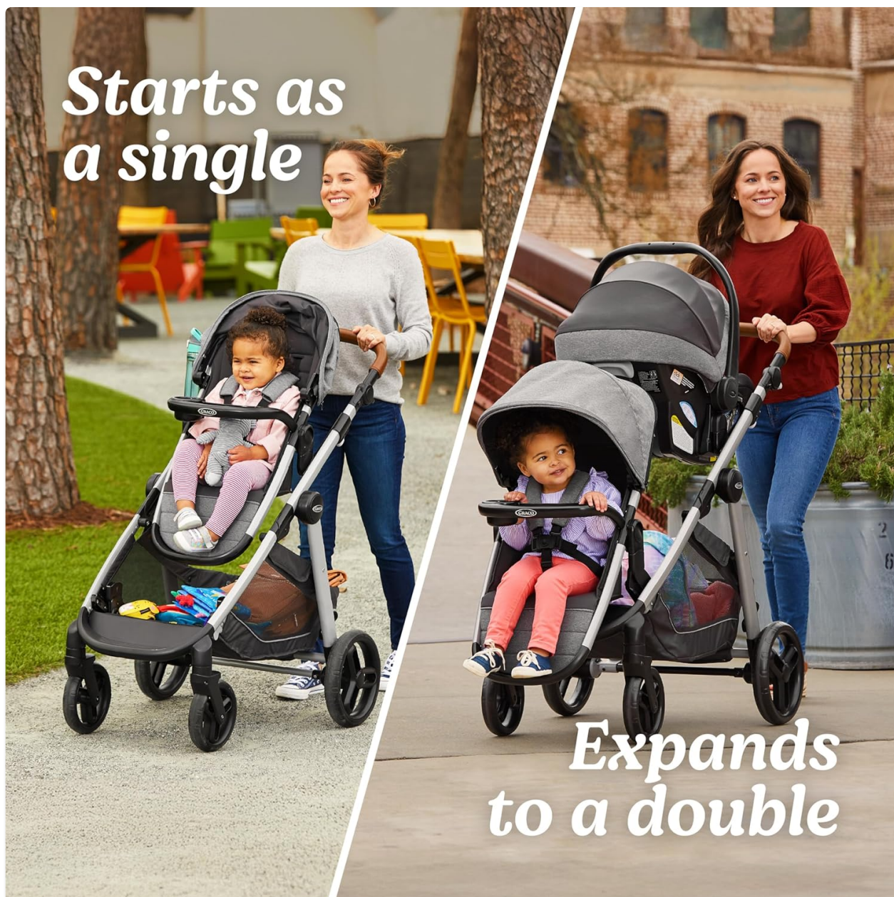
Image: Visual representation of the more than 15 possible configurations for the Graco Modes Nest2Grow Travel System, illustrating its versatility.