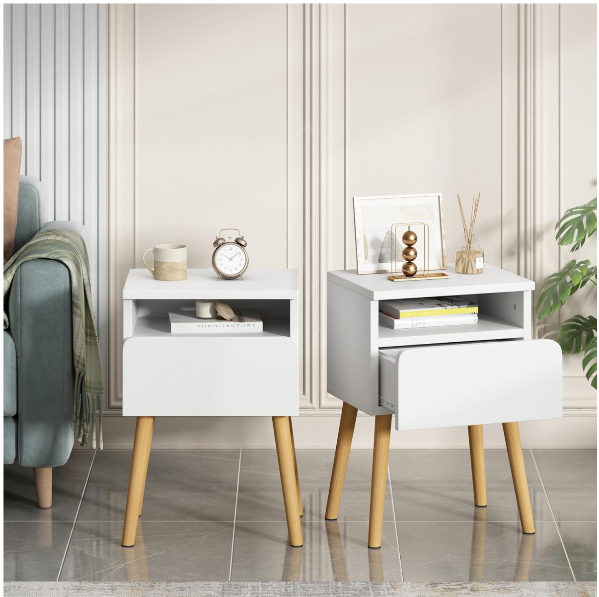
Image: Two JAXPETY Modern Wood Nightstands, one with an open drawer, in a modern living room setting.