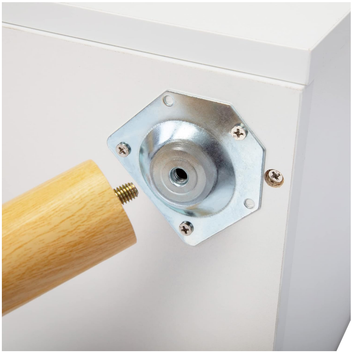
Image: Detail of leg attachment mechanism with a wooden leg and metal plate.