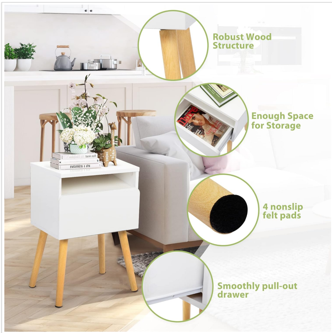
Image: Close-up of the leg with a felt pad and the drawer mechanism.