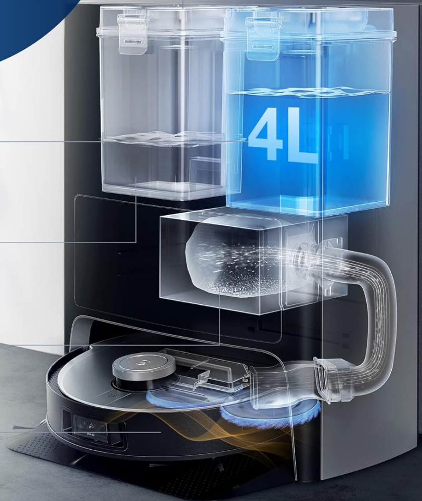
Image: Internal view of the OMNI Station showing water tanks and dust bag.