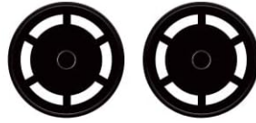
Mopping Pad Plates *1 Couple