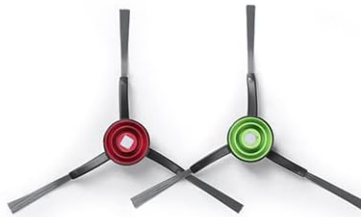
Side Brush*1 Couple