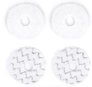
Mopping Pad *2 Couples