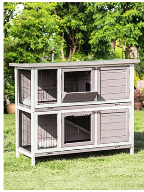
Figure 6: A rabbit demonstrating the use of the internal ramp for easy access between the hutch's levels.