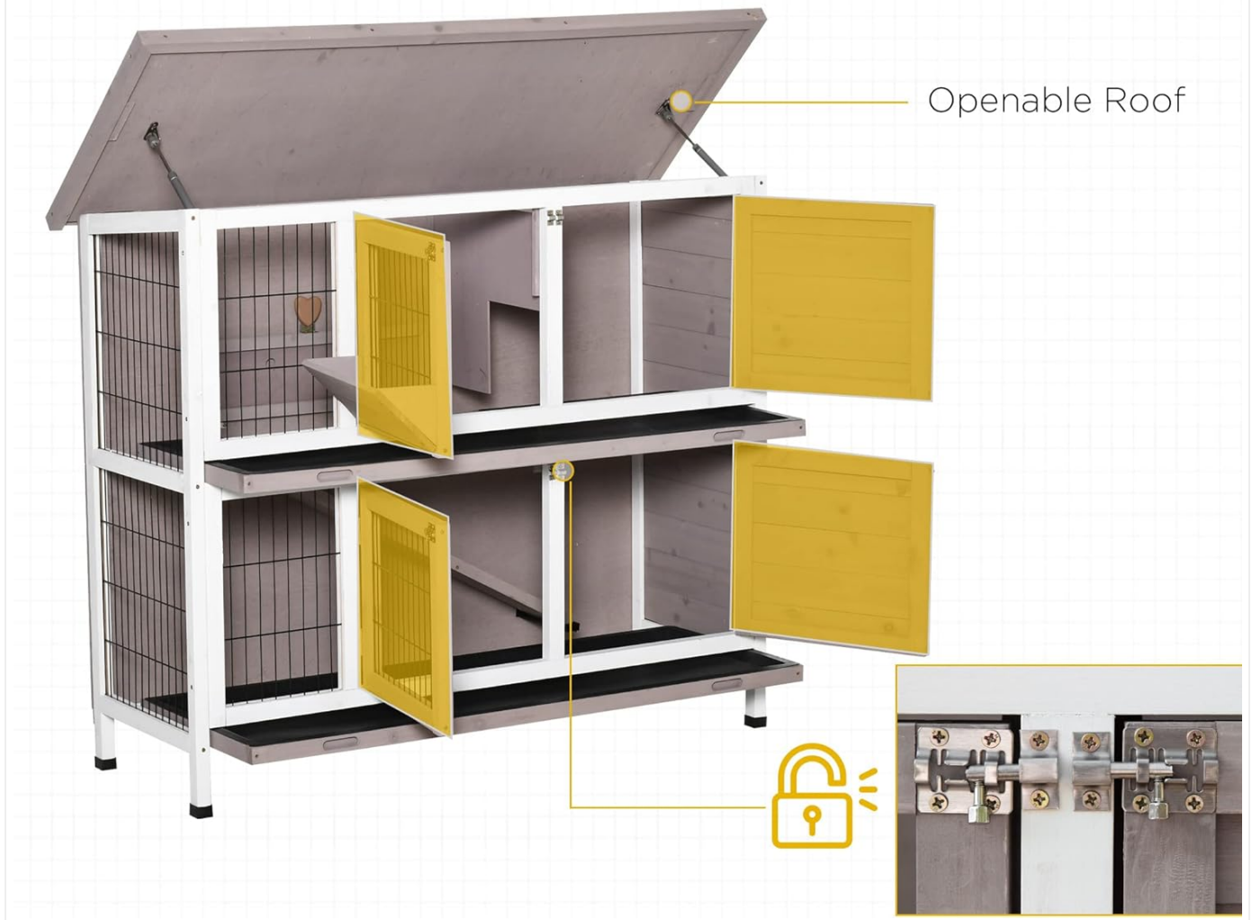
Figure 4: Illustration of the multiple lockable doors and the openable roof, providing easy access to your pets.