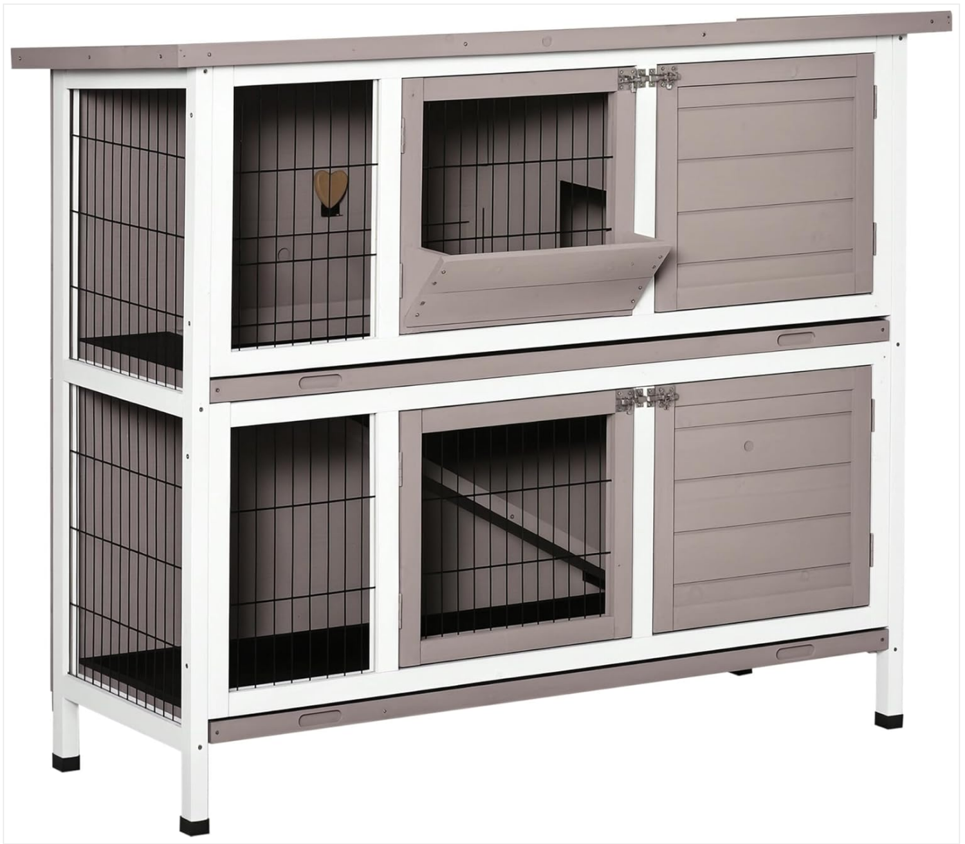
Figure 1: PawHut Indoor/Outdoor Rabbit Hutch, a two-tier design with multiple access points.