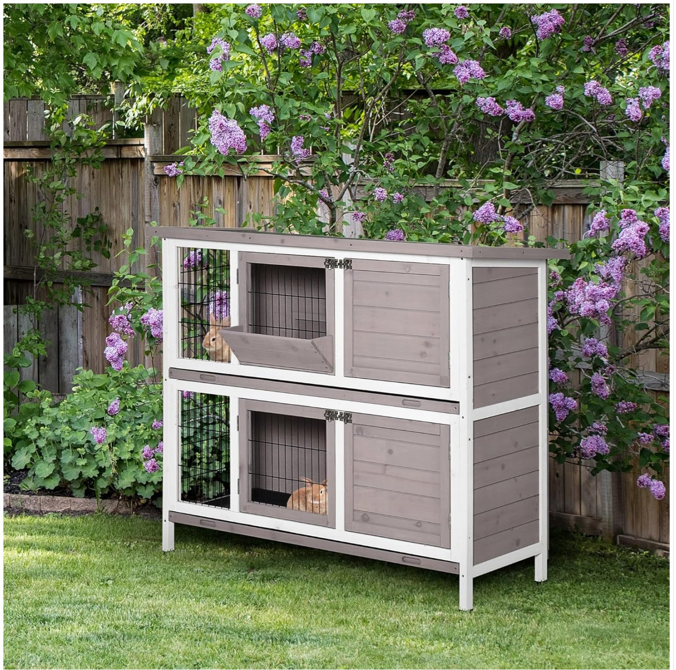
Figure 2: The hutch is suitable for both indoor and outdoor environments, designed to withstand various weather conditions.