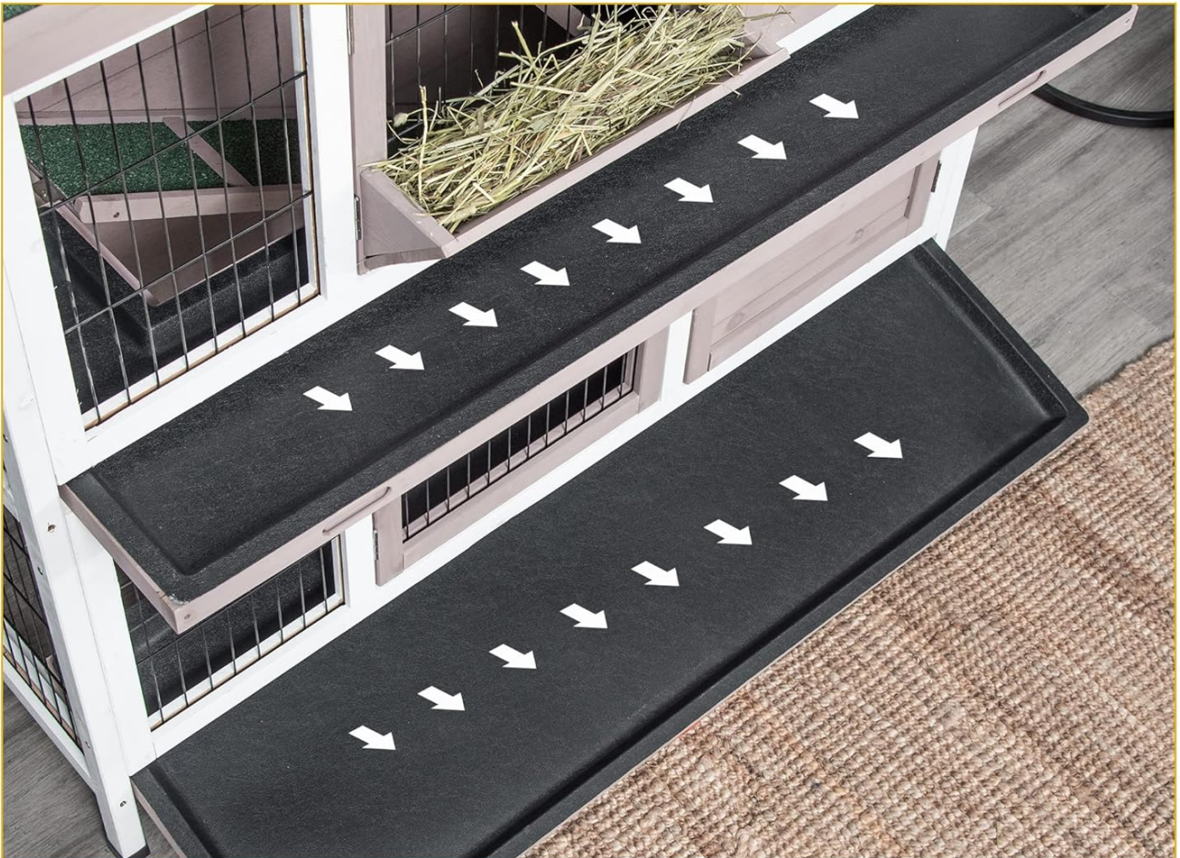
Figure 7: The removable plastic no-leak tray designed for easy cleaning and maintenance of the hutch.