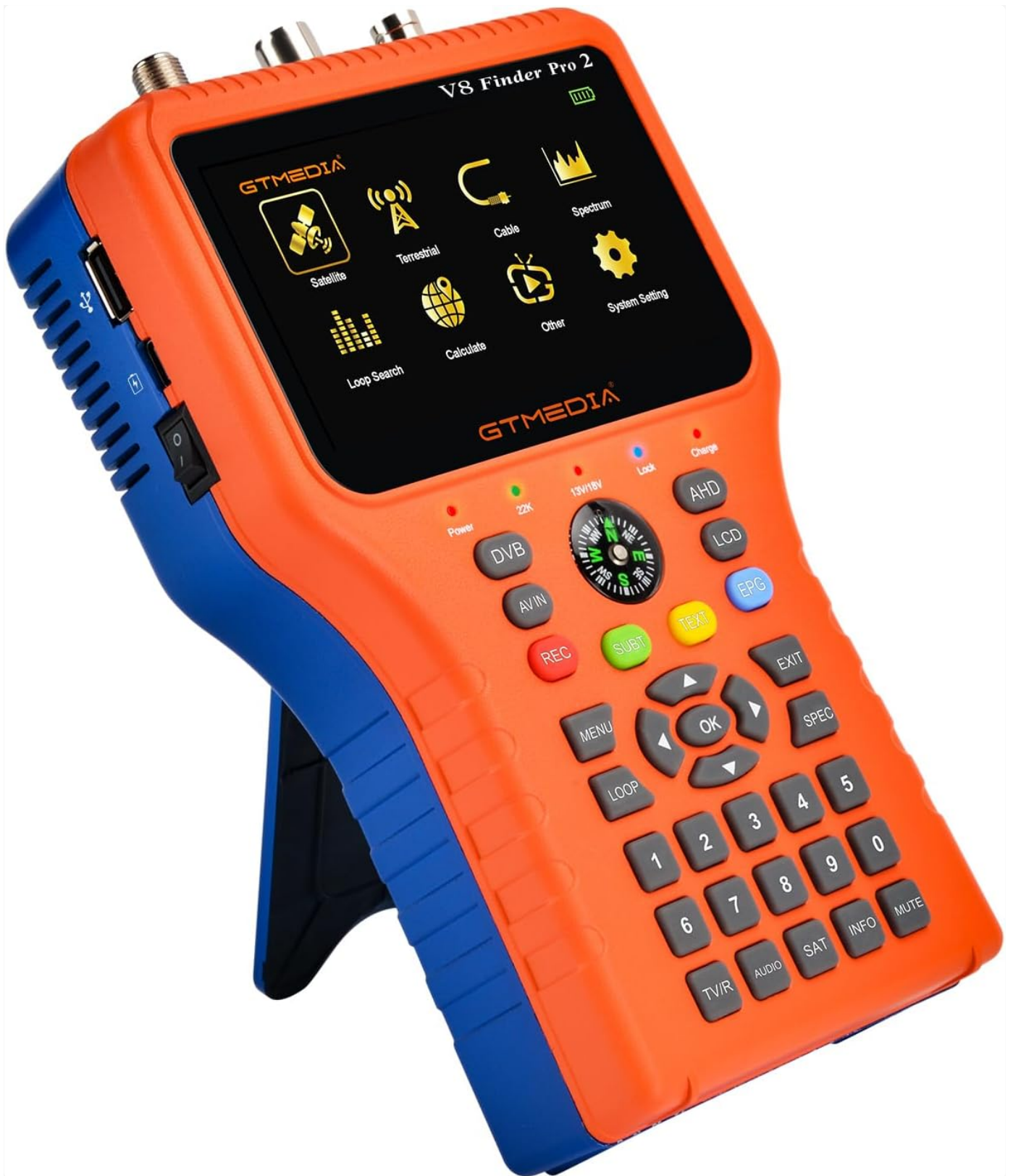
Figure 1.1: GTMEDIA V8 Finder Pro Satellite Finder Meter.