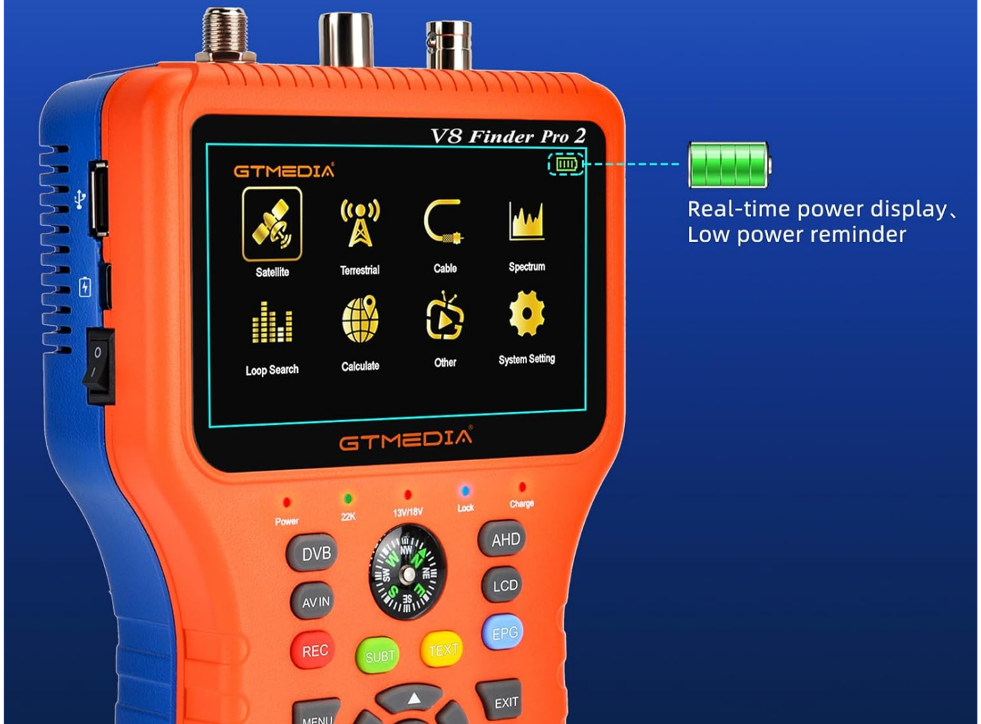
Figure 3.1: High Definition TFT LCD Screen with Power Display.