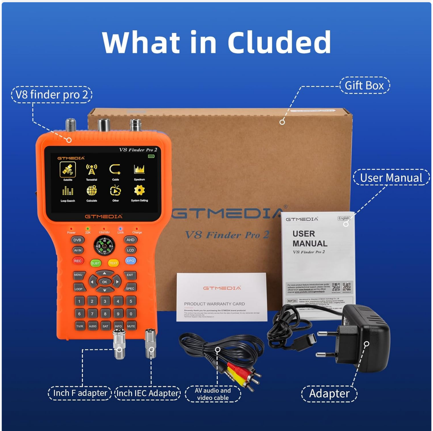
Figure 2.1: Package Contents.