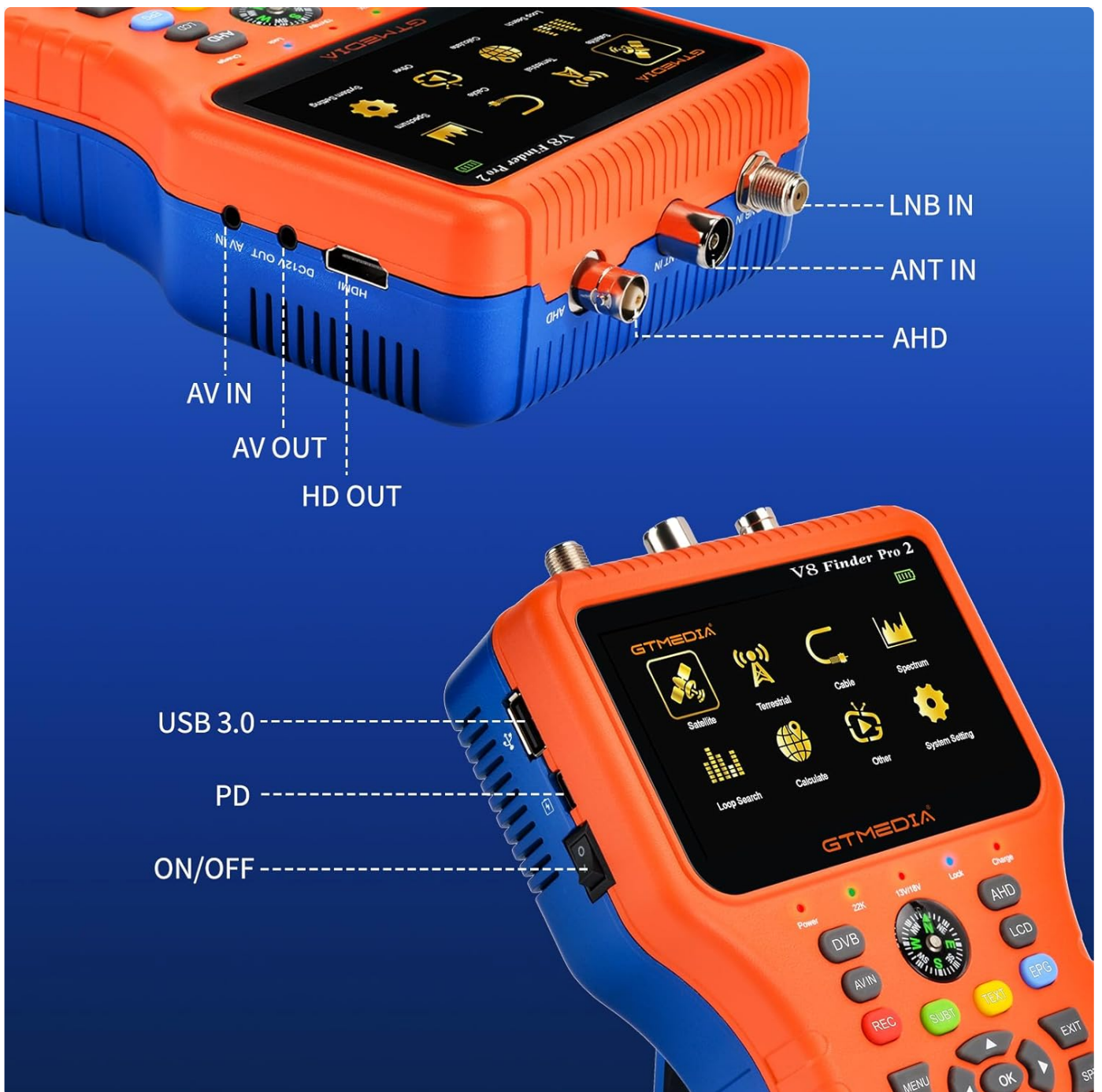
Figure 3.2: Device Ports and Connections.