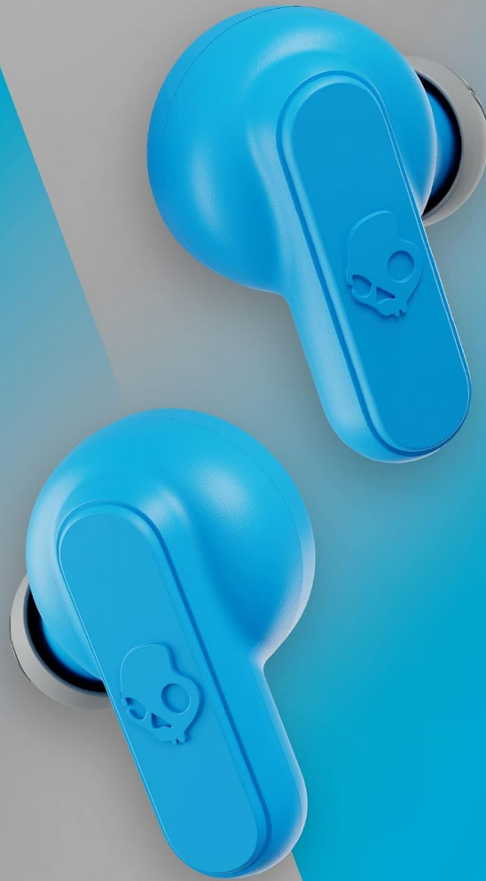
Image: Skullcandy Dime 2 earbuds highlighting Tile finding technology.