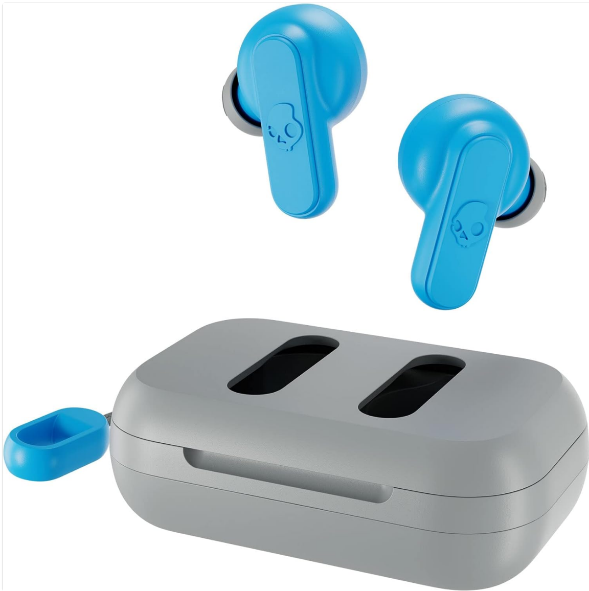
Image: Skullcandy Dime 2 Wireless Earbuds and Charging Case.