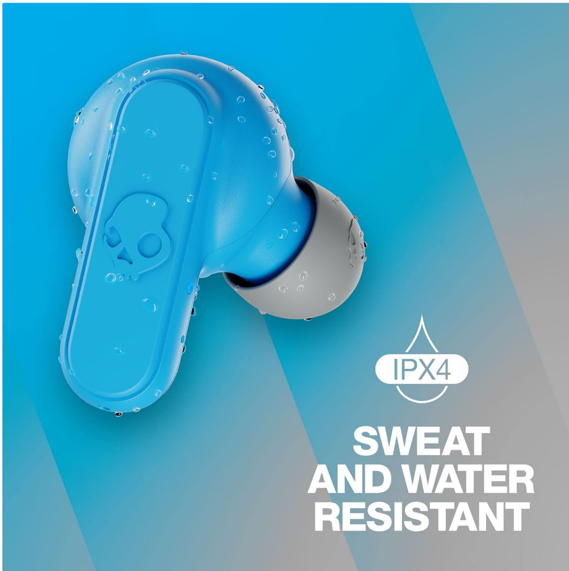
Image: Detail of the earbud control button.