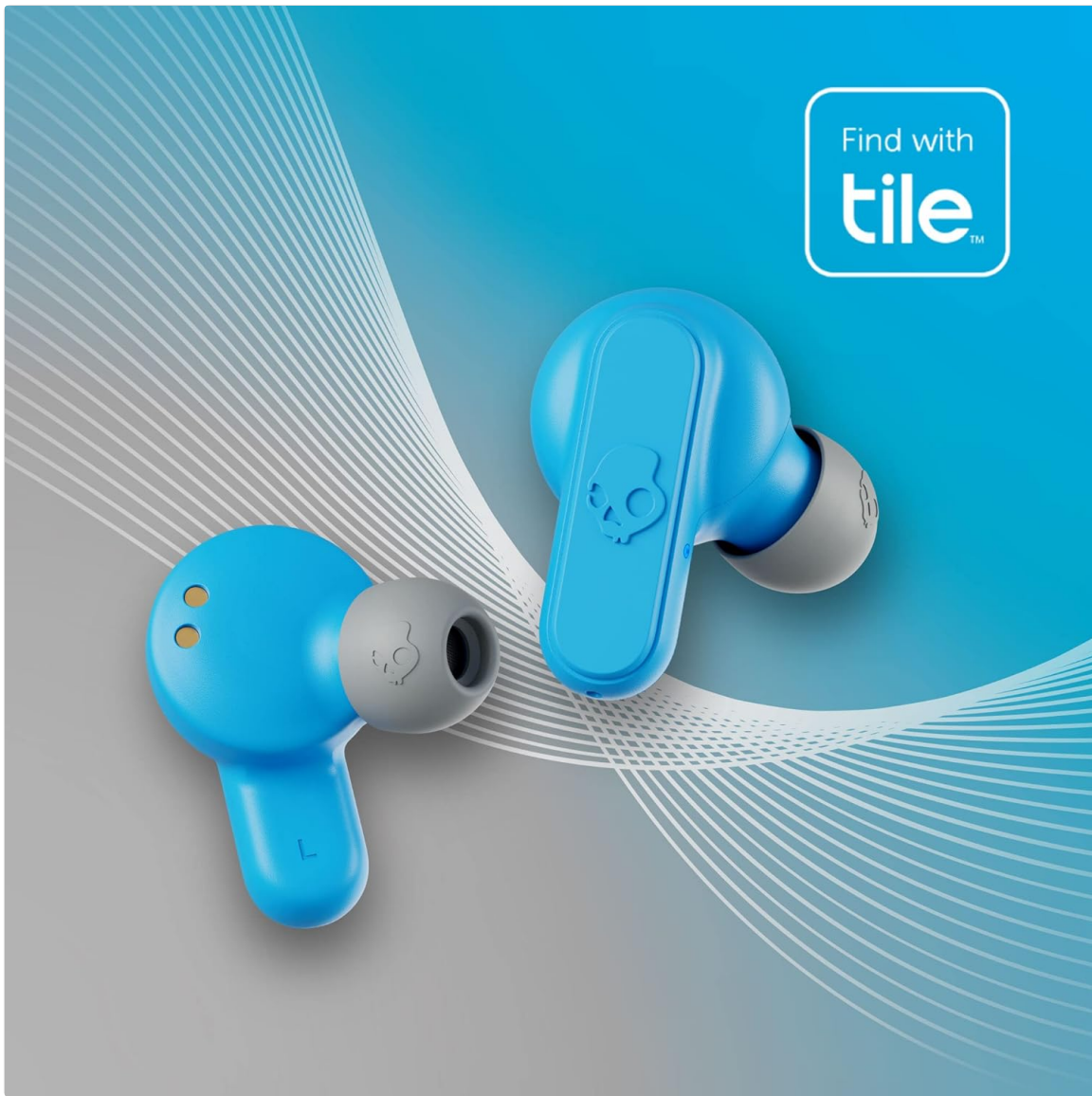
Image: Skullcandy Dime 2 earbuds with various ear tip options.