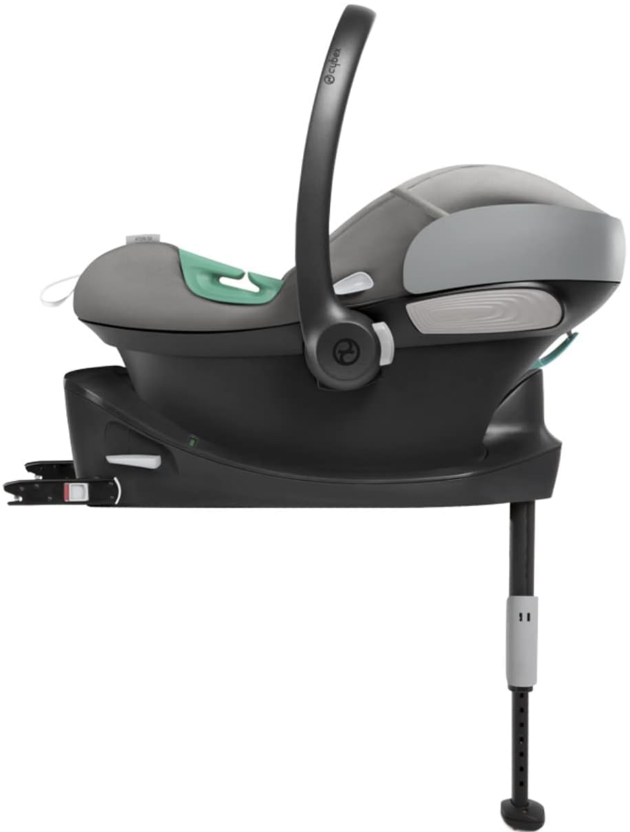
Figure 3: Side view of the Cybex ATON S2 i-Size car seat correctly installed on an ISOFIX base, showing the extended load leg.