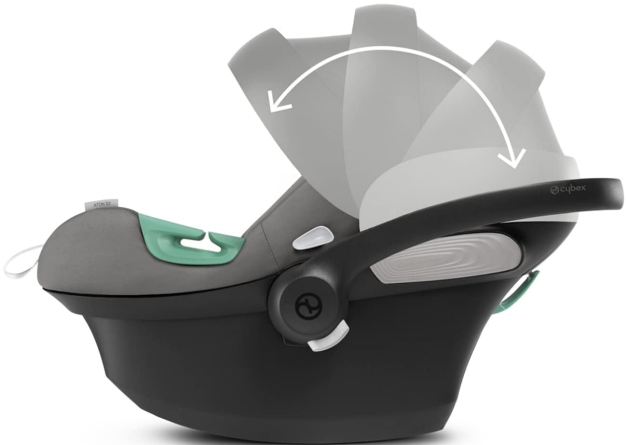
Figure 7: Side view of the Cybex ATON S2 i-Size, demonstrating the adjustable sun canopy in various positions, indicated by the curved arrow.

The integrated sun canopy can be adjusted independently. Simply pull it forward or push it back to provide shade for your child. It offers UPF50+ sun protection.