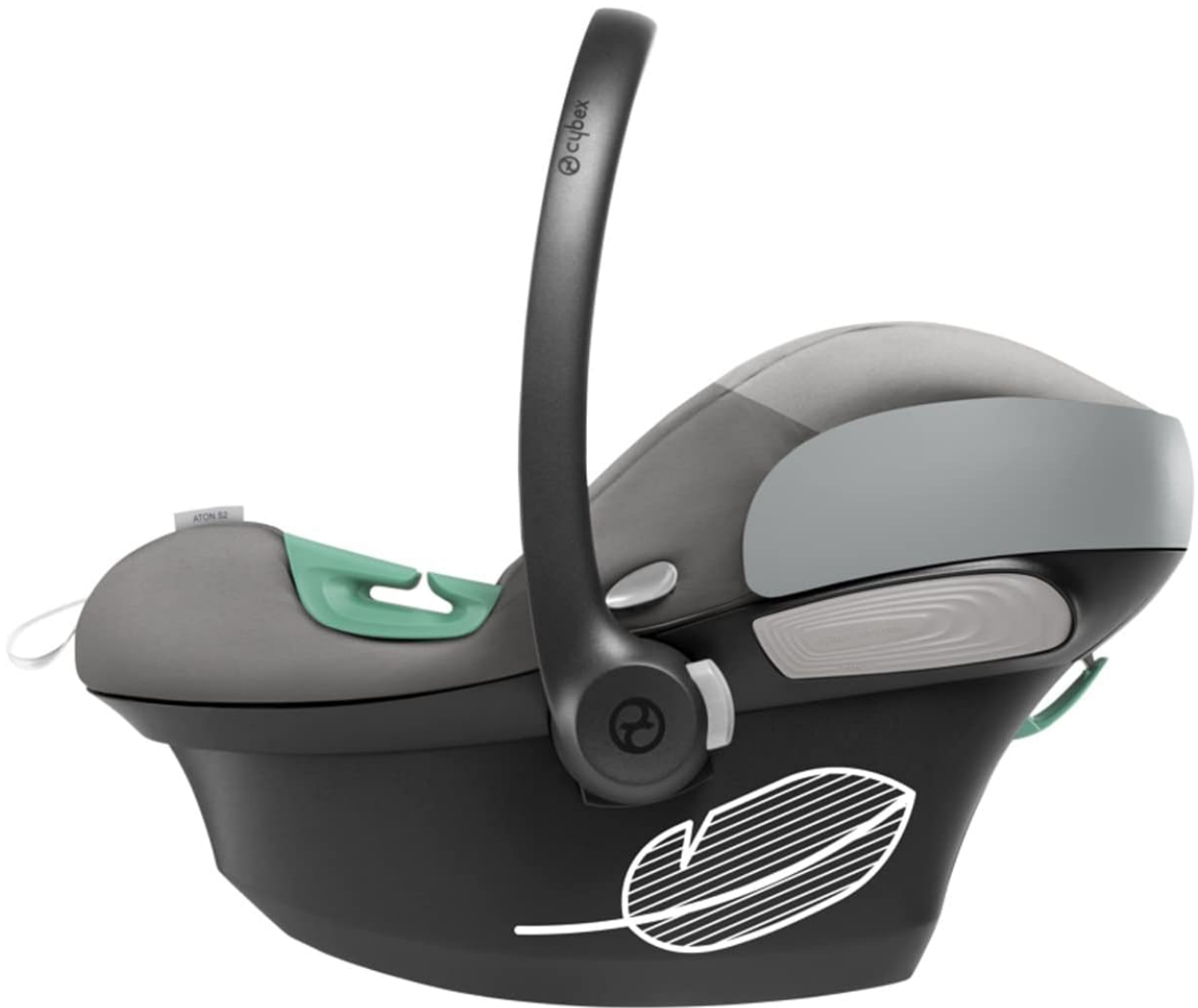
Figure 2: The Cybex ATON S2 i-Size infant car seat with its carrying handle in the upright position, suitable for transport.