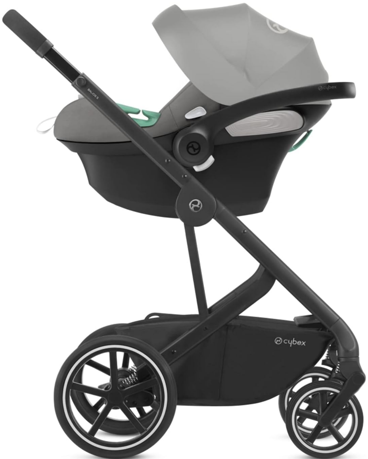
Figure 9: The Cybex ATON S2 i-Size infant car seat mounted on a compatible Cybex stroller frame, demonstrating its travel system functionality.