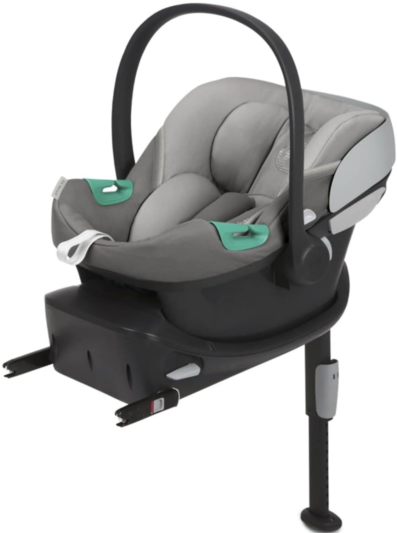
Figure 4: Front angle view of the Cybex ATON S2 i-Size car seat securely attached to an ISOFIX base, ready for use.