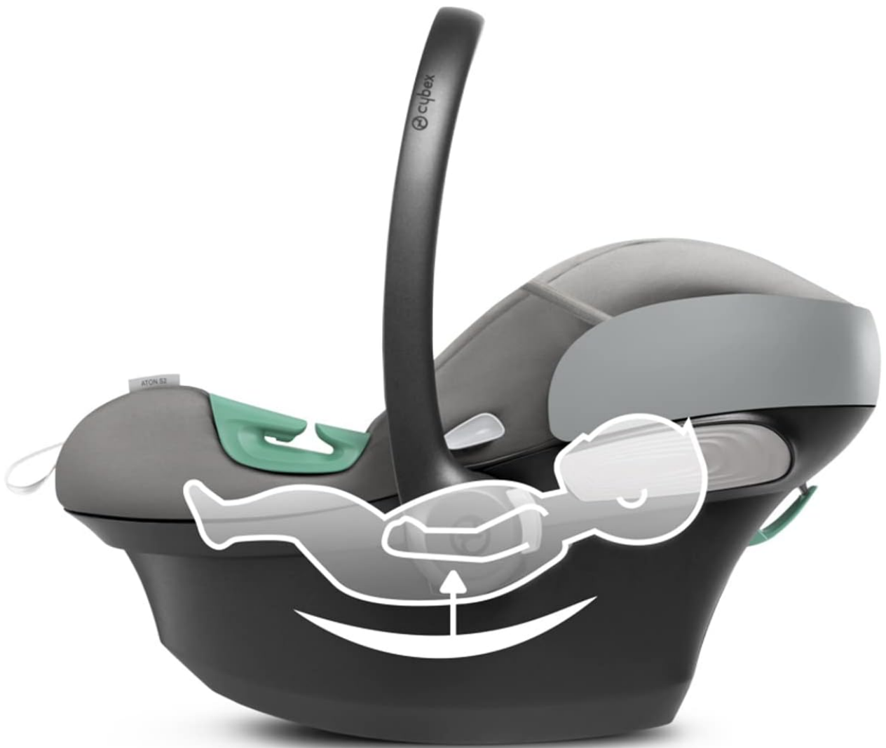
Figure 8: Side view of the Cybex ATON S2 i-Size, illustrating the lie-flat position with a graphic representation of an infant lying comfortably.