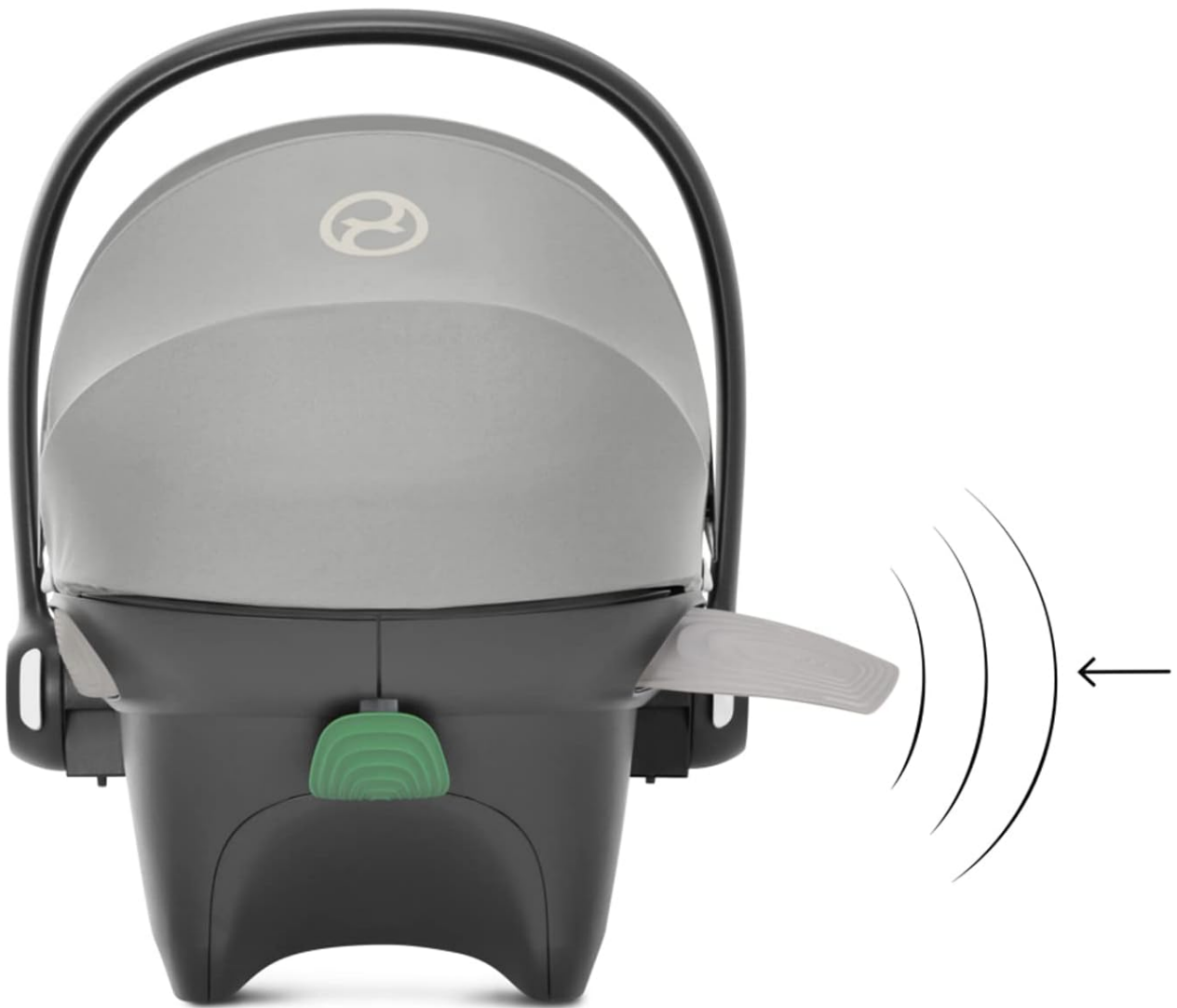
Figure 1: Side view of the Cybex ATON S2 i-Size infant car seat, showing its general shape and carrying handle in a lowered position.