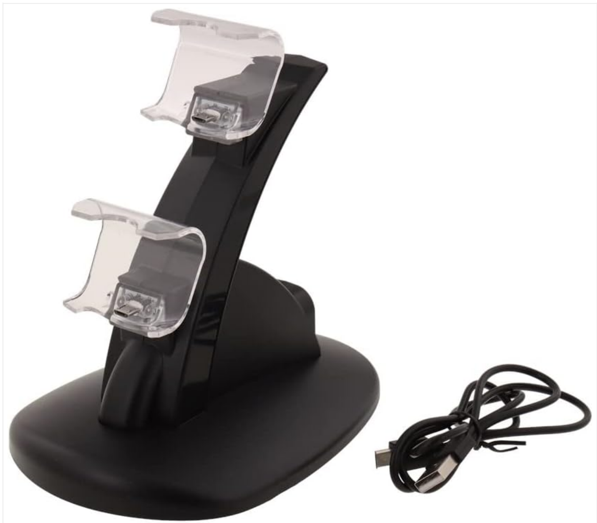
Figure 2.2: The Battletron Dual Charging Dock itself, shown with its included USB charging cable. The dock features two clear plastic cradles for controllers.