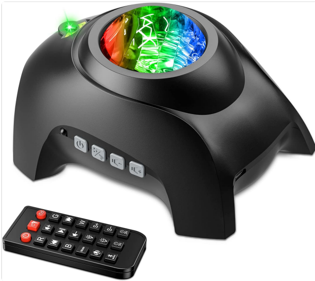
The Rossetta Star Projector and its accompanying remote control, showing the device's buttons and light output.