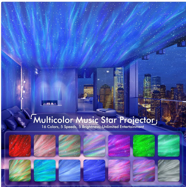
A room illuminated by the Rossetta Star Projector, showcasing the vibrant galaxy and star display on the ceiling and walls.