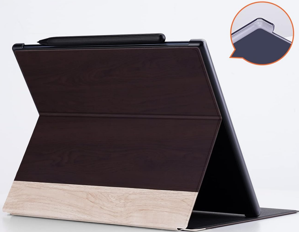
Figure 2: Precise Cutouts and Perfect Fit. The case is designed to align perfectly with device ports and features.