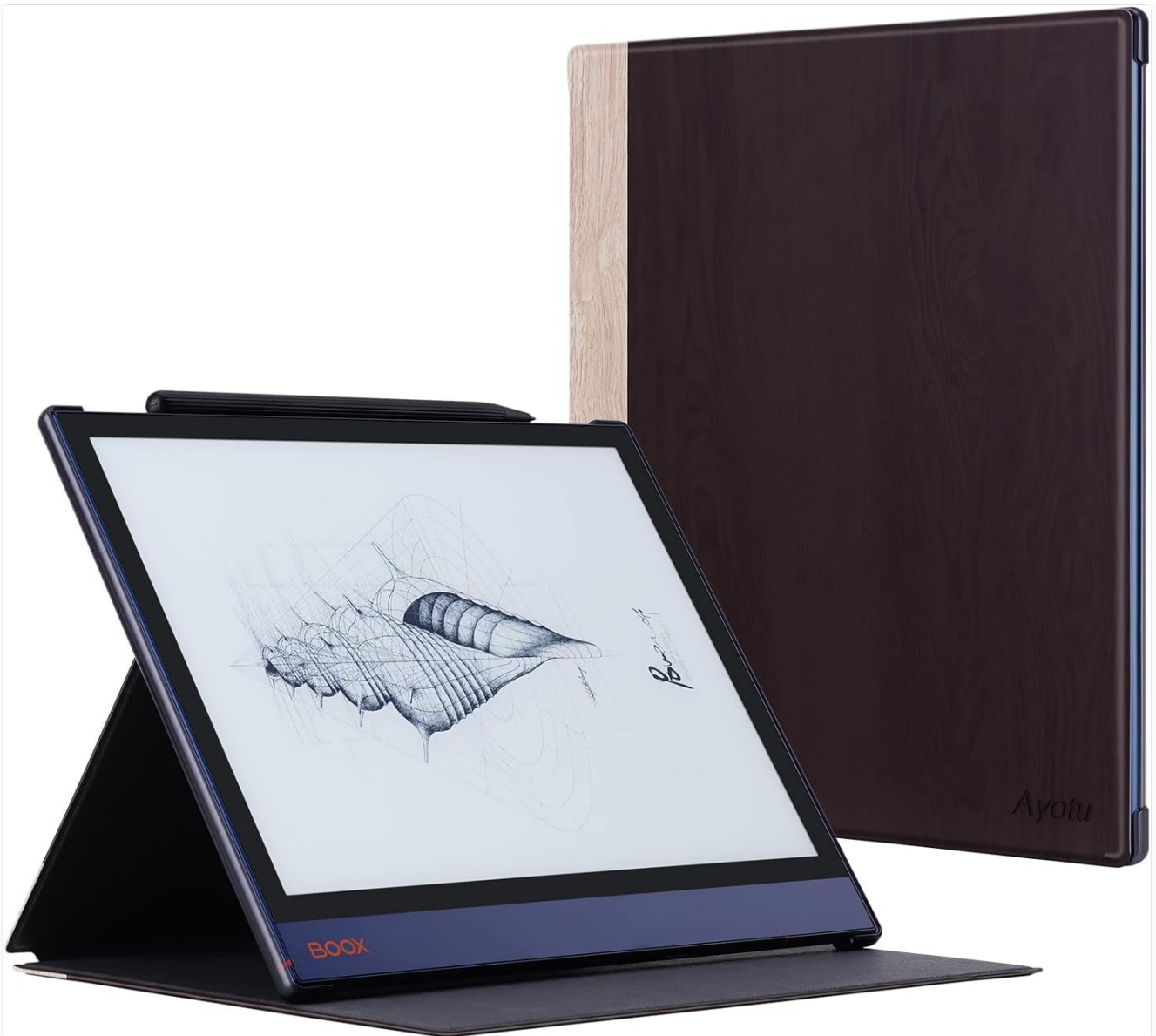
Figure 5: Device installed in the OLAIKE case, showcasing the overall fit and design.