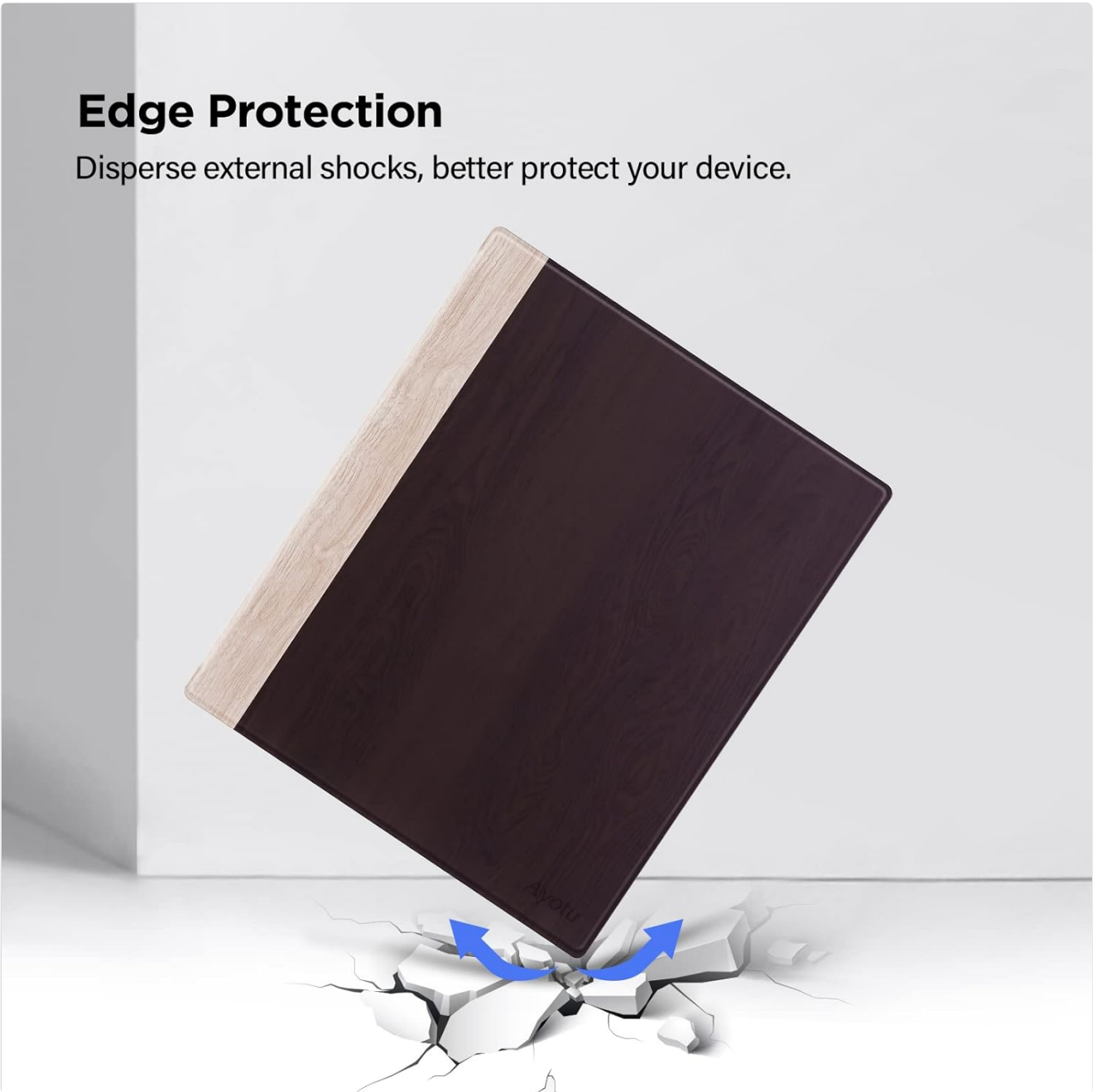
Figure 3: Edge Protection. The case disperses external shocks to better protect your device.

Disperse external shocks, better protect your device.