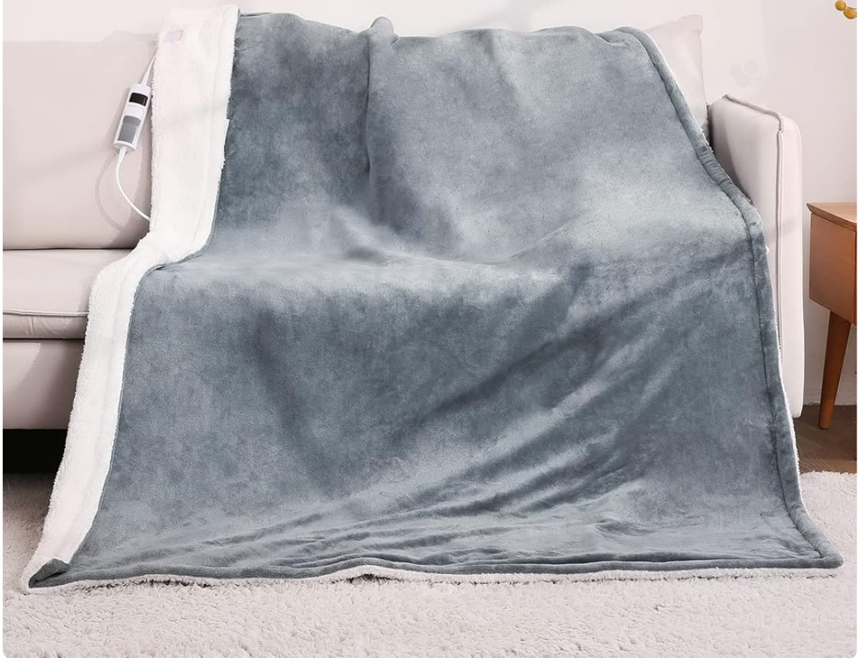
Image: The blanket measures 180x130 cm, suitable for various uses.