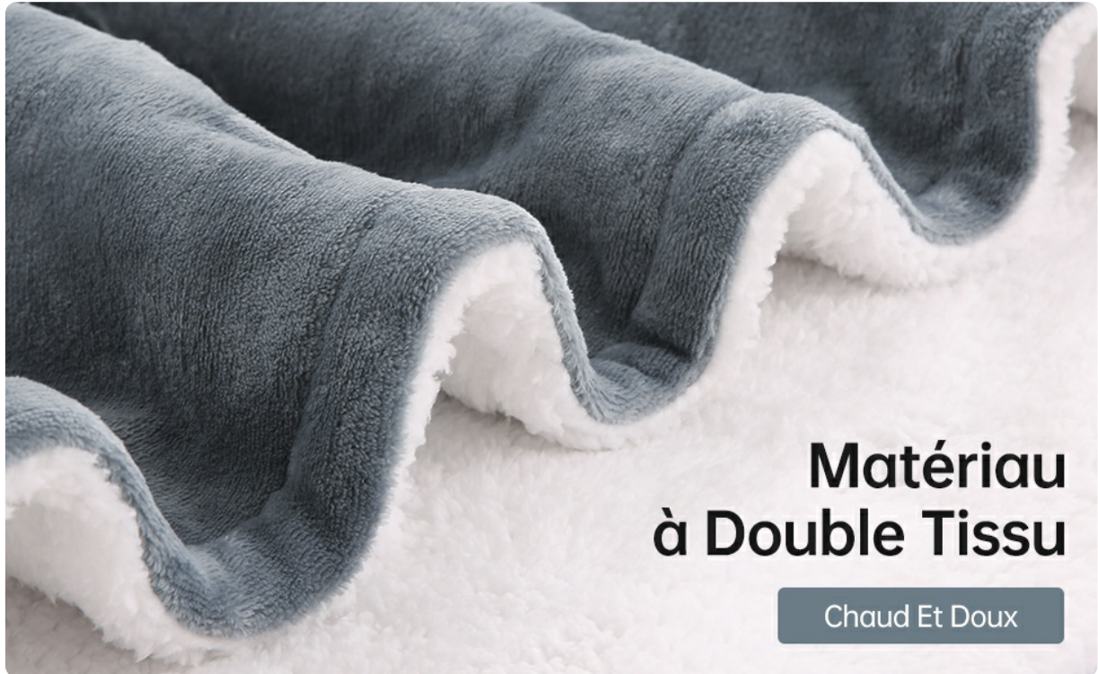
Image: The blanket features a soft, double-layered fabric for enhanced comfort.