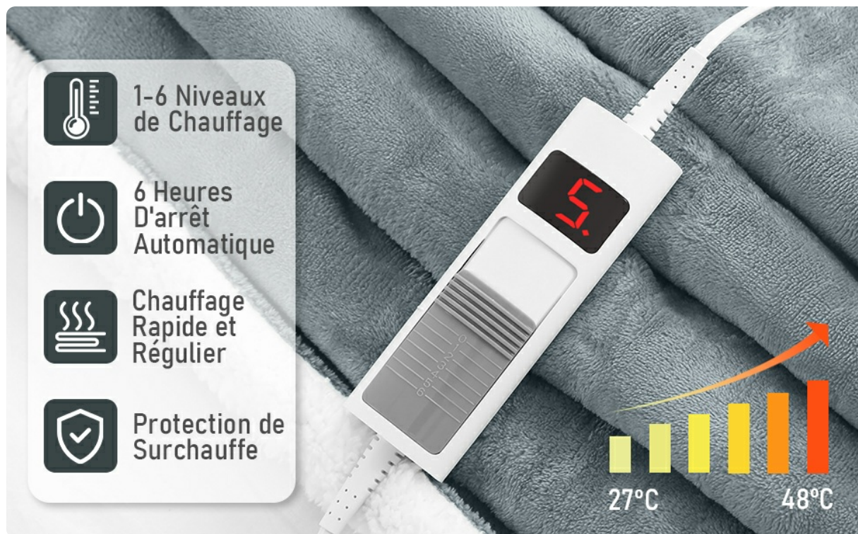
Image: The controller features an LED display for heat settings and an auto-off timer.