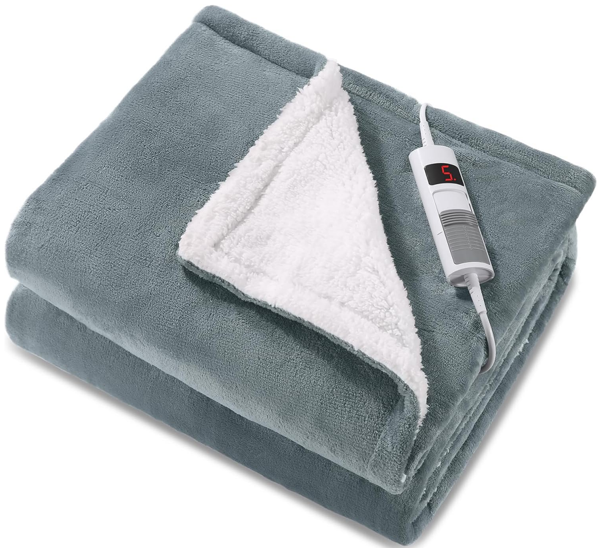
Image: The package includes the heated blanket and its control unit.