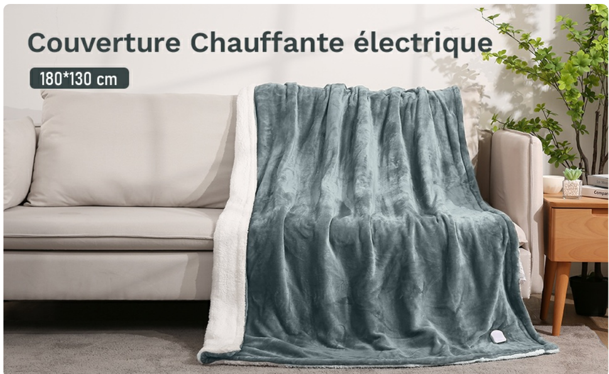
Image: The CURECURE Electric Heated Blanket provides warmth and comfort for various relaxation activities.

Thank you for choosing the CURECURE Electric Heated Blanket. This manual provides essential information for the safe and effective use, maintenance, and troubleshooting of your new heated blanket. Please read all instructions carefully before first use and retain this manual for future reference.