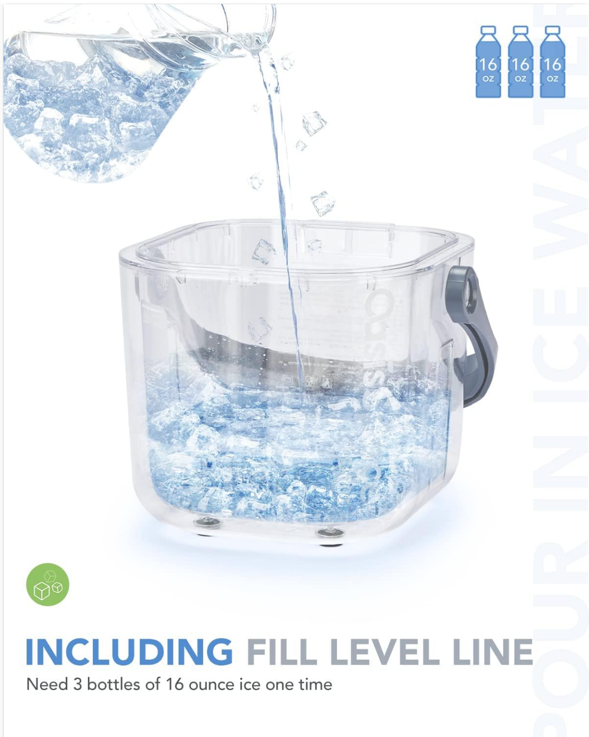
Image: Proper filling of the unit with ice and water.