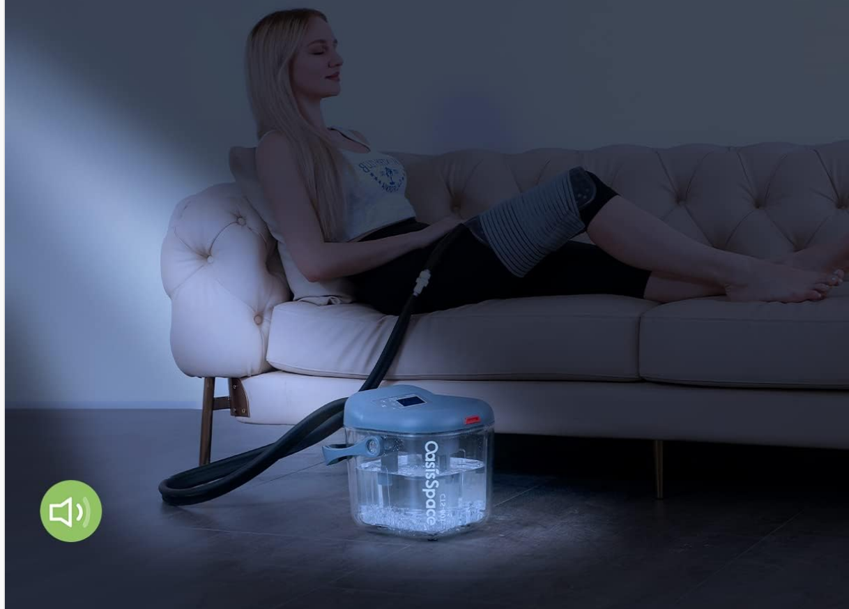
Image: Versatile application of the therapy pads on different body areas.