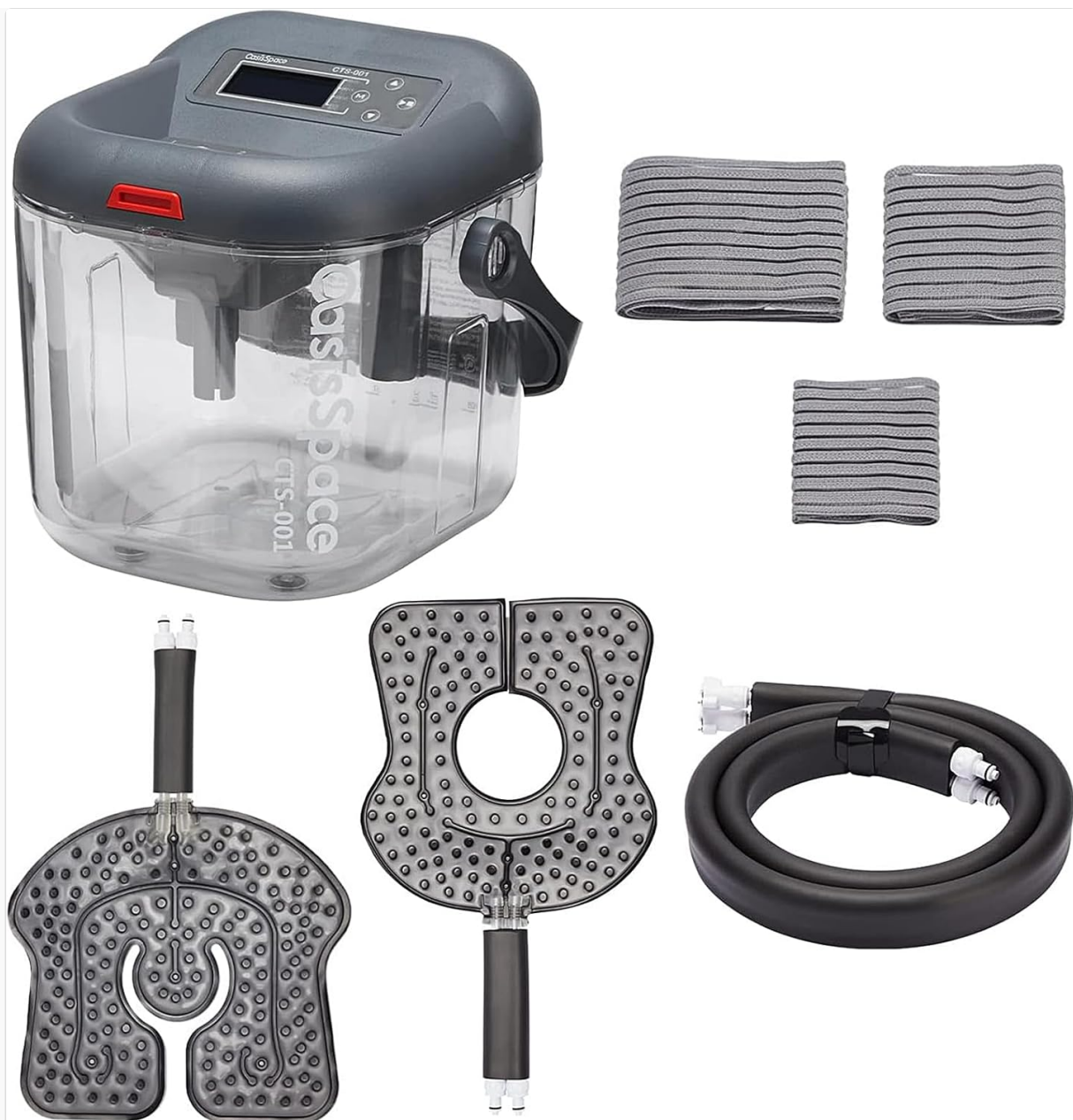
Image: All components included in the OasisSpace Cold Therapy Machine package.