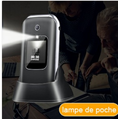
Image: The phone highlighting its loud ringtone, large font display, and oversized keypad buttons for enhanced visibility and ease of use.

dial, FM radio, camera, alarm, Bluetooth, and calculator.