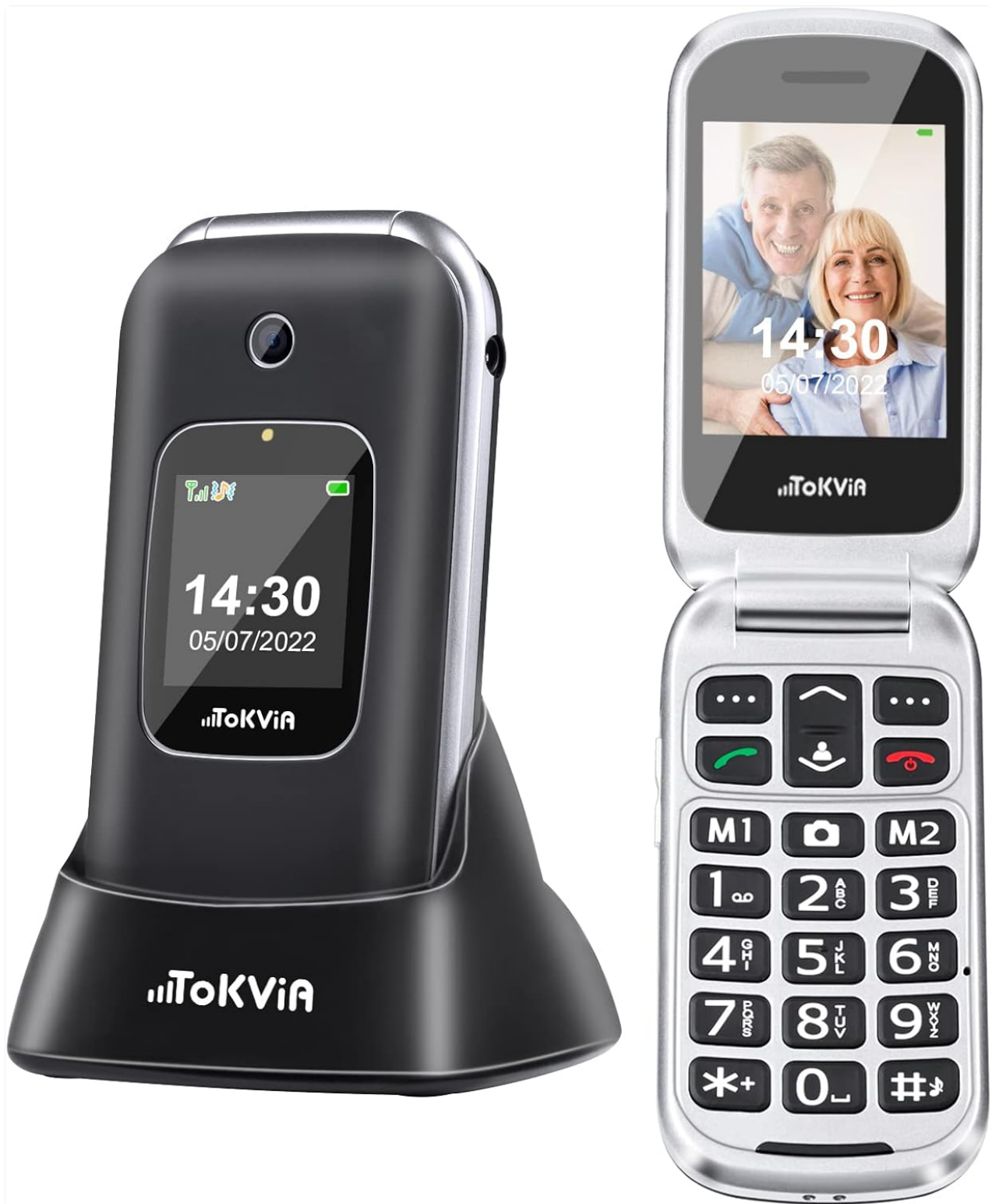
Image: The TOKVIA T221 Flip Phone shown alongside its dedicated charging dock.