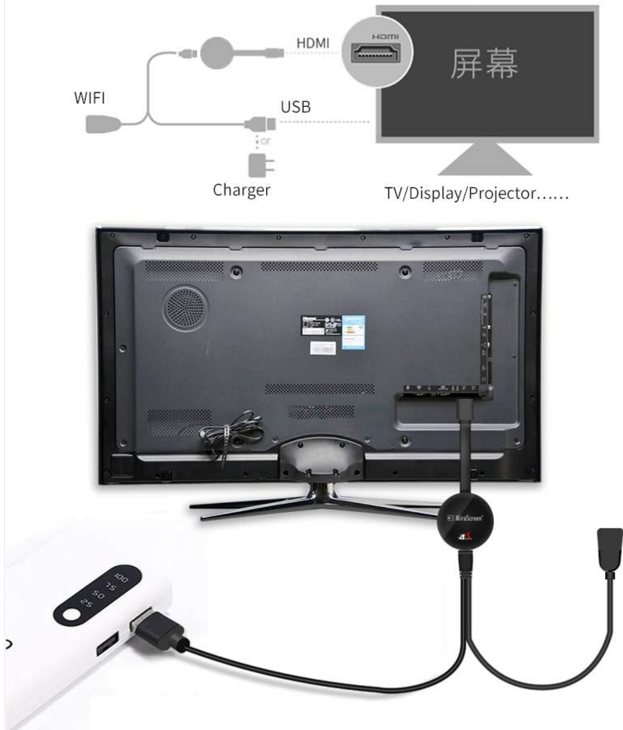
Image: The MiraScreen G7 Plus dongle demonstrating its wide compatibility with various operating systems and devices.

Easy to connect, great for family entertainment External antenna for better signal integrity