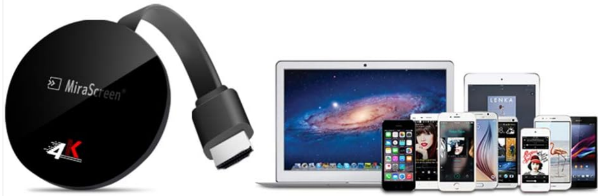
Image: Playing mobile games on a large screen, demonstrating low-latency screen mirroring for an immersive gaming experience.

Supports iOS 8.0+, Windows 8.1+, MacOS 10+, Android 4.2+ and Miracast protocol, also supports HD displays such as laptops, HDTVs, projectors.