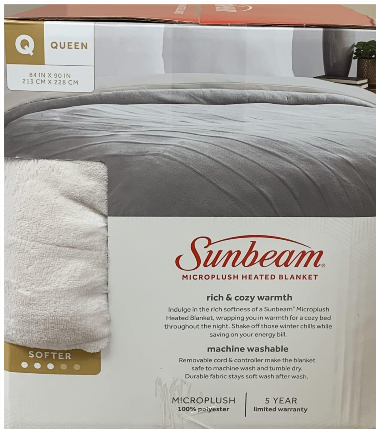
Image: Product packaging highlighting 'rich & cozy warmth' and 'machine washable' features. The packaging also indicates 'Queen' size and dimensions of 84 in x 90 in.