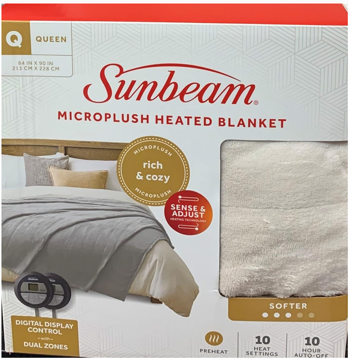
Image: Sunbeam Microplush Queen Electric Heated Blanket in Seashell color.