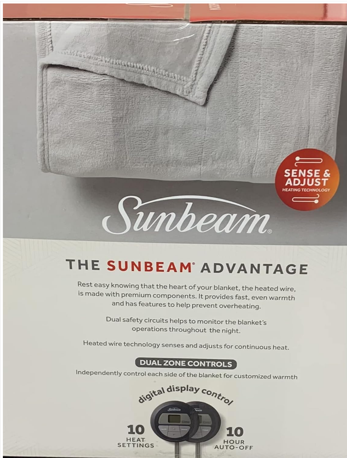
Image: Product packaging detailing 'The Sunbeam Advantage' with 'Sense & Adjust Heating Technology', 'Dual Zone Controls', and 'Digital Display Control' showing 10 heat settings and 10-hour auto-off.