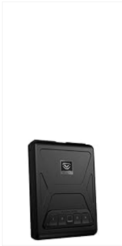
Image: Two backup manual keys provided for manual access.