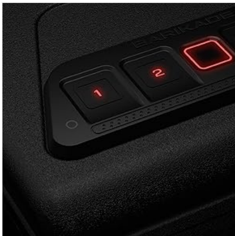
Image: User interacting with the Smart Sense Digital Keypad, which includes the biometric scanner.