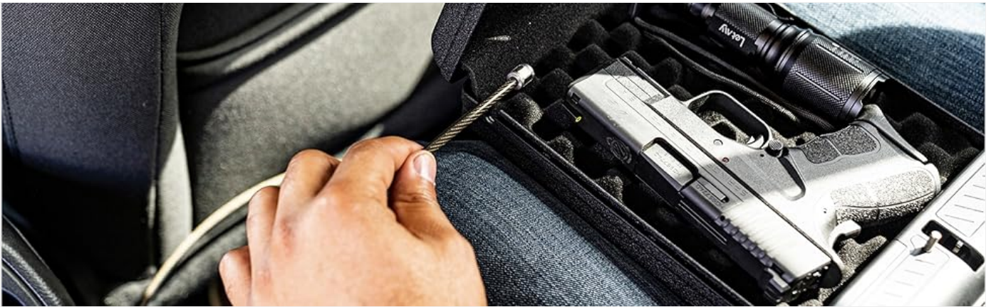
Image: The safe secured with the steel security cable in a car interior.

An included steel security cable allows you to tether the safe to a fixed object, preventing its removal. This is particularly useful for securing the safe in vehicles or temporary locations.