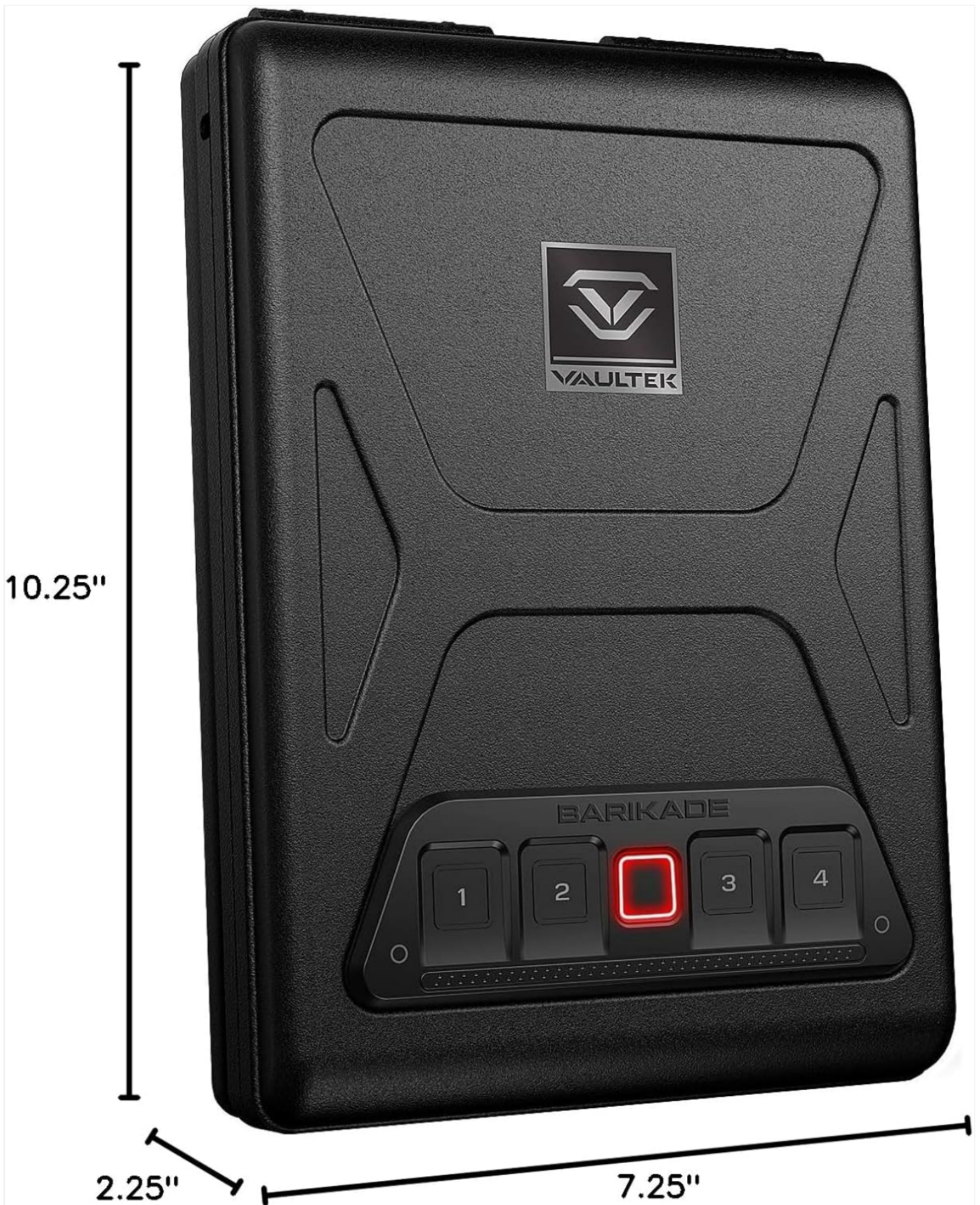
Image: Visual representation of the safe's dimensions: 10.25"D x 7.25"W x 2.25"H.