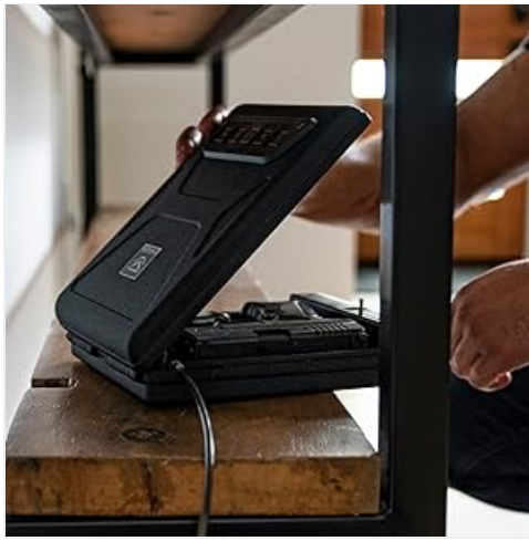
Image: Detail of the safe's anti-theft construction, highlighting reinforced areas.