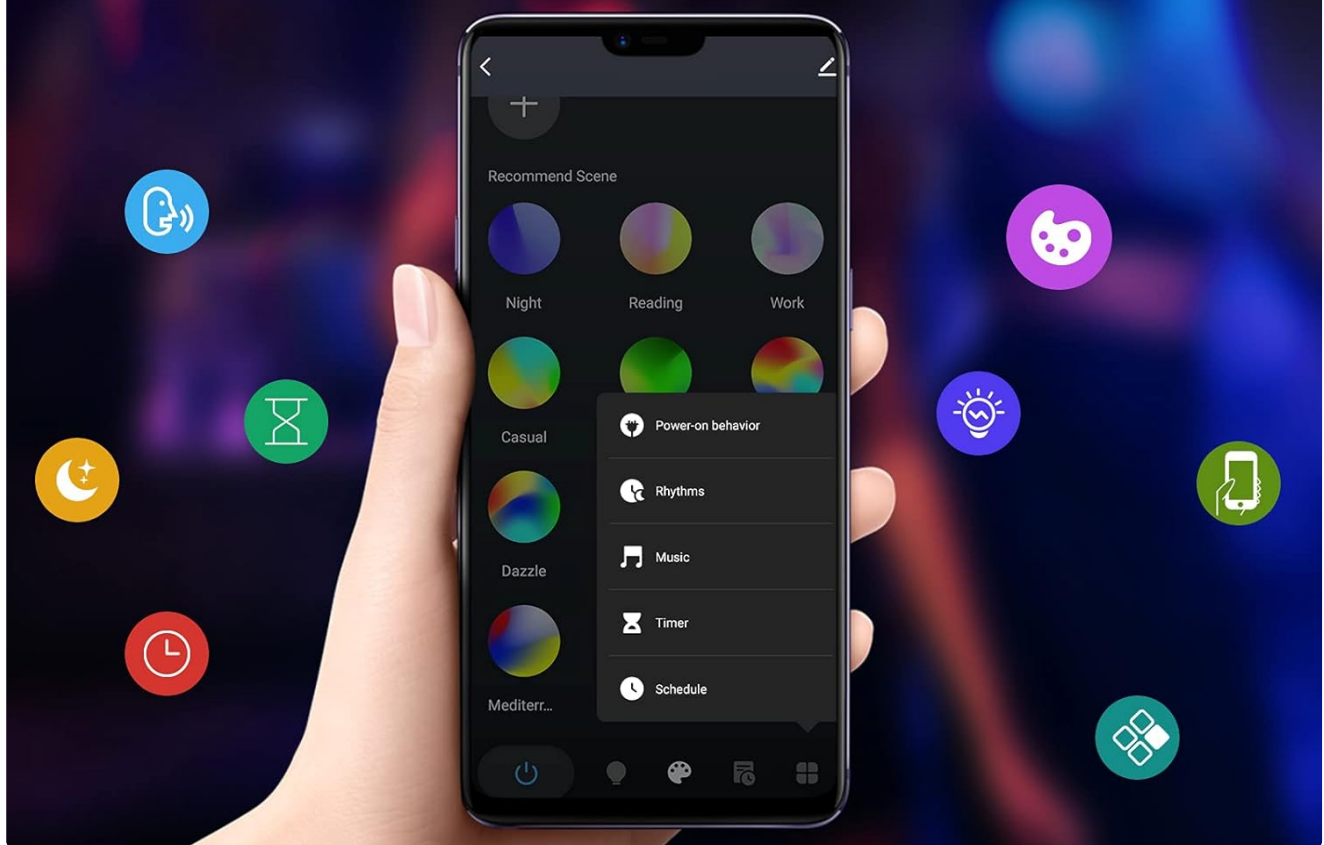
Image: The mobile app interface for controlling light settings, including color and brightness.

Group Control: you could control every room simultaneously