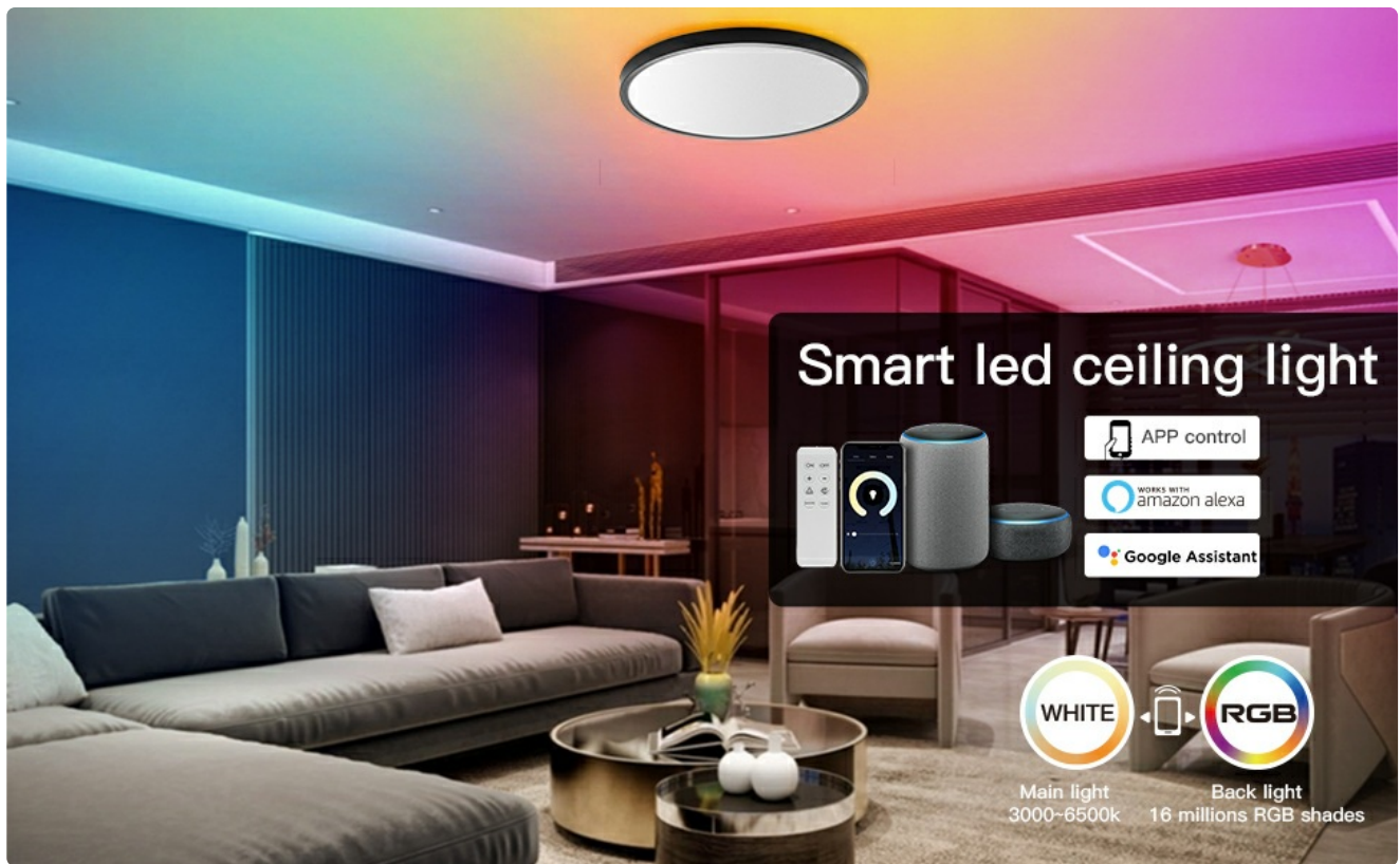
Image: Examples of 16 million RGB backlight colors and multiple scene options.