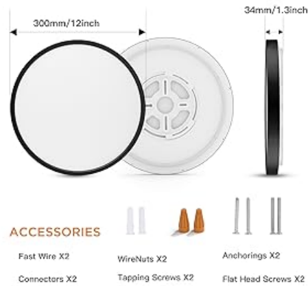
Image: All components included in the product packaging.