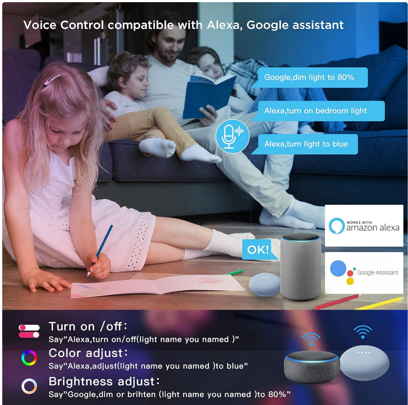
Image: Voice control compatibility with Amazon Alexa and Google Assistant.