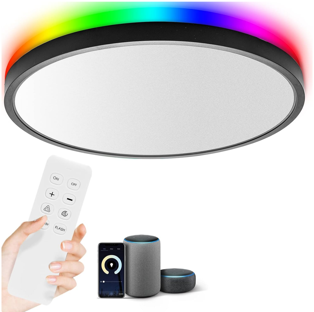
Image: The TALOYA Smart LED Ceiling Light, showcasing its main features including remote, app, and voice control compatibility.