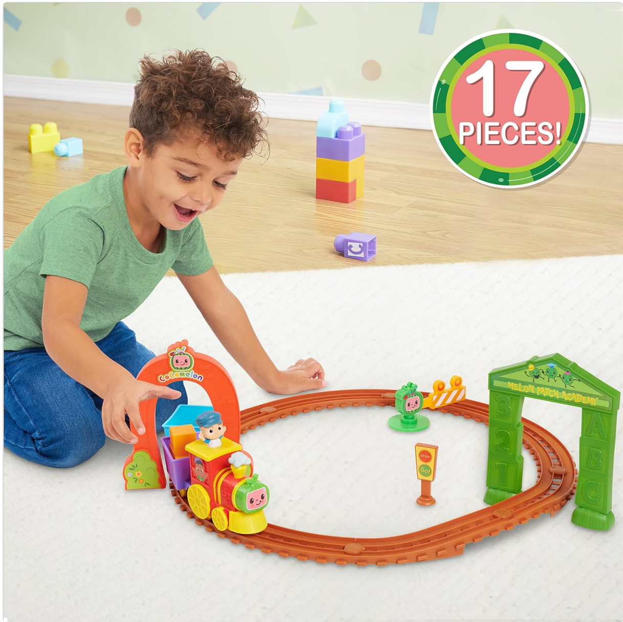
Image: A child happily playing with the fully assembled CoComelon All Aboard Music Train set, demonstrating the scale and interactive nature of the toy.