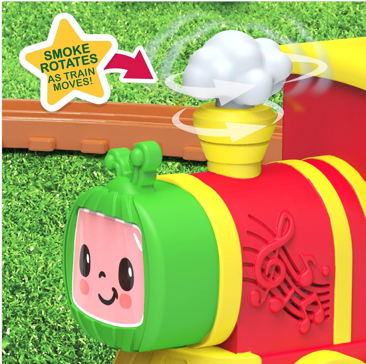
Image: A close-up view of the CoComelon train's steam stack, highlighting the spinning smoke feature as the train operates.