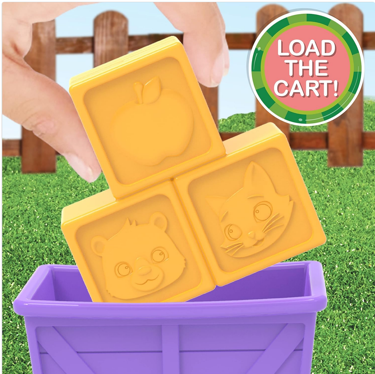
Image: A hand placing an ABC-themed block into one of the cargo cars of the CoComelon train, illustrating the cargo loading feature.