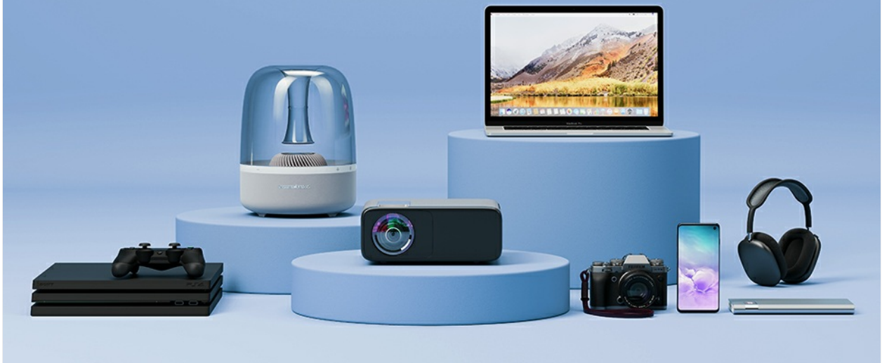
Image: Bluetooth audio connection for external speakers.