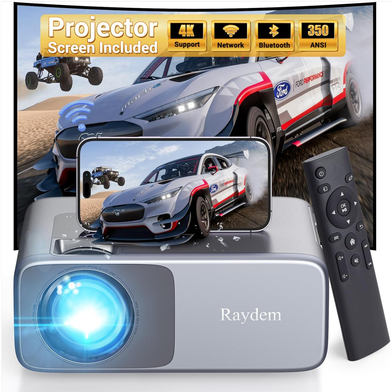
Image: The Raydem Video Projector RD-881.

Press the power button located on the projector or on the remote control to turn on the device. The indicator light will illuminate.