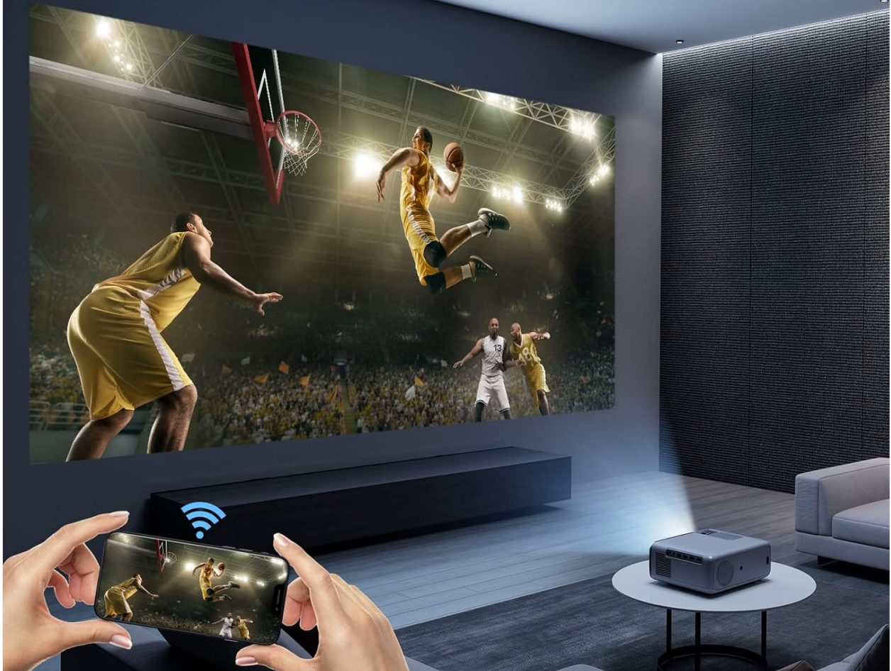
Image: Multiple device connectivity options for the projector.