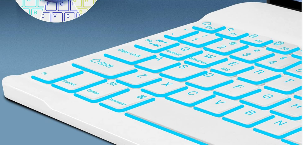
Image: Close-up of the keyboard demonstrating the backlit keys and color options.