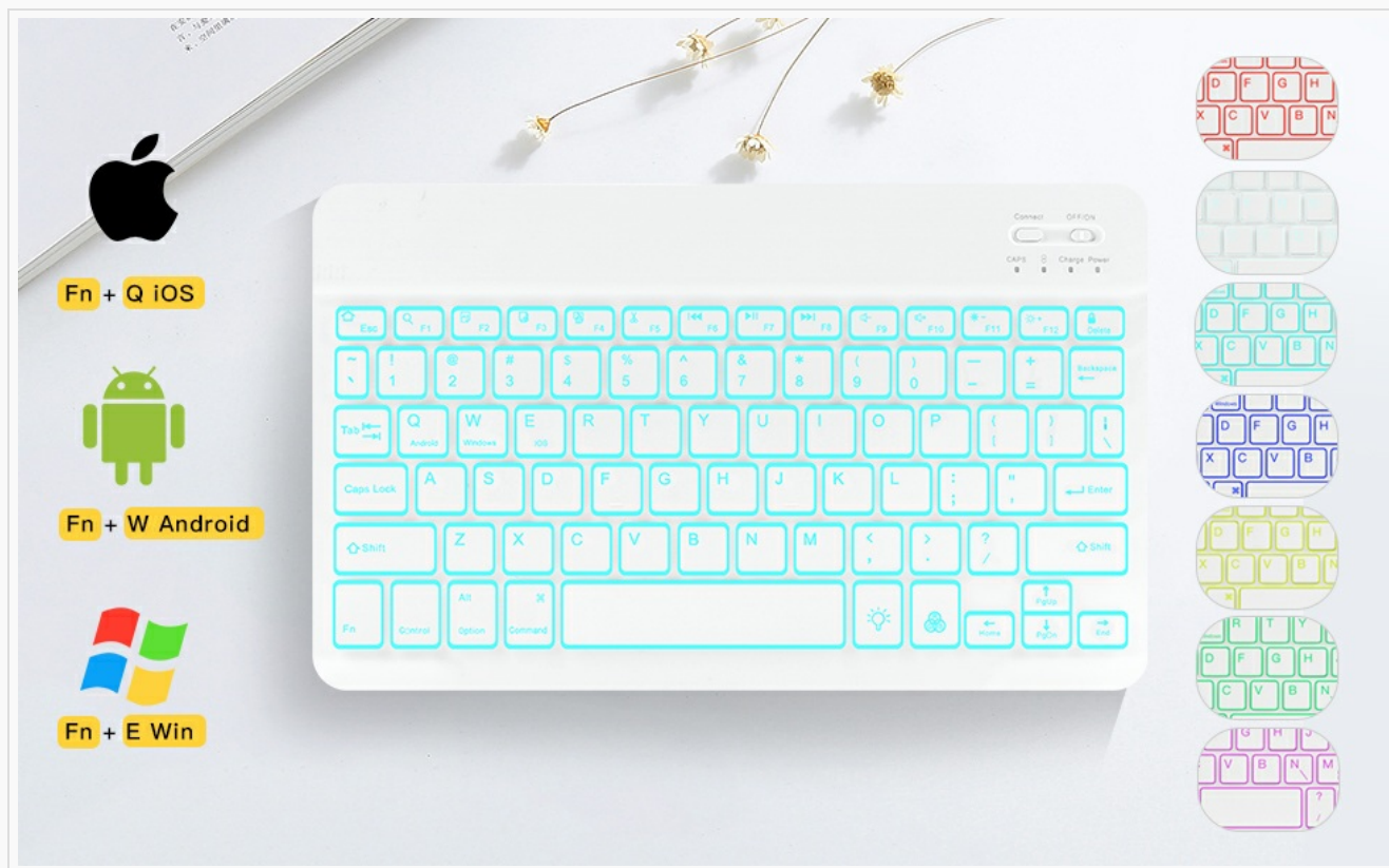
Image: Keyboard layout illustrating the function keys for switching between different operating systems.