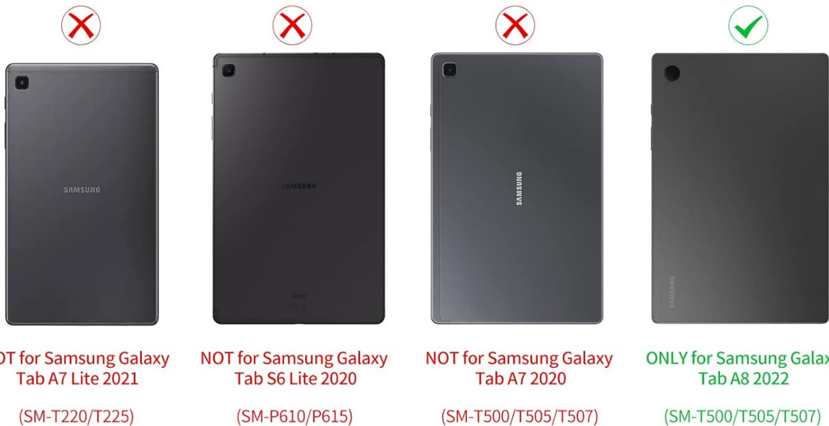
Image: Compatibility chart indicating supported Samsung Galaxy Tab A8 10.5 (2022) models and incompatible models.

Please confirm your tablet model number before purchasing Go to "Settings" on your tablet - About tablet - Model - "SM-X200" "SM-X205" or "SM-X207" (Right model number)