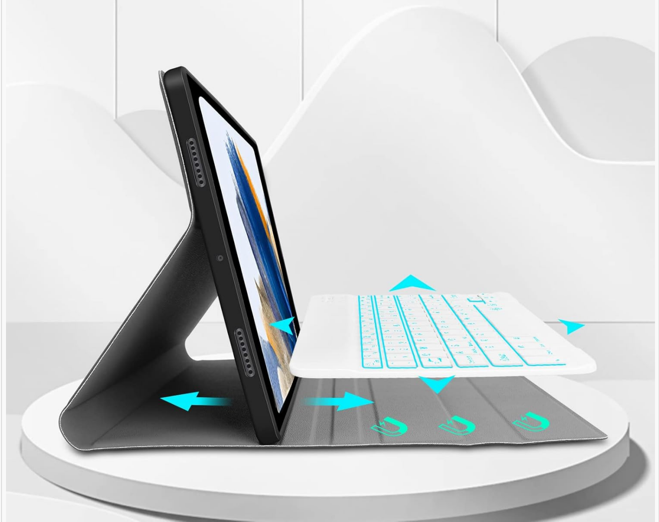
Image: The keyboard case configured to hold the tablet at an optimal viewing angle, simulating a laptop setup.

Perfect for watching movies, playing games or working