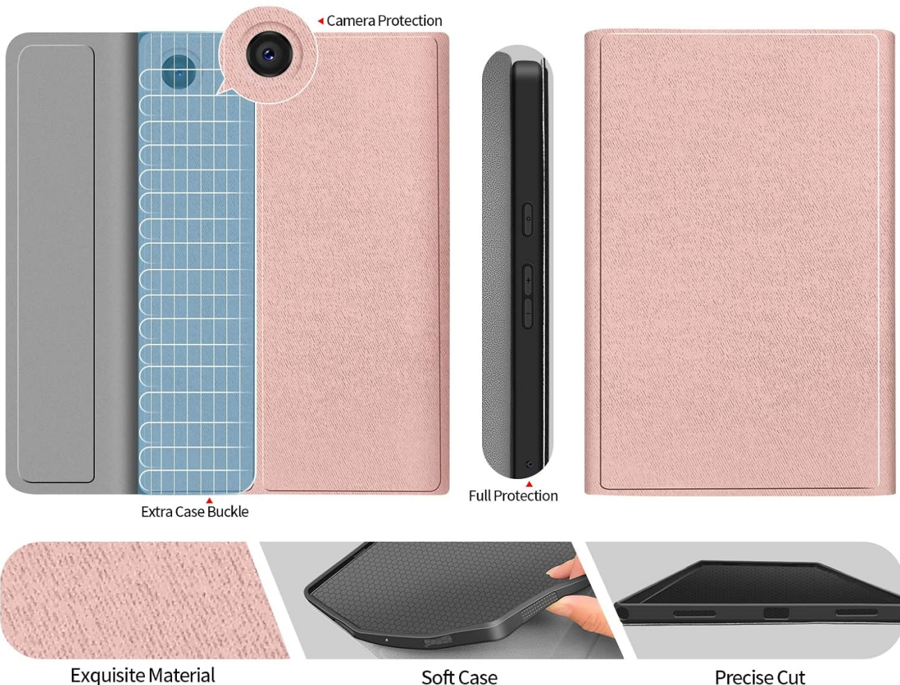
Image: Visual representation of the case's protective features and material quality.