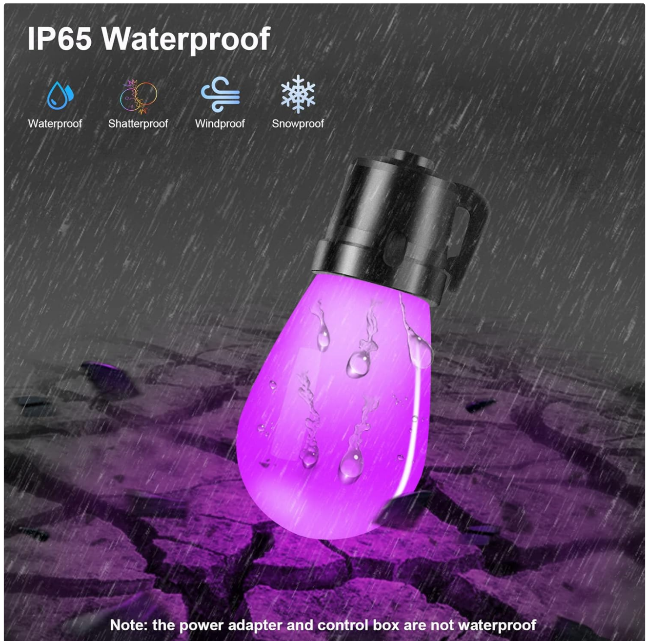
Figure 6.1: IP65 Waterproof and Shatterproof design. The image shows a bulb with water droplets, emphasizing its resistance to outdoor elements like rain, wind, and snow.