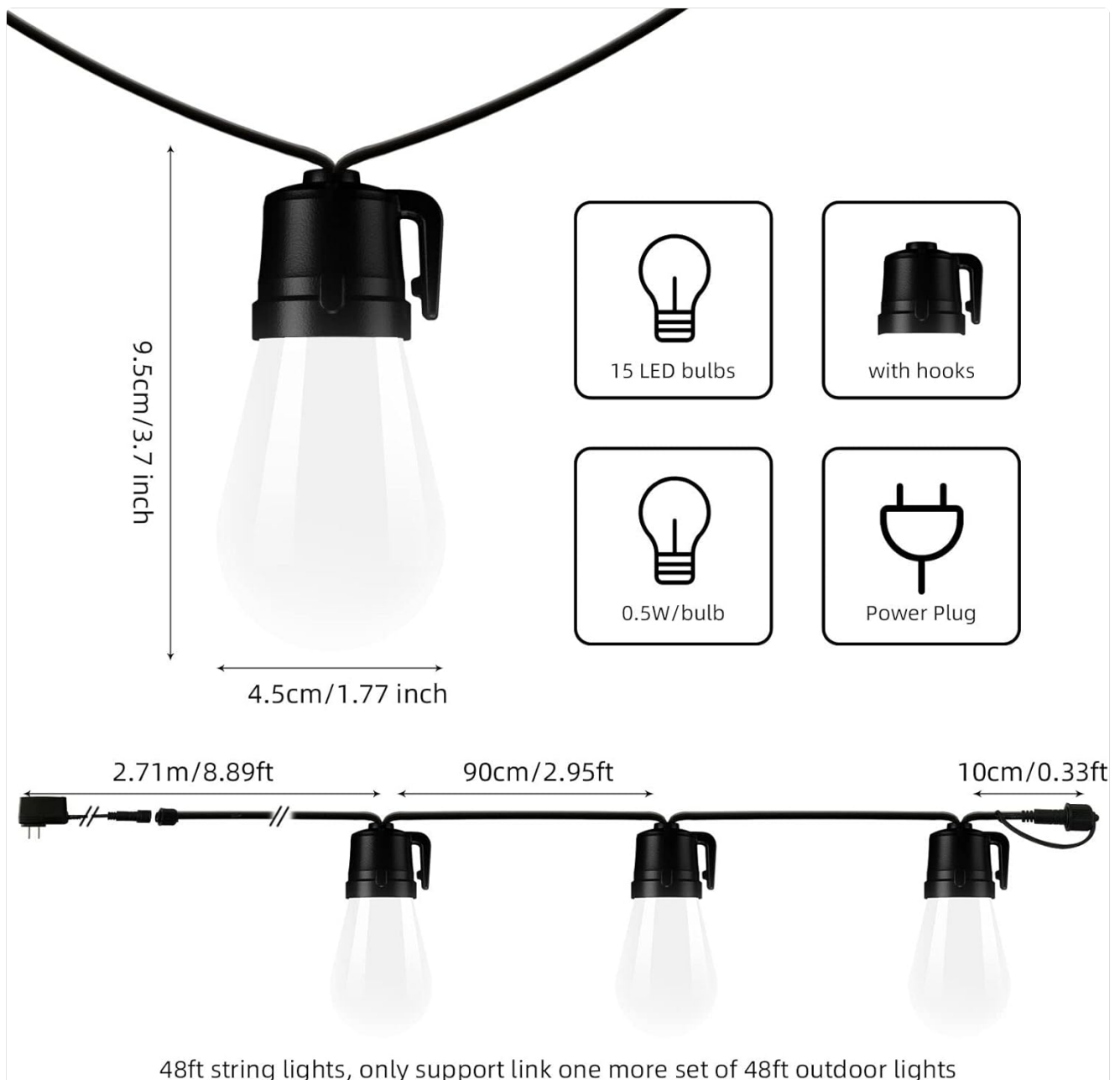
Figure 3.1: Package contents and bulb dimensions. Each bulb is 3.7 inches long and 1.77 inches in diameter. The string includes 15 LED bulbs, hooks for hanging, and a power plug. Each bulb consumes 0.5W.