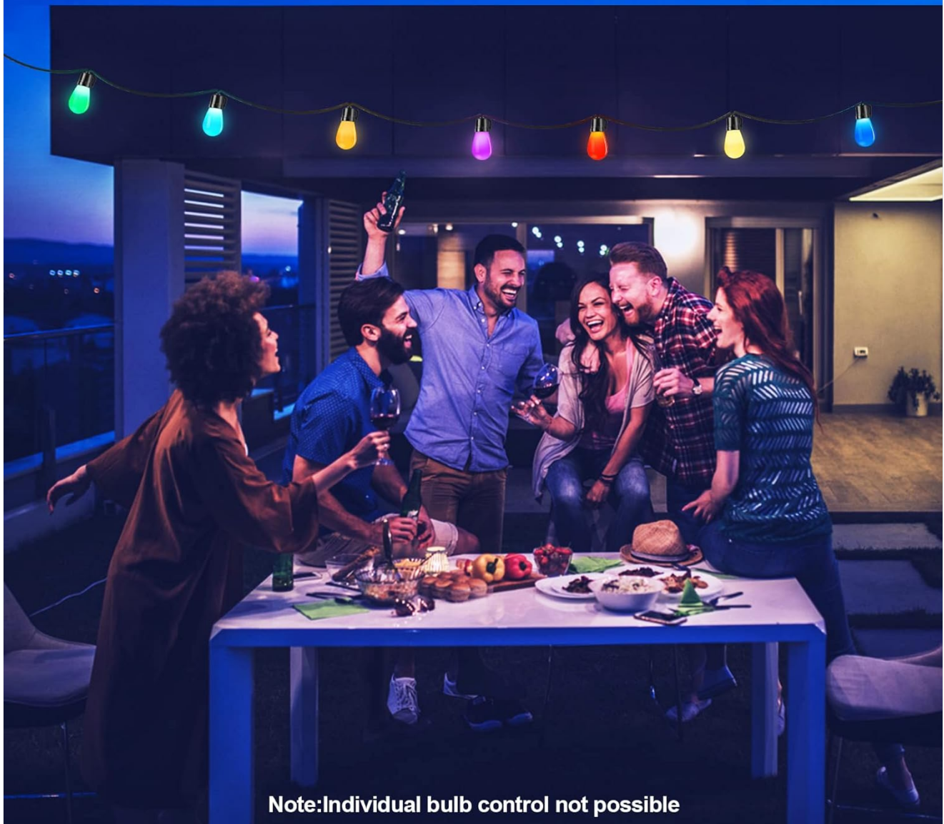
Figure 5.2: 8 Scene Modes. The app interface shows various scene options like 'Colorful' and 'Dazzling', enhancing the atmosphere of an outdoor party.

Play with the right colour for the occasion