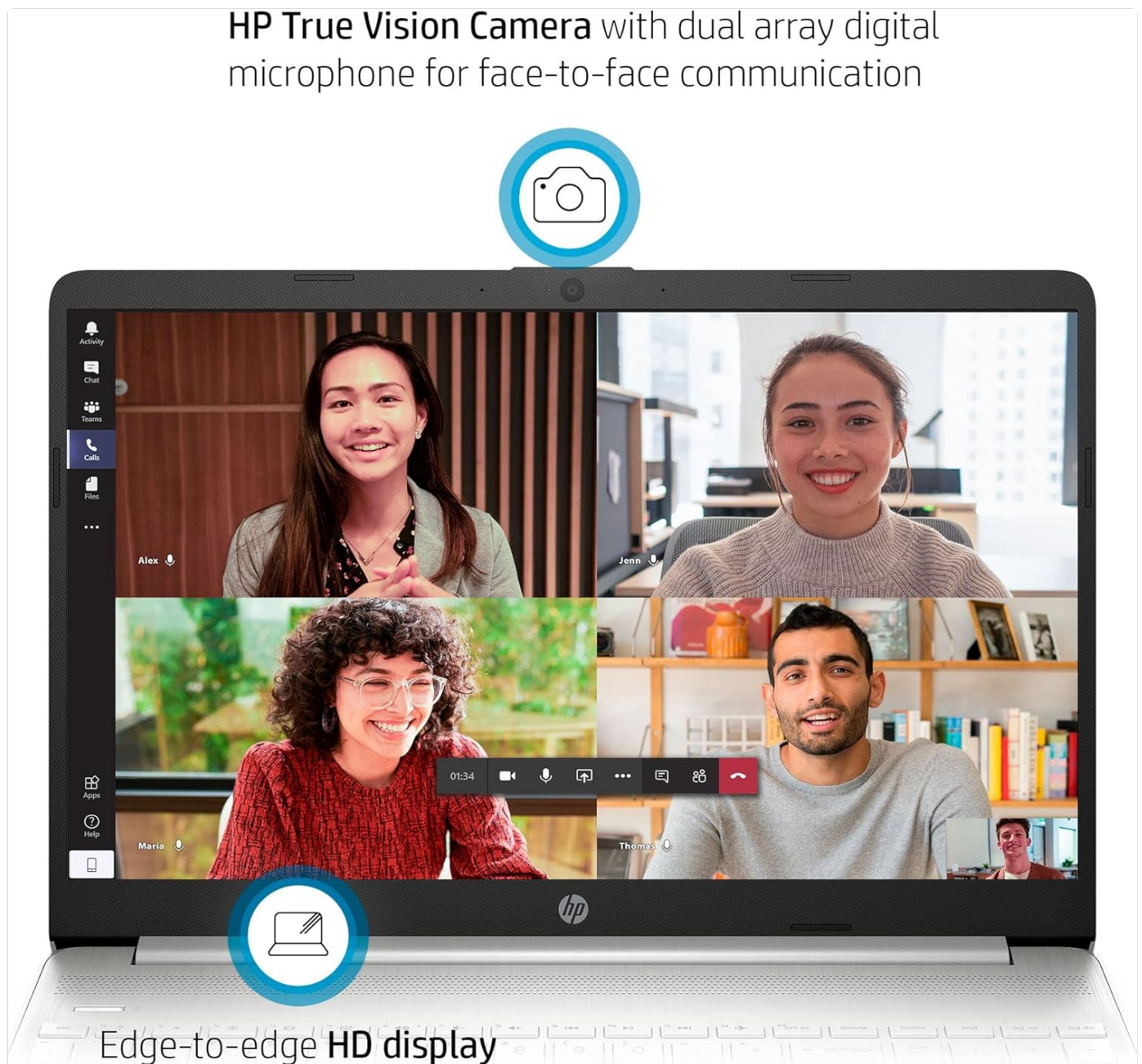
Image: The HP Pavilion 15 Laptop screen showing a video conference call, emphasizing the HP True Vision Camera with dual array digital microphone and the edge-to-edge HD display.

The laptop features High Definition Audio and tuned stereo speakers for clear sound. For video conferencing and communication, it includes a built-in HD webcam and dual array digital microphones.