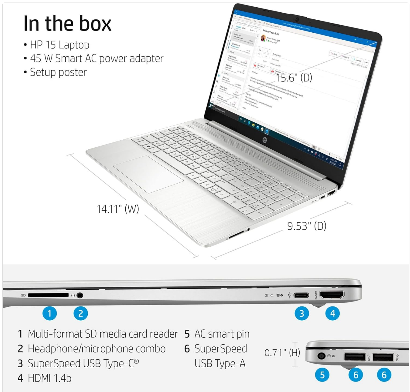
Image: An illustration of the HP Pavilion 15 Laptop, highlighting its physical dimensions (14.11" W x 9.53" D x 0.71" H) and labeling its various ports: Multi-format SD media card reader, Headphone/microphone combo, SuperSpeed USB Type-C, HDMI 1.4b, AC smart pin, and SuperSpeed USB Type-A.

Inspect the laptop and accessories for any signs of damage. If any items are missing or damaged, contact HP support.