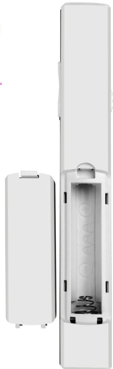
Image: The remote with its battery compartment open, illustrating the correct placement for the AAA battery.