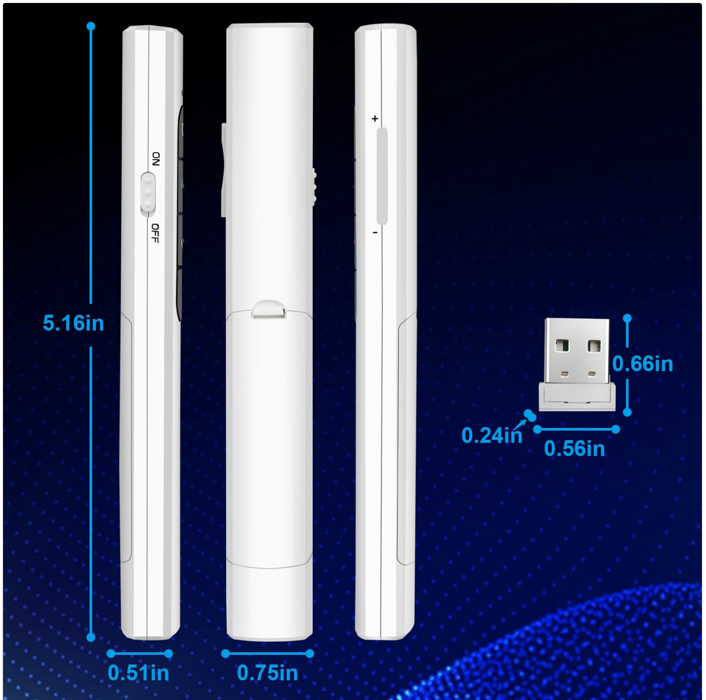
Image: Detailed dimensions of the presenter remote and its USB receiver.