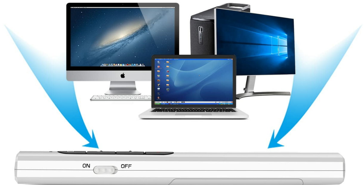
Image: The remote in use, highlighting its long control range of up to 100 feet for wireless functions and 328 feet for the laser pointer.