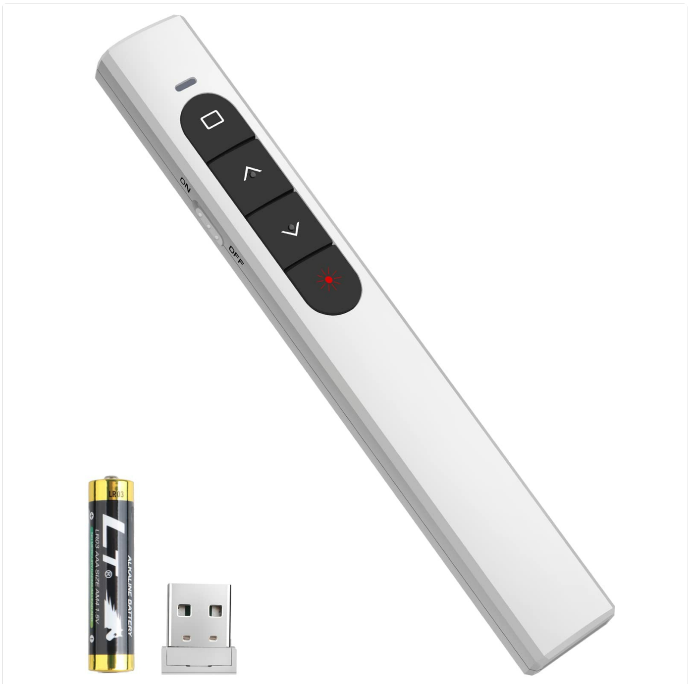
Image: The UBUYONE Wireless Presenter Remote GX15, shown with its USB receiver and an AAA battery.