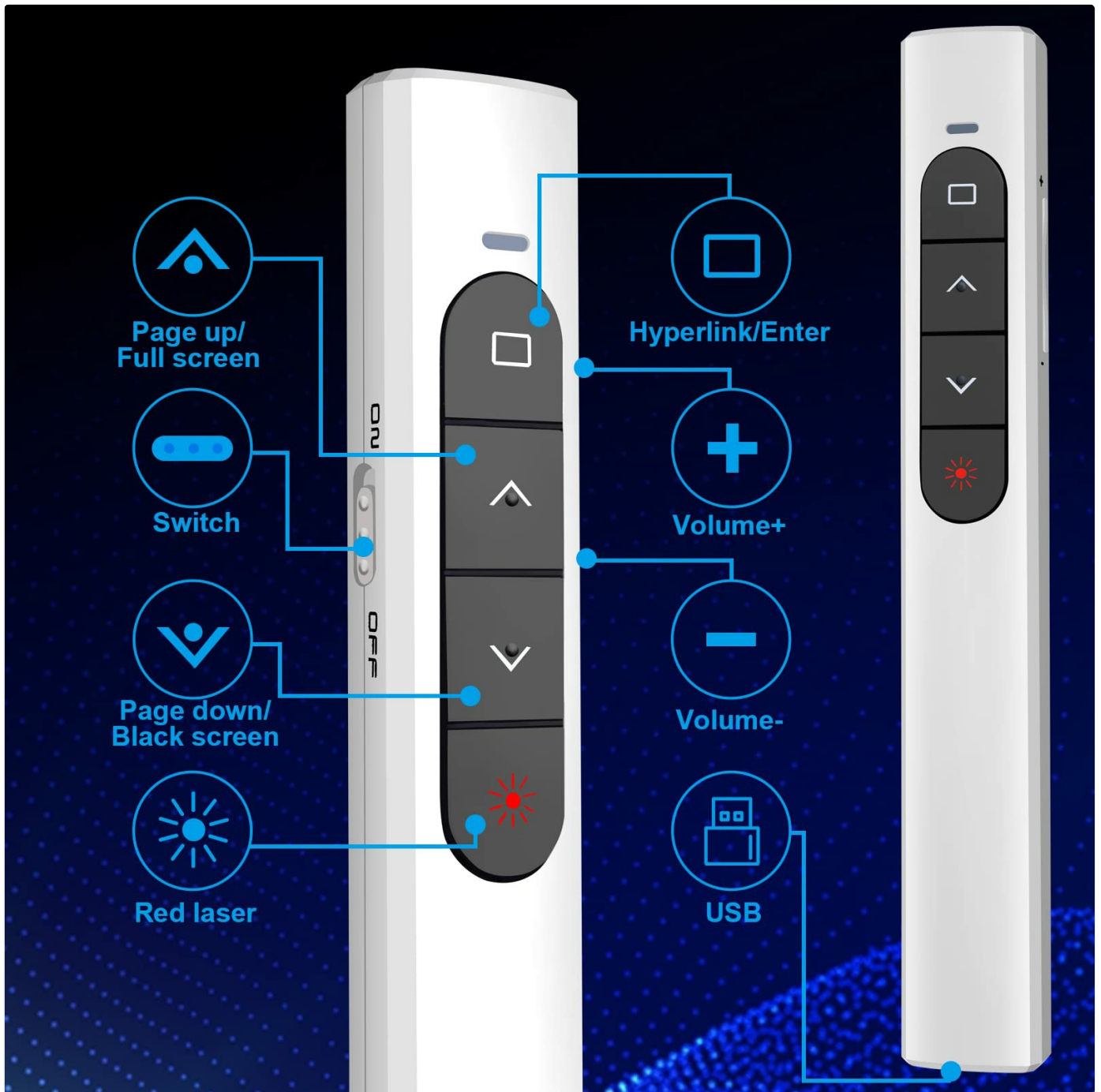
Image: A detailed diagram showing the function of each button on the presenter remote, including page up/full screen, switch windows, page down/black screen, red laser, hyperlink/enter, volume up, volume down, and USB receiver.