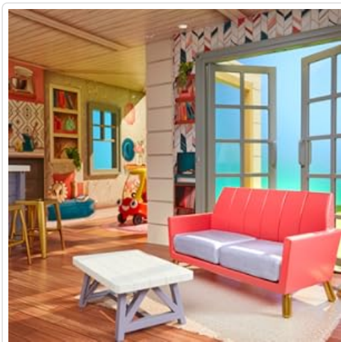
Image: Close-up of the living room area with furniture.