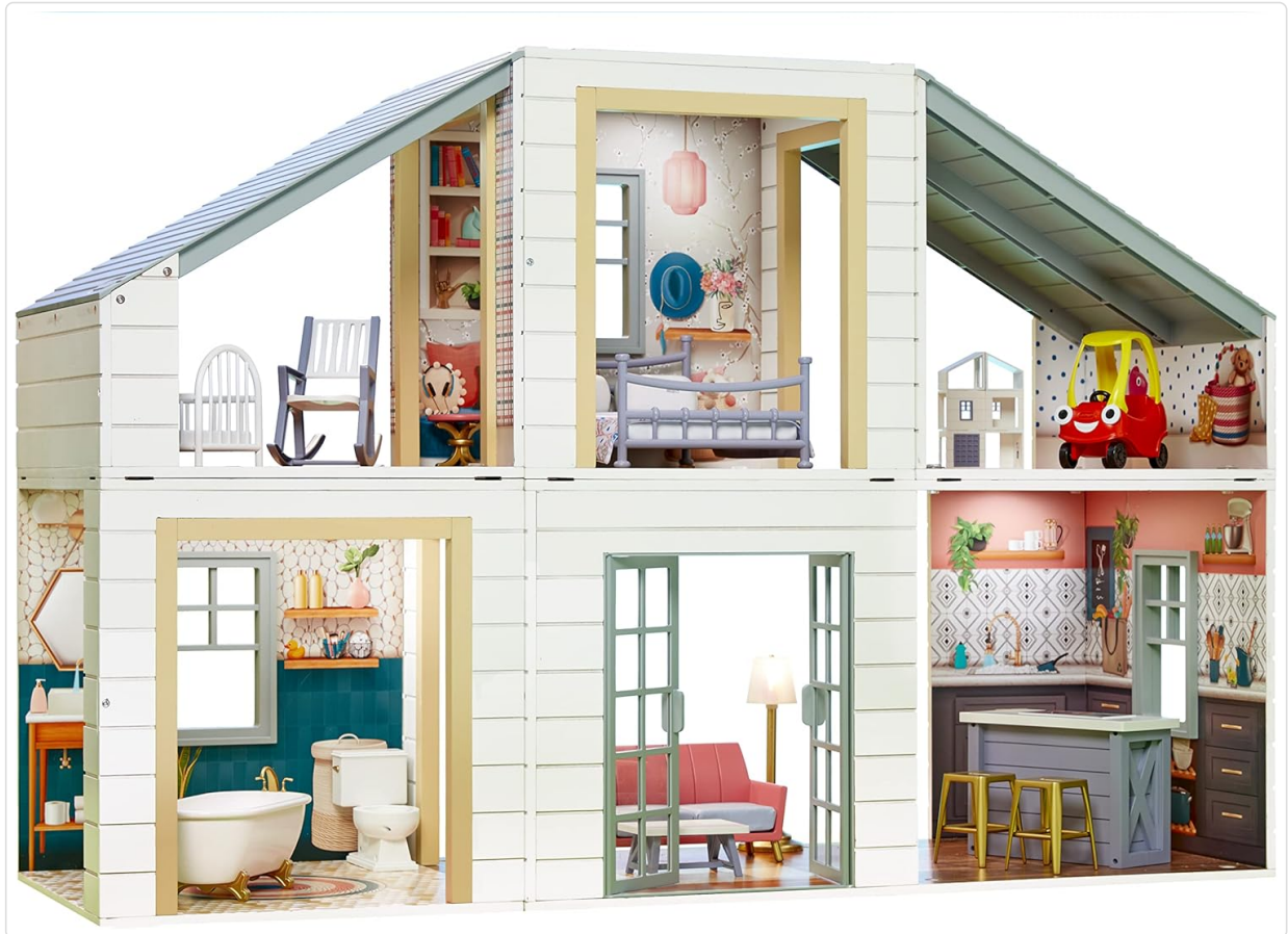
Image: A wide view of the dollhouse showcasing its modular design and multiple rooms.