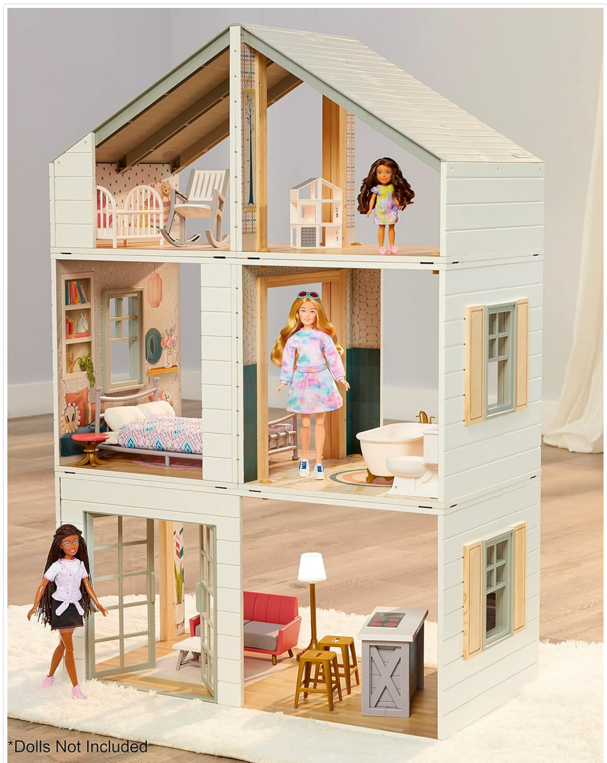
Image: The Little Tikes Real Wood Stack 'n Style Dollhouse, fully assembled with dolls and furniture in various rooms.