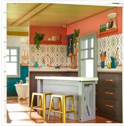
Image: Close-up of the kitchen area with an island and stools.

Your browser does not support the video tag.