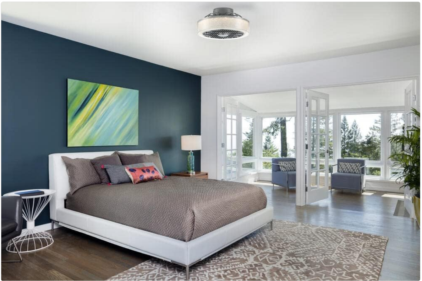
Image: The fandelier installed in a bedroom, demonstrating its flush-mount design and how it integrates into a living space.