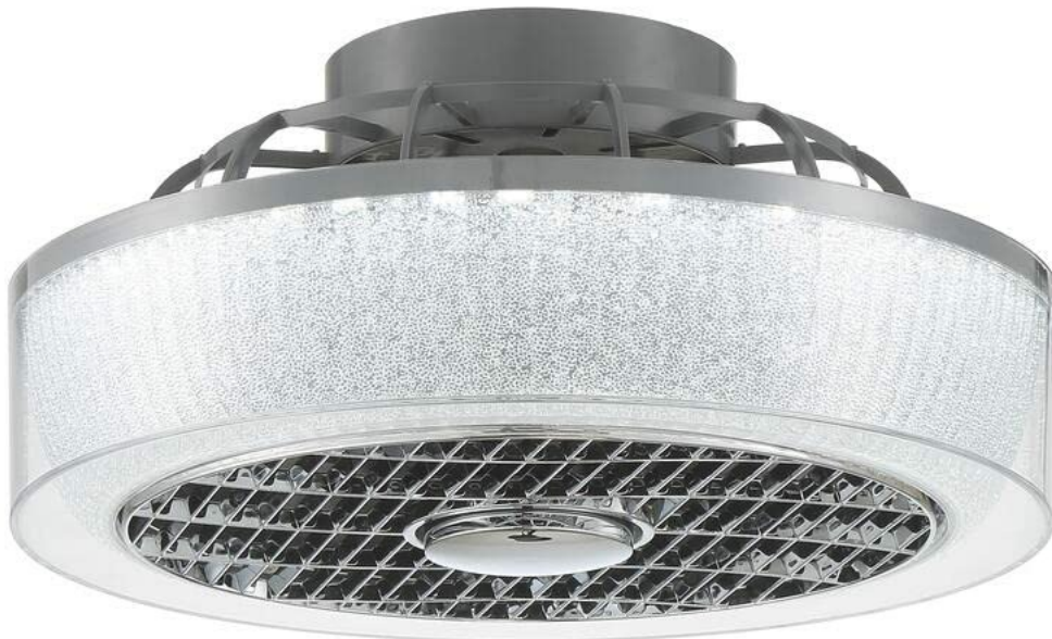
Image: The Patriot Lighting Swank 16" Gray Indoor Integrated LED Fandelier, showcasing its compact design and modern aesthetic.

Thank you for choosing the Patriot Lighting Swank 16" Gray Indoor Integrated LED Fandelier. This product combines the functionality of a ceiling fan with the illumination of an integrated LED light, designed for indoor use. It features a sleek gray finish, a clear acrylic shade, and offers color-changing and dimmable LED lighting, all controllable via a handheld remote.