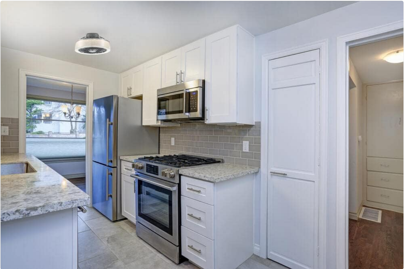
Image: The fandelier installed in a kitchen, demonstrating its versatility in various indoor environments.

(upward airflow). Refer to your remote for this feature.