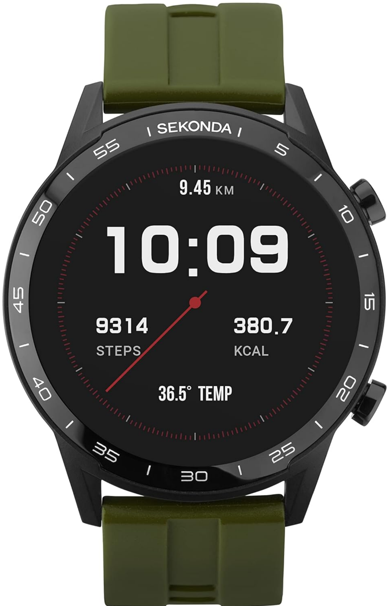
Figure 1.1: Sekonda Smartwatch main display, showing current time, steps taken, calories burned, and body temperature.