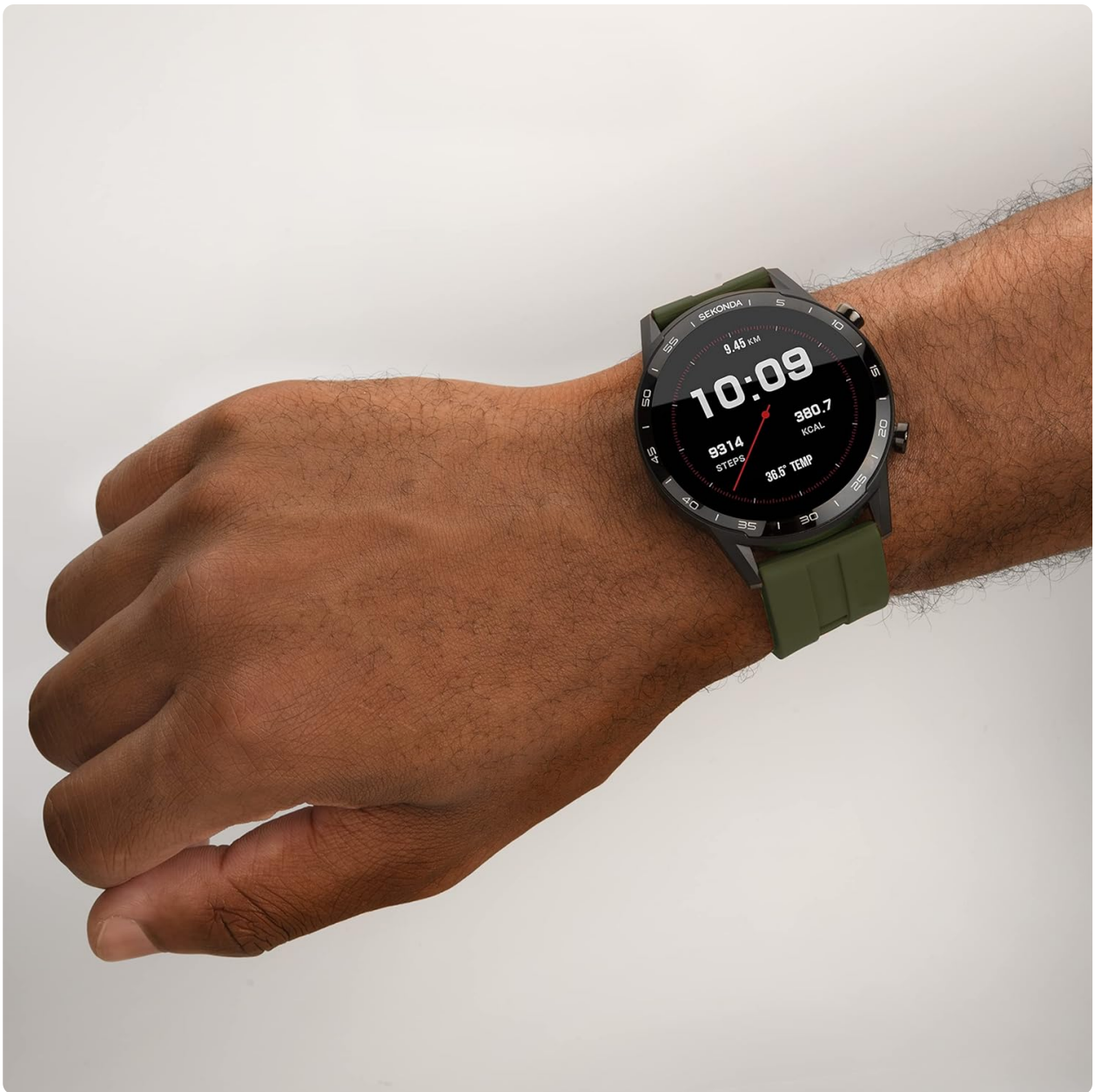
Figure 4.1: The back of the smartwatch with charging contacts and sensors, and the watch worn on a wrist.