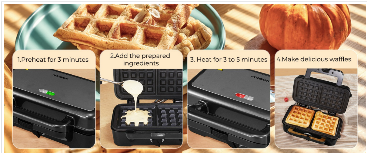
Figure 4: The 1200W powerful heating element ensures fast cooking with double-sided heating and overheat protection.