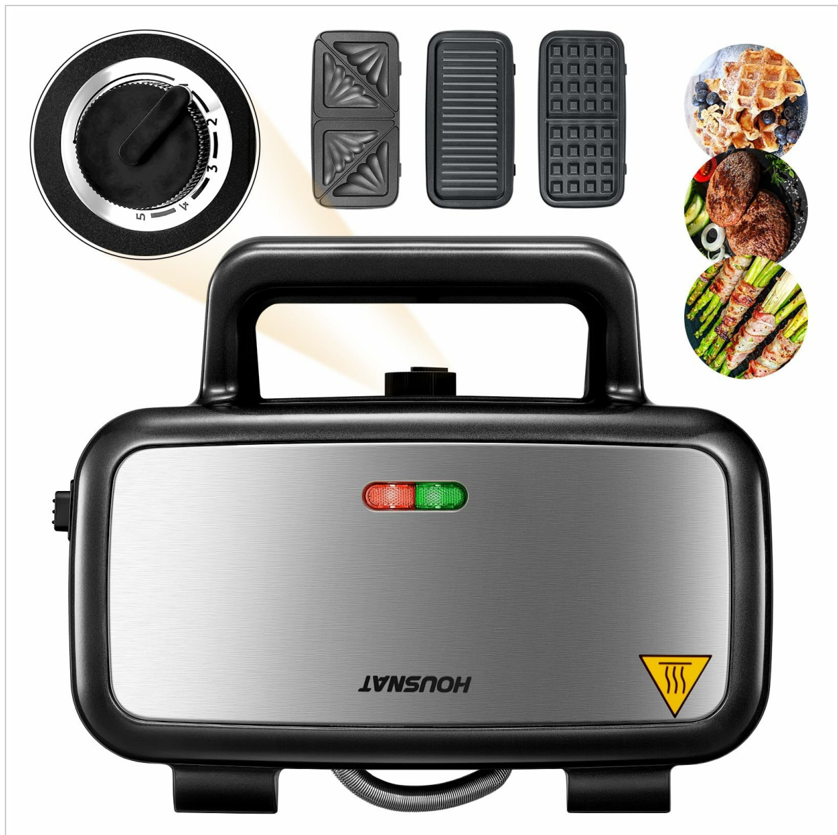
Figure 1: HOUSNAT 3-in-1 Sandwich Maker.