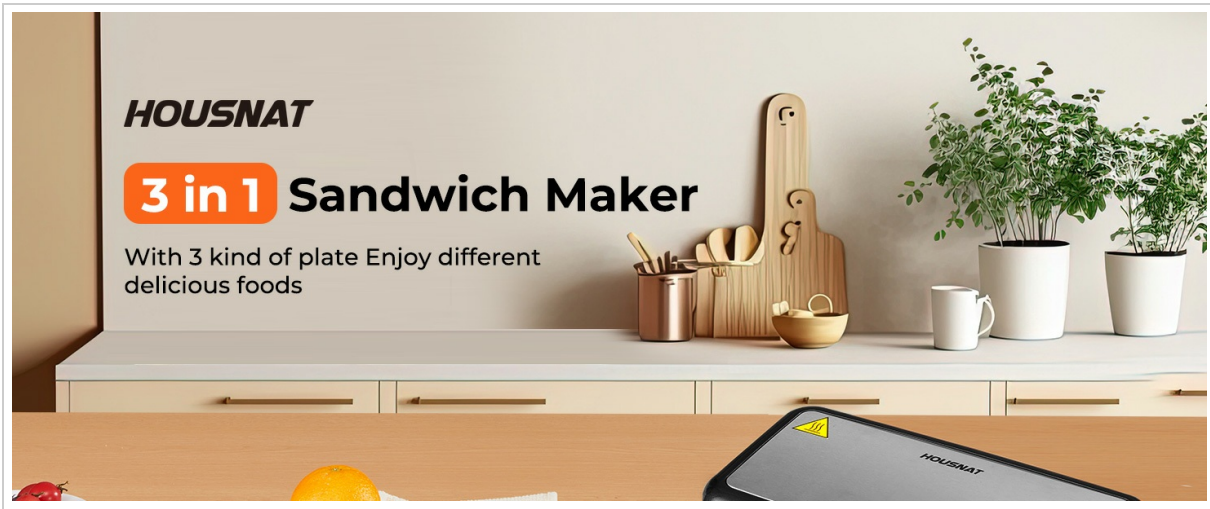
Figure 2: The HOUSNAT 3-in-1 Sandwich Maker showing the three interchangeable plate types: grilled, waffle, and sandwich.