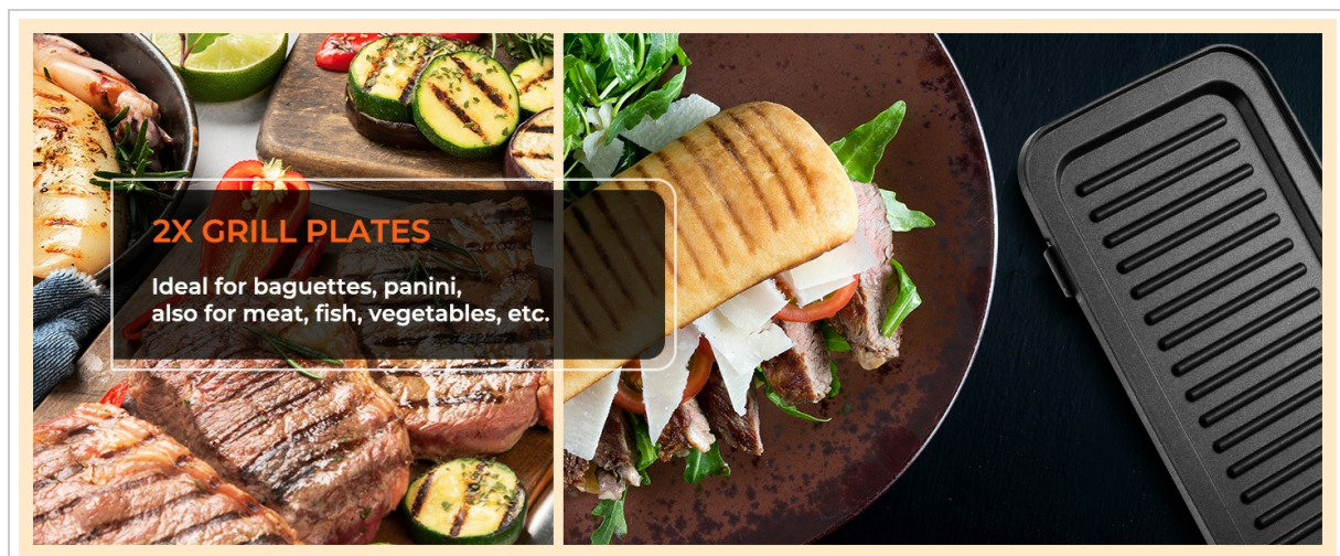
Figure 6: The HOUSNAT Sandwich Maker with grill plates, showcasing various grilled foods like sausage, fillet steak, fried egg, and roasted vegetables.

Your browser does not support the video tag.