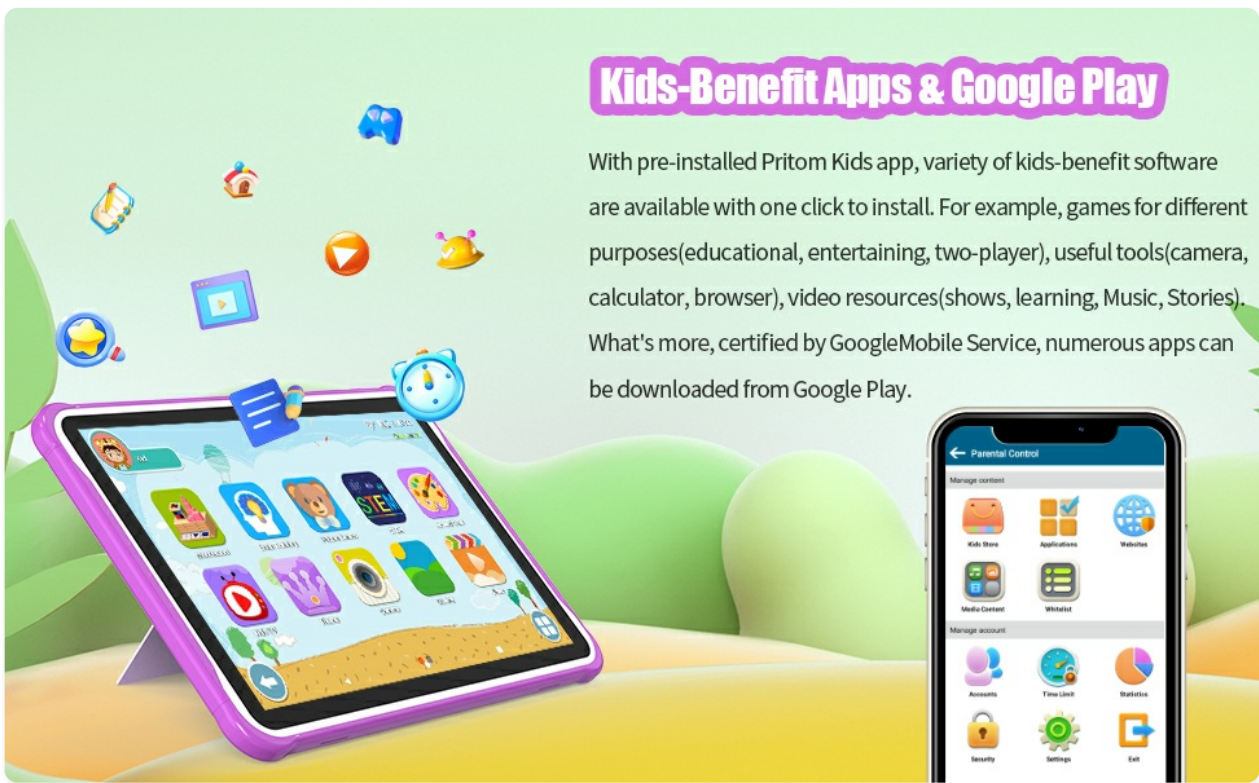
Image: The PRITOM K10 tablet showcasing a variety of educational and entertaining apps, alongside a smartphone interface demonstrating the parental control management options.

With pre-installed Pritom Kids app, variety of kids-benefit software are available with one click to install. For example, games for different purposes(educational, entertaining, two-player), useful tools(camera, calculator, browser), video resources(shows, learning, Music, Stories). What's more, certified by GoogleMobile Service, numerous apps can be downloaded from Google Play.