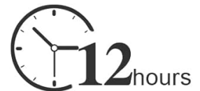
Image: Illustration of the tablet's 6000mAh battery capacity, indicating approximately 6 hours for video, 8 hours for daily use, and 12 hours for reading.