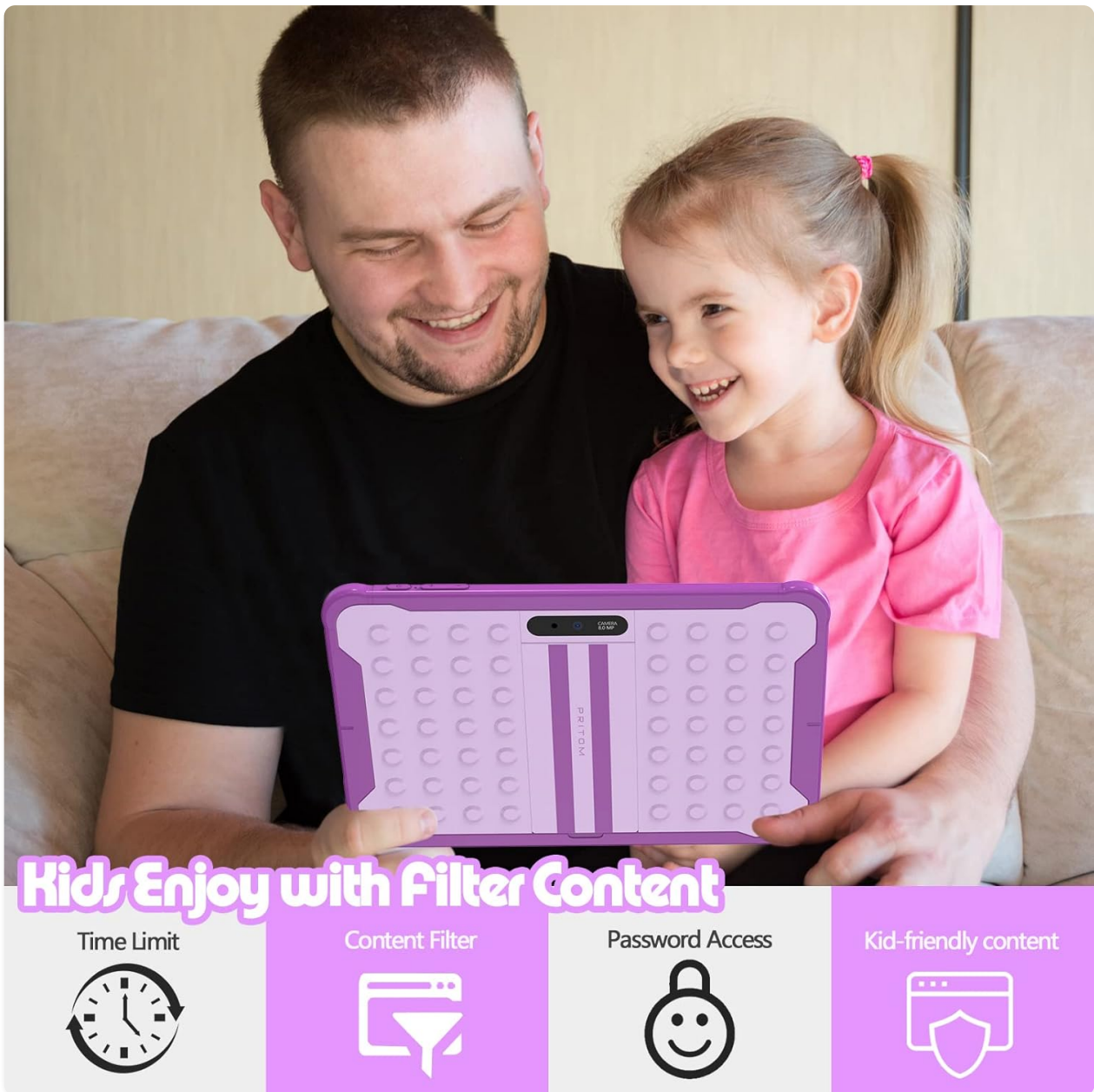
Image: A parent and child interacting with the PRITOM K10 tablet, highlighting the parental control features such as time limits, content filtering, password access, and kid-friendly content.