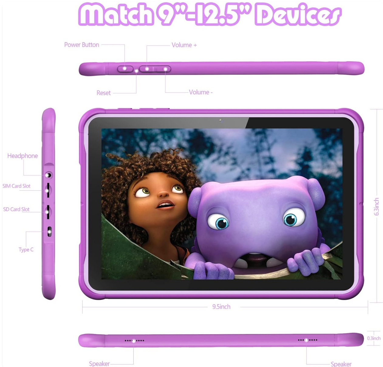
Image: A detailed diagram illustrating the location of the power button, volume controls, reset pinhole, headphone jack, SIM card slot, SD card slot, Type-C charging port, and speakers on the PRITOM K10 tablet.

The PRITOM K10 tablet features a durable design with a silicone case and an integrated stand for comfortable viewing. Familiarize yourself with the device's physical components.