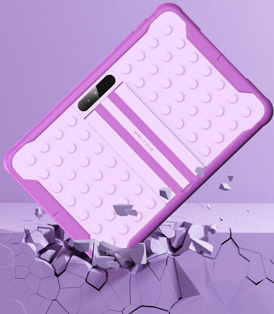
Image: The PRITOM K10 tablet's durable silicone case and integrated stand, designed to protect the device and provide hands-free viewing.