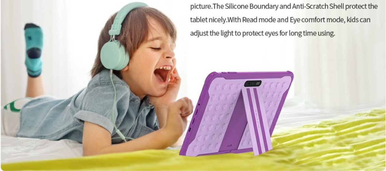
Image: A child using the PRITOM K10 tablet, illustrating the comfortable viewing experience provided by the 10-inch HD IPS display and eye comfort features.

Featured with 10 inch HD IPS display touchscreen, providing wonderful viewing experience for kids with large screen and clear picture. The Silicone Boundary and Anti-Scratch Shell protect the tablet nicely. With Read mode and Eye comfort mode, kids can adjust the light to protect eyes for long time using.