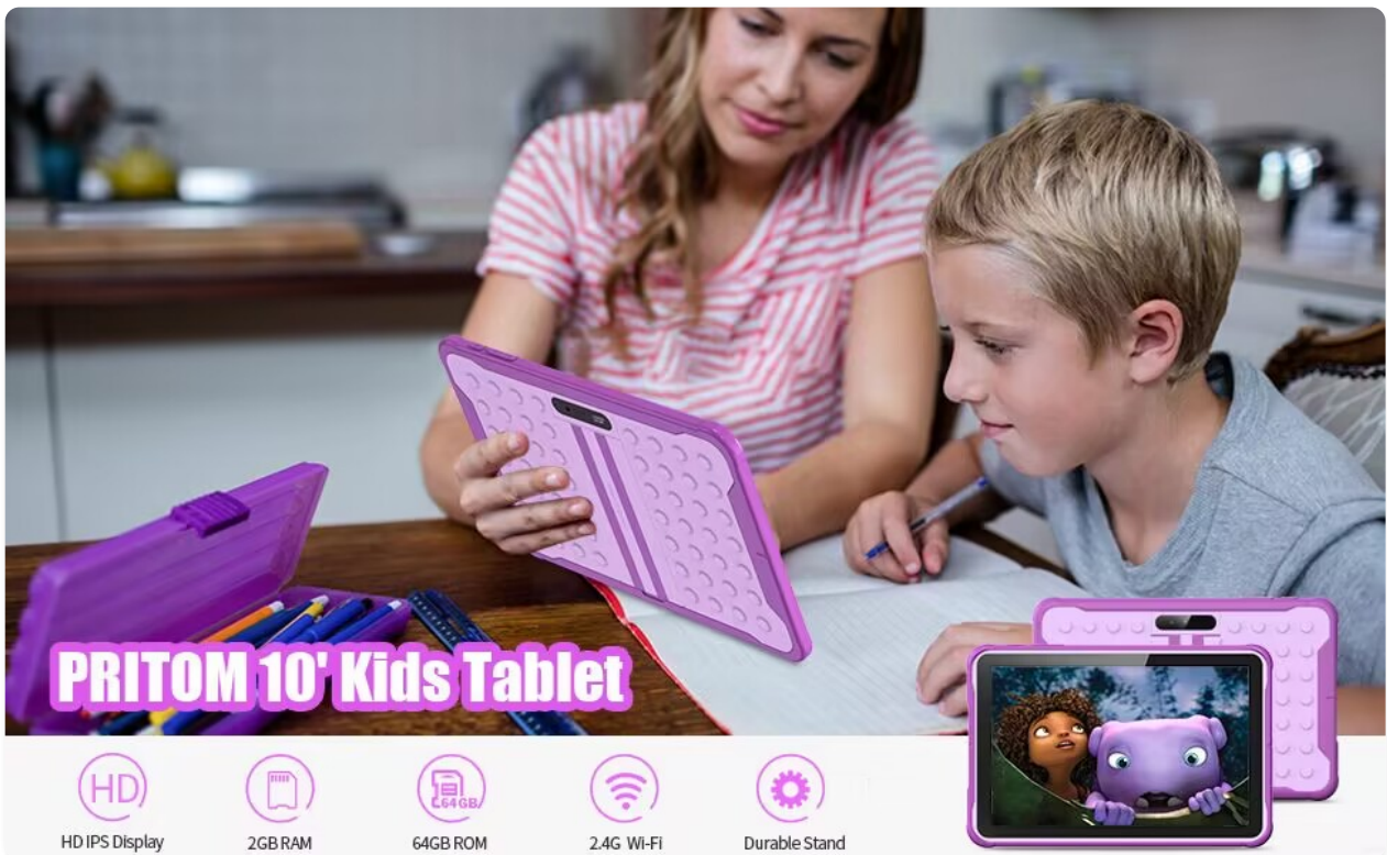
Image: The PRITOM K10 tablet displaying its key features including 2.4G WiFi, Kids Mode, Camera, Eye Comfort, Google Play, and SIM Card support.

Thank you for choosing the PRITOM K10 Android Tablet. This manual provides essential information for the safe and efficient use of your device. Please read it carefully before operating the tablet and retain it for future reference.