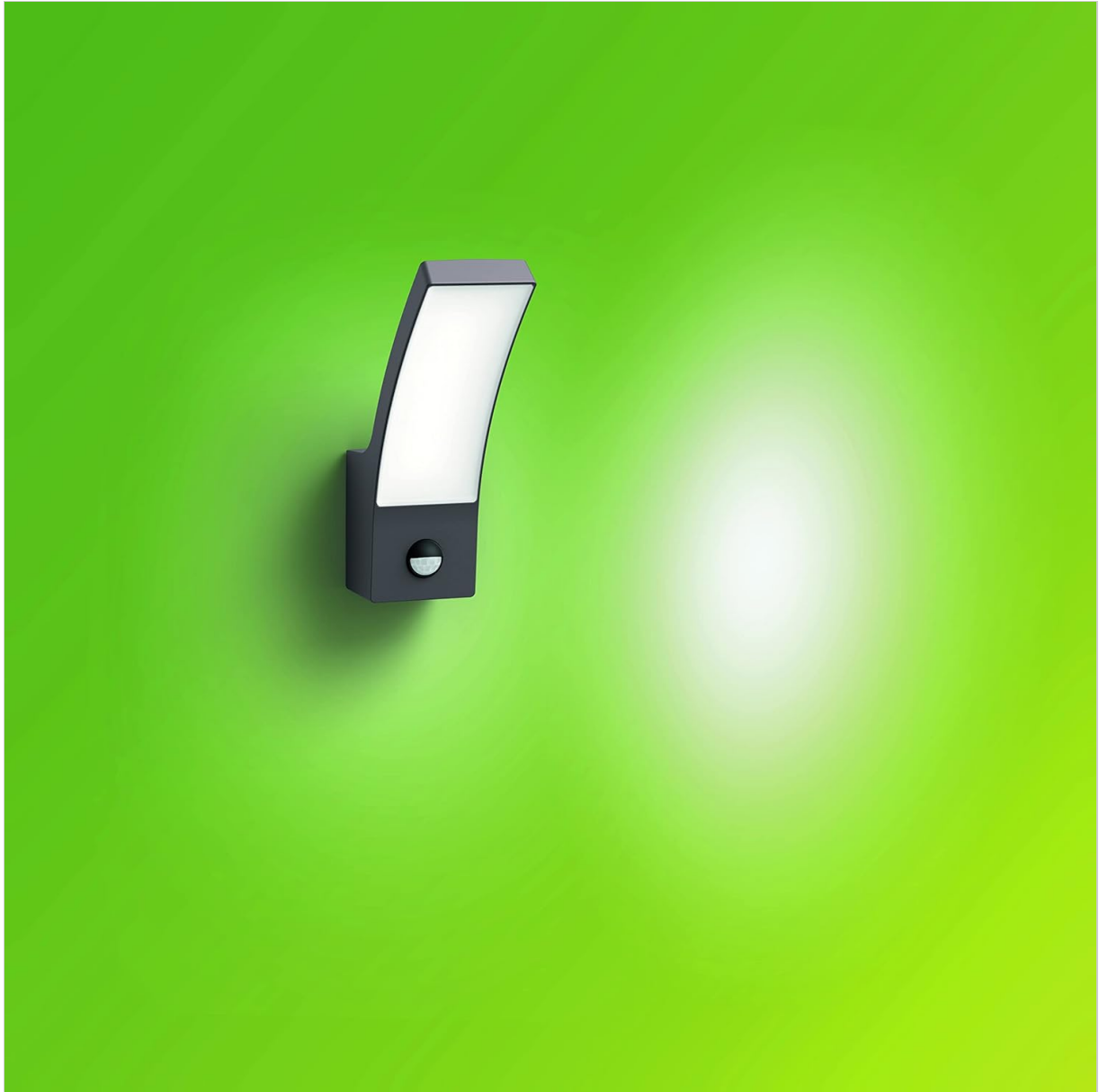
Image Description: The Philips Splay LED Outdoor Wall Lamp is shown mounted on a vibrant green background, with a bright cool white light emanating from its LED panel, illustrating its illumination capability.