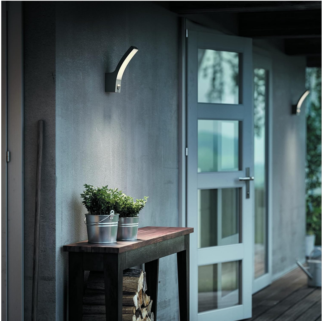
Image Description: The Philips Splay LED Outdoor Wall Lamp is shown mounted on a grey exterior wall, providing downward illumination. The lamp is positioned to the left of a white patio door, with two potted plants on a small wooden table beneath it.