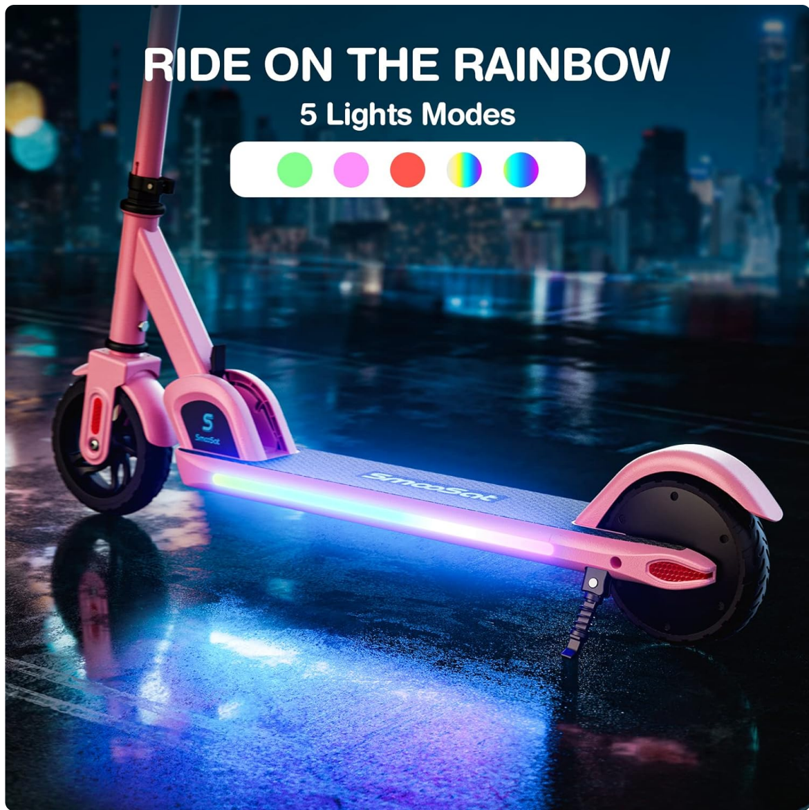
Figure 4: Scooter with illuminated rainbow LED lights.