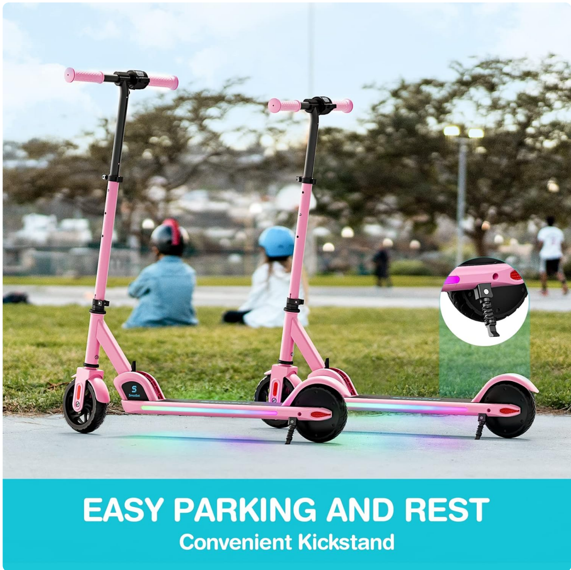
Figure 7: Convenient kickstand for easy parking.

See the scooter in action, demonstrating its features and usage: