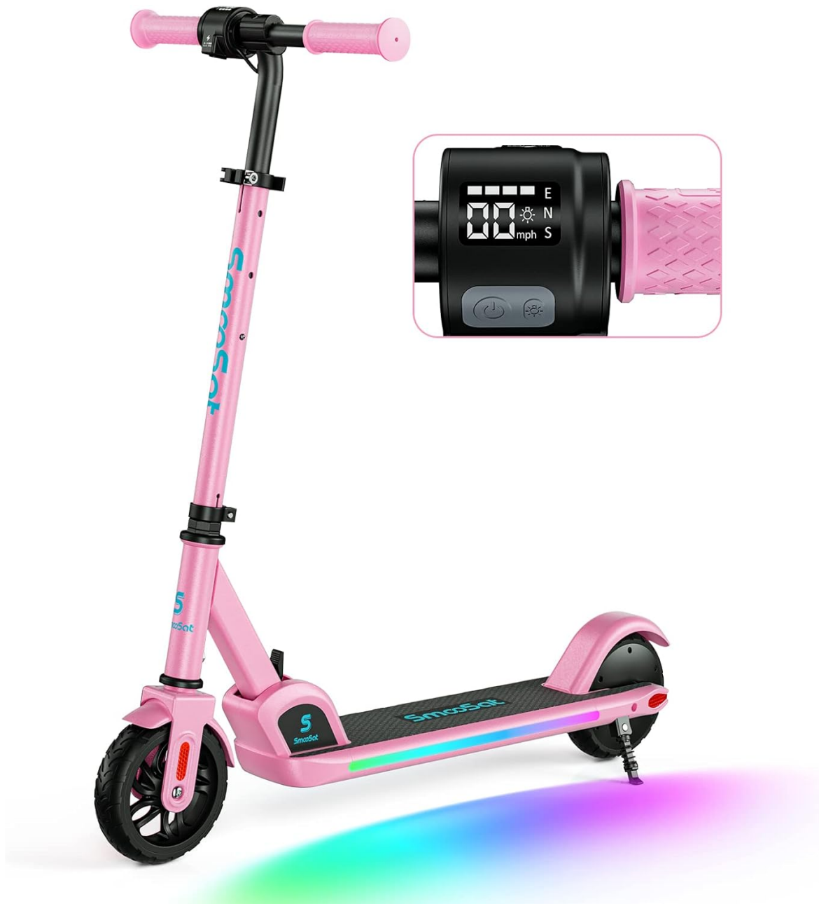
Figure 1: SmooSat E9 PRO Electric Scooter (Pink model shown)