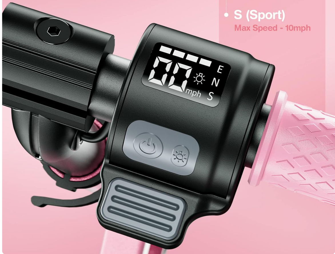
Figure 3: Handlebar LED display showing speed modes and battery level.