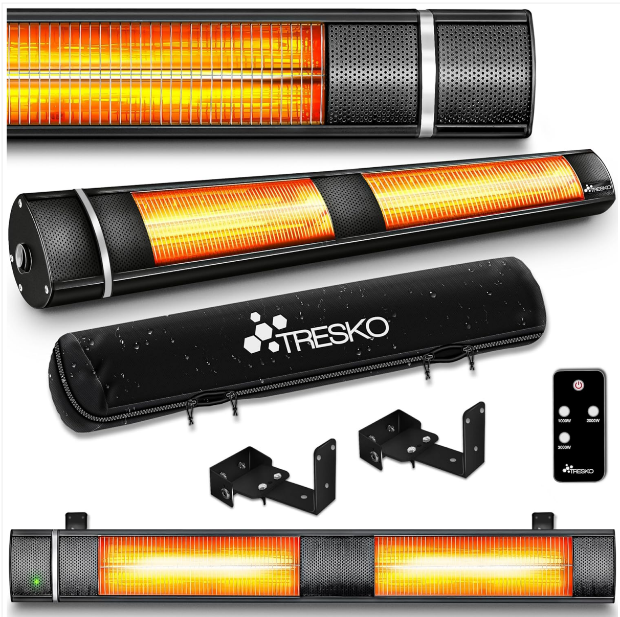
Image 3.1: Contents of the TRESKO Infrared Heater package, including the heater unit, remote control, and mounting brackets.