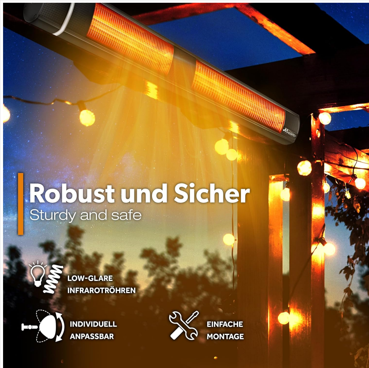
Image 4.2: The heater's robust and safe construction, featuring low-glare infrared tubes, individual adjustability, and ease of installation.