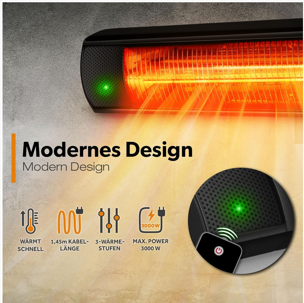
Image 4.1: Overview of the heater's modern design and key features, including quick heating, 1.45m cable length, three heat settings, and a maximum power of 3000W.