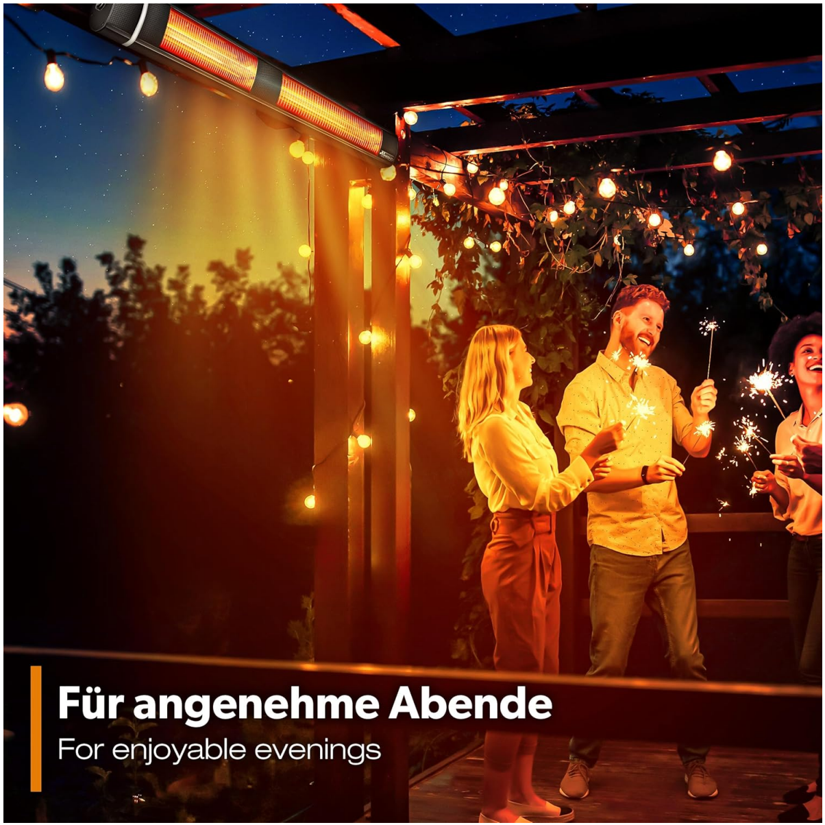
Image 6.1: The heater provides comfortable warmth for enjoyable evenings outdoors.