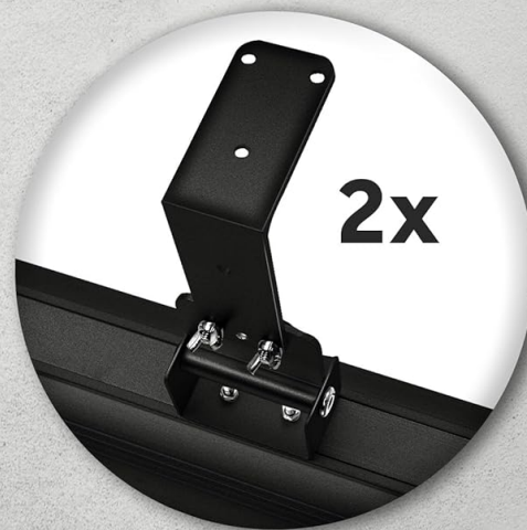
Image 5.1: Illustration of the easy wall mounting process and the heater's durable construction materials.