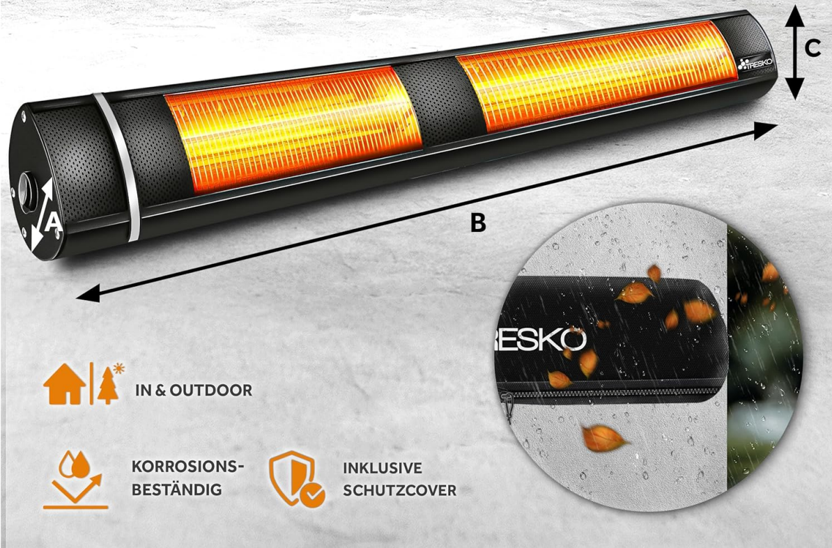
Image 9.1: Detailed measurements and key features of the TRESKO Infrared Heater.