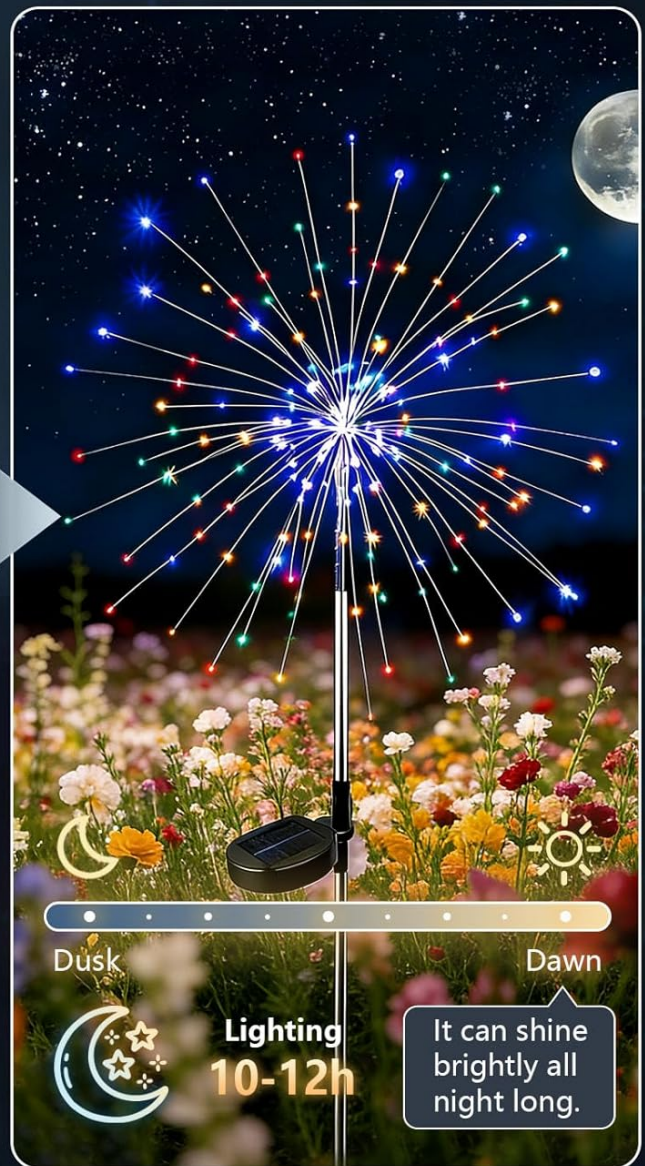
Image: Illustration of the solar charging process during the day and automatic illumination at night, highlighting the energy-saving dusk-to-dawn functionality.