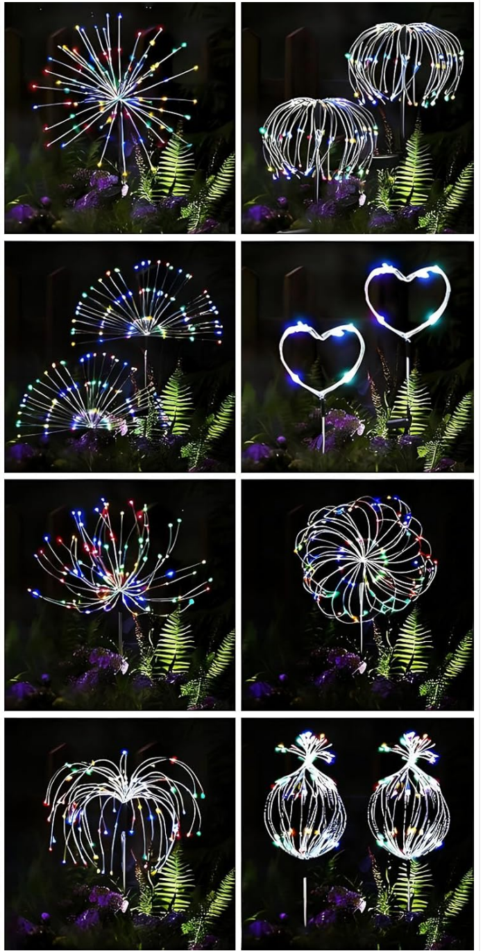
Image: Demonstration of the IP65 waterproof feature and the flexibility of the wires, allowing for creative shaping and ensuring durability in various weather conditions.