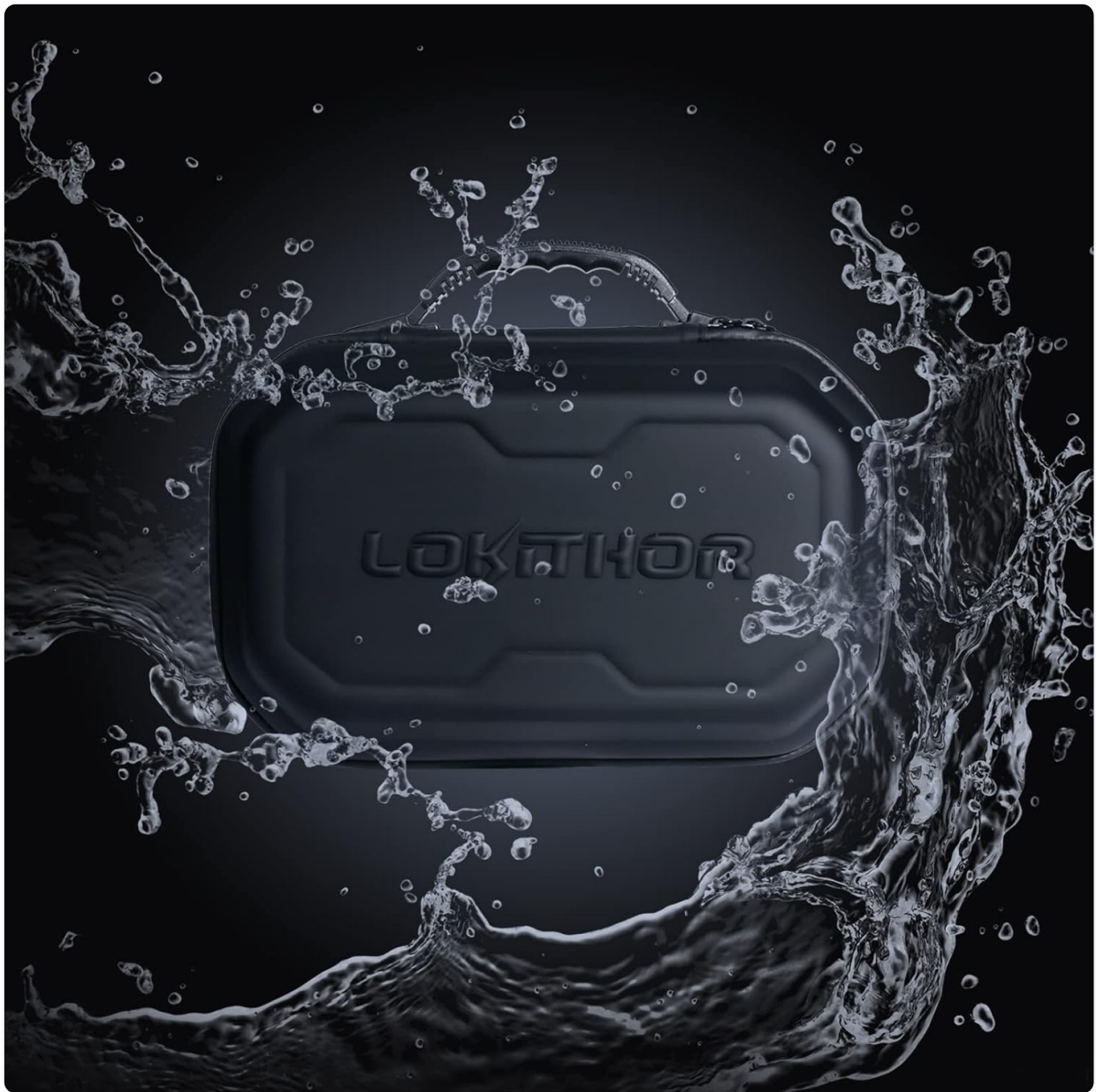
Image: The LOKITHOR JA-Series EVA Protection Case being splashed with water, highlighting its waterproof feature.

Video: A brief demonstration showcasing the LOKITHOR JA-Series Bag EVA Protection Case, highlighting its design and features.