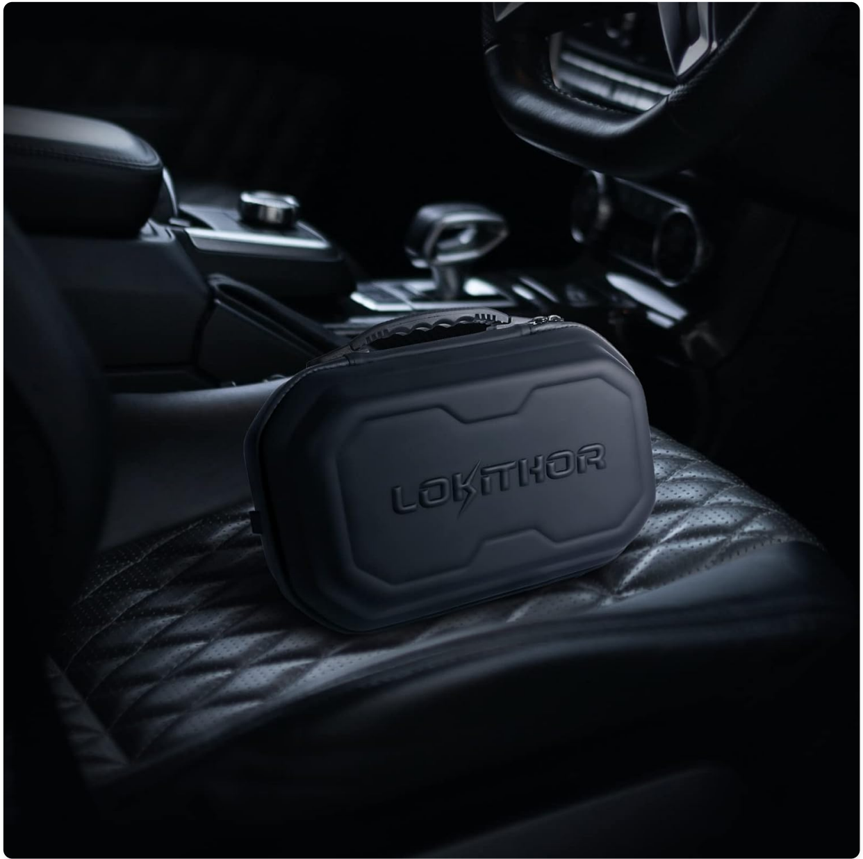
Image: The LOKITHOR JA-Series EVA Protection Case resting securely on a car seat, demonstrating its portability and convenient storage within a vehicle.