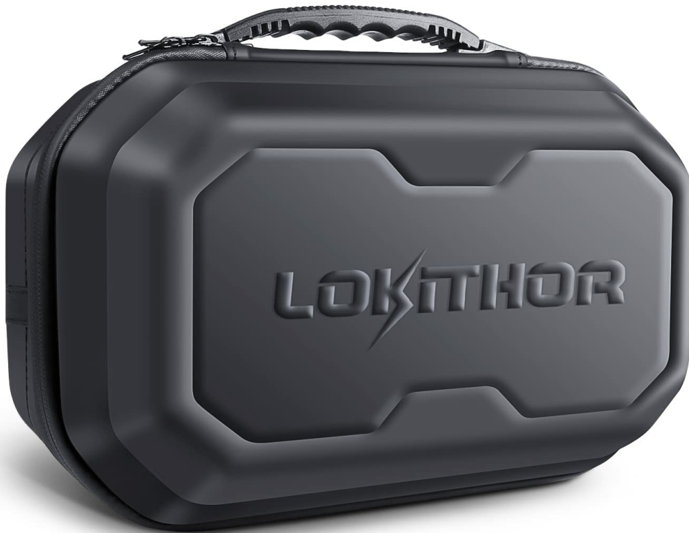
Image: LOKITHOR JA-Series EVA Protection Case, shown closed with the brand logo prominently displayed.