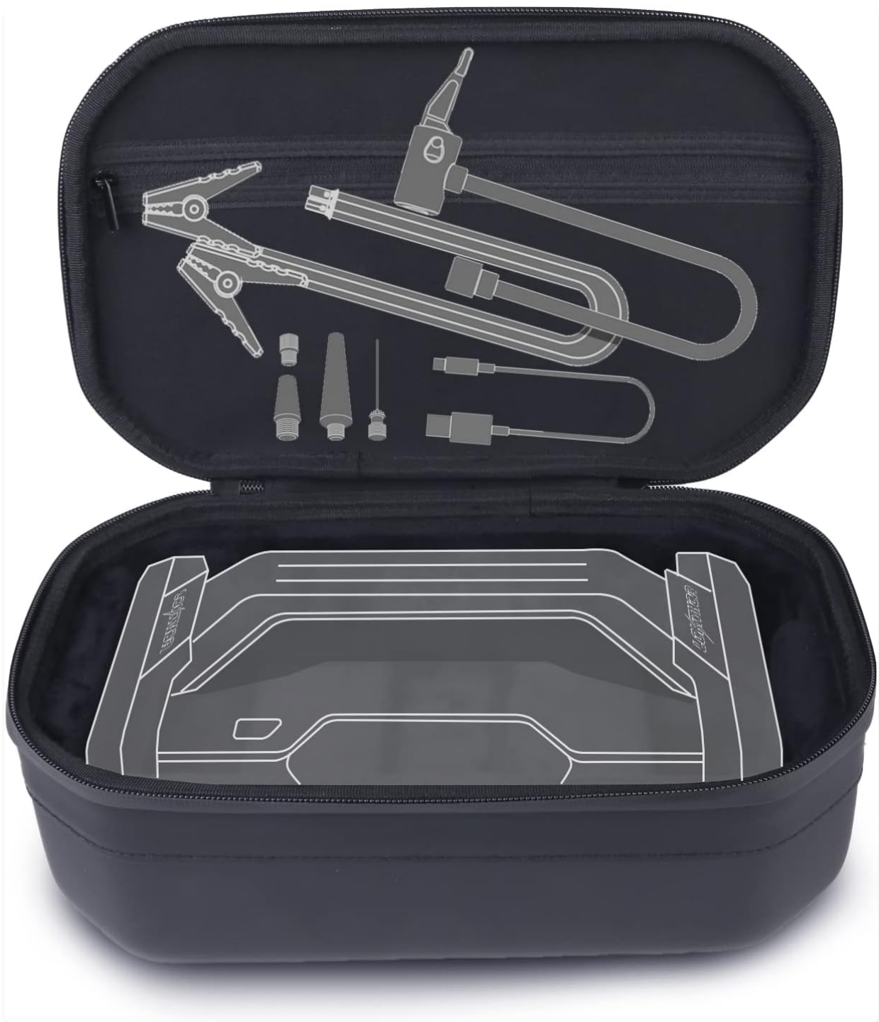
Image: The LOKITHOR JA-Series EVA Protection Case shown open, illustrating the designated compartments for the jump starter and accessories.