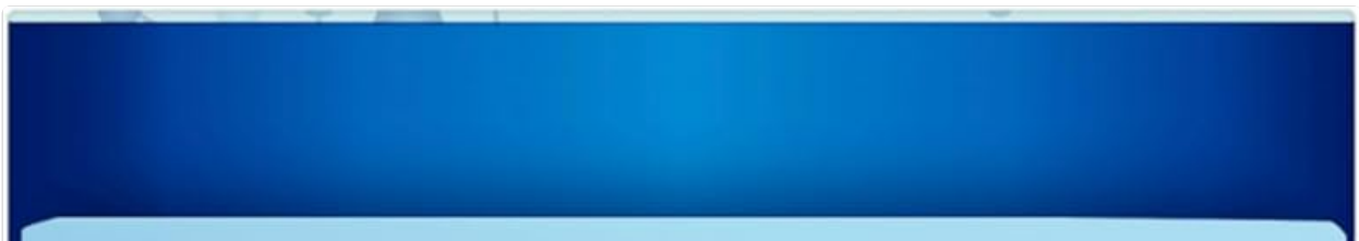
Image: An assortment of Nerve products, showcasing the full range of nerve care solutions.

Inactive ingredients acrylates/C10-30 alkyl acrylate crosspolymer, alcohol, aminomethylpropanol, C30-45 alkyl cetearyl dimethicone crosspolymer, caprylyl methicone, ceteth-20 phosphate, cetostearyl alcohol, dicetyl phosphate, dimethicone, edetate disodium, ethylhexylglycerin, glyceryl stearate, hydroxyethyl acrylate/sodium acryloyldimethyl taurate copolymer, isohexadecane, phenoxyethanol, polyoxyl 15 hydroxystearate, polysorbate 60, sorbitan isostearate, steareth-21, tocopherol, water