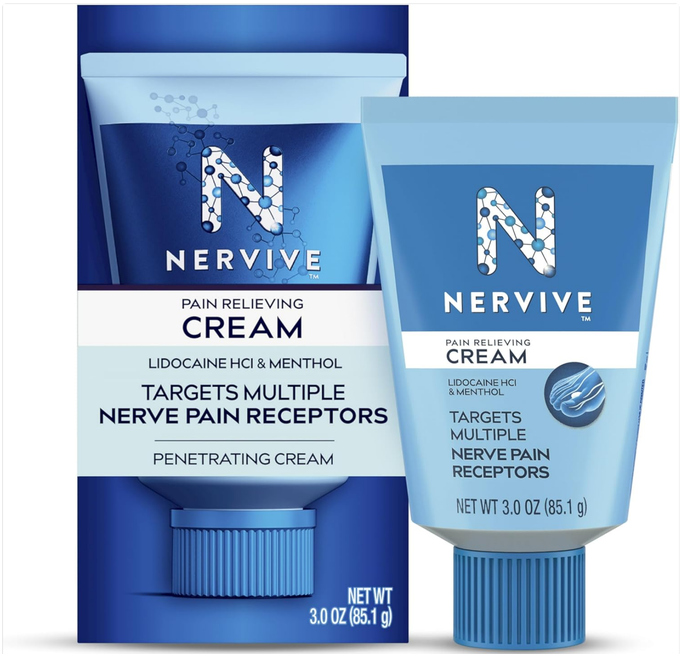
Image: The Nervive Pain Relieving Cream product, showing both the box and the tube.