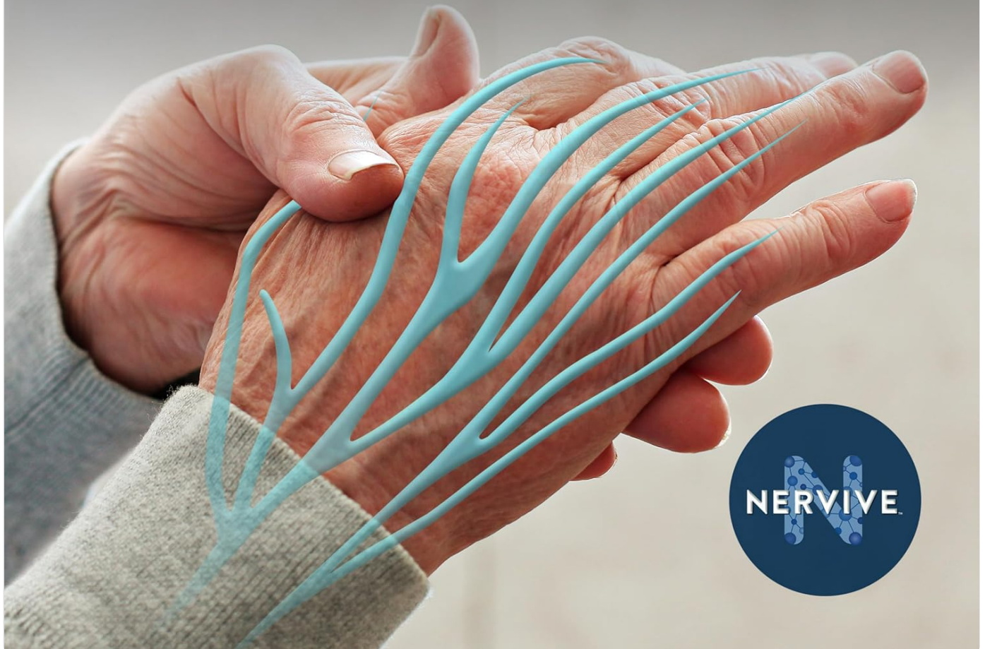
Image: An illustration highlighting nerve pain receptors in hands, fingers, arms, toes, and legs, indicating targeted relief.