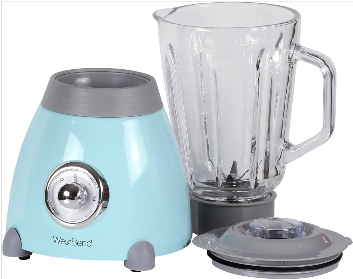
Image: All components of the West Bend Retro-Styled Blender, including the motor base, glass blending jar, lid, and blade assembly.