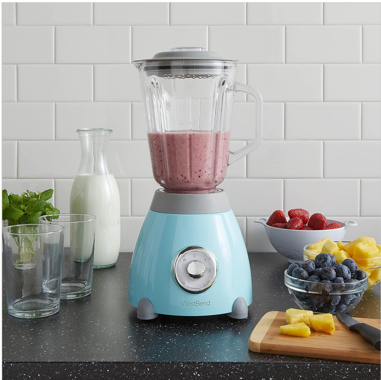
Image: The West Bend blender after blending, showing a smooth beverage in the jar.