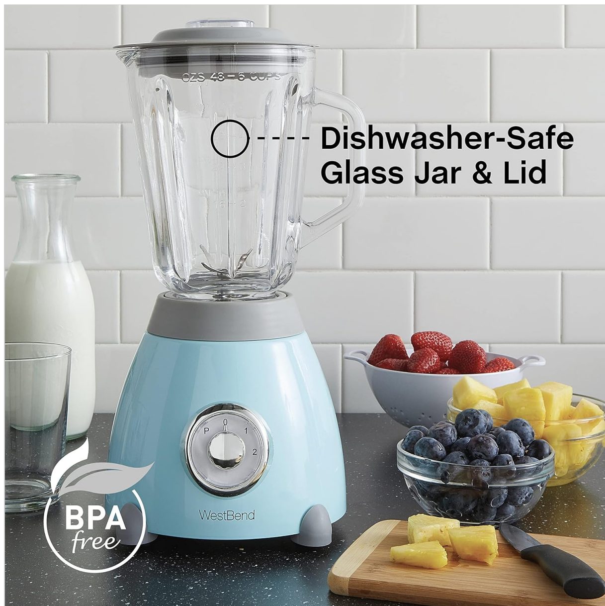
Image: The West Bend blender's glass jar and lid are dishwasher-safe for easy cleaning.