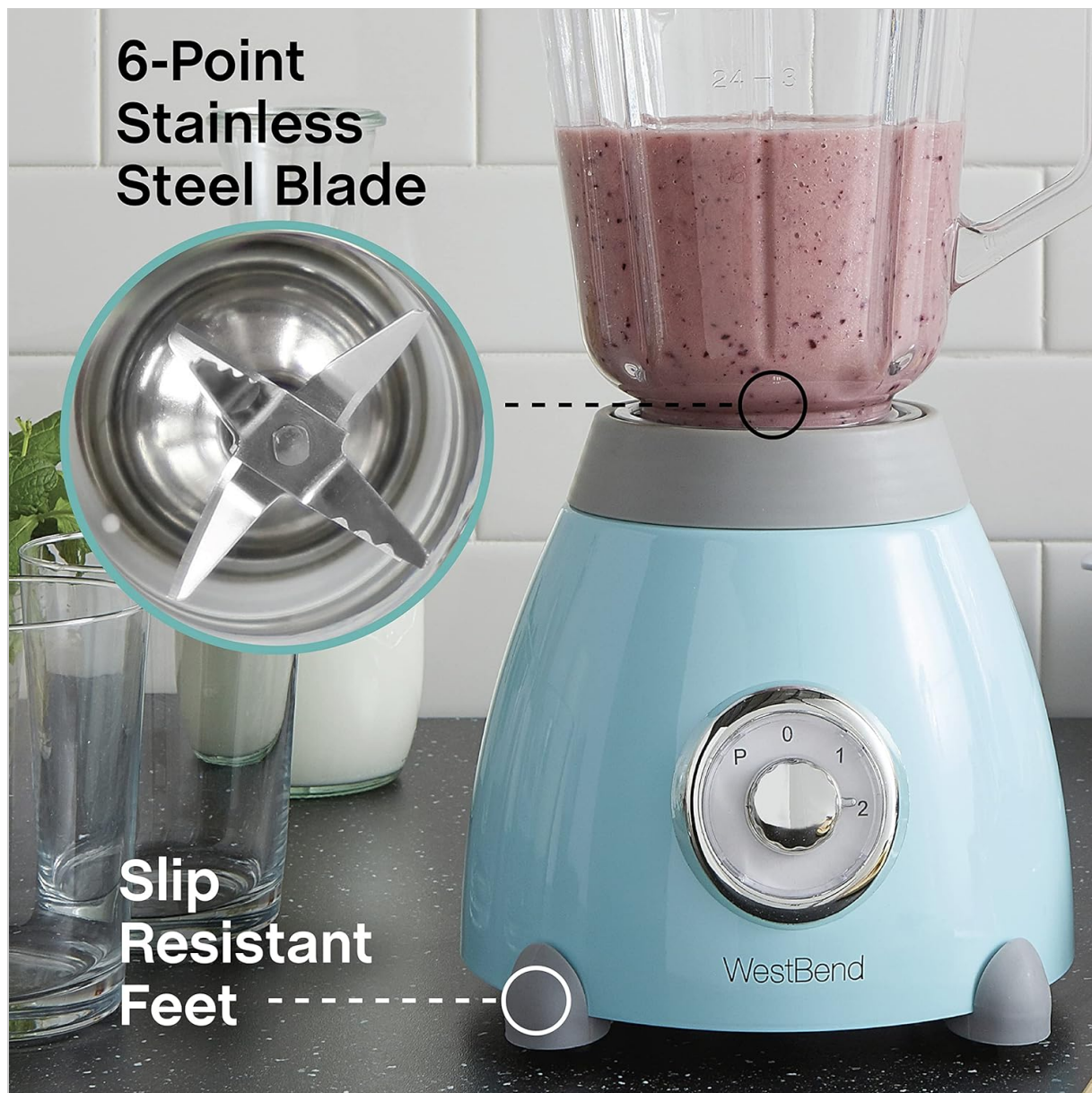
Image: Detail of the 6-point stainless steel blade and the slip-resistant feet on the blender base.