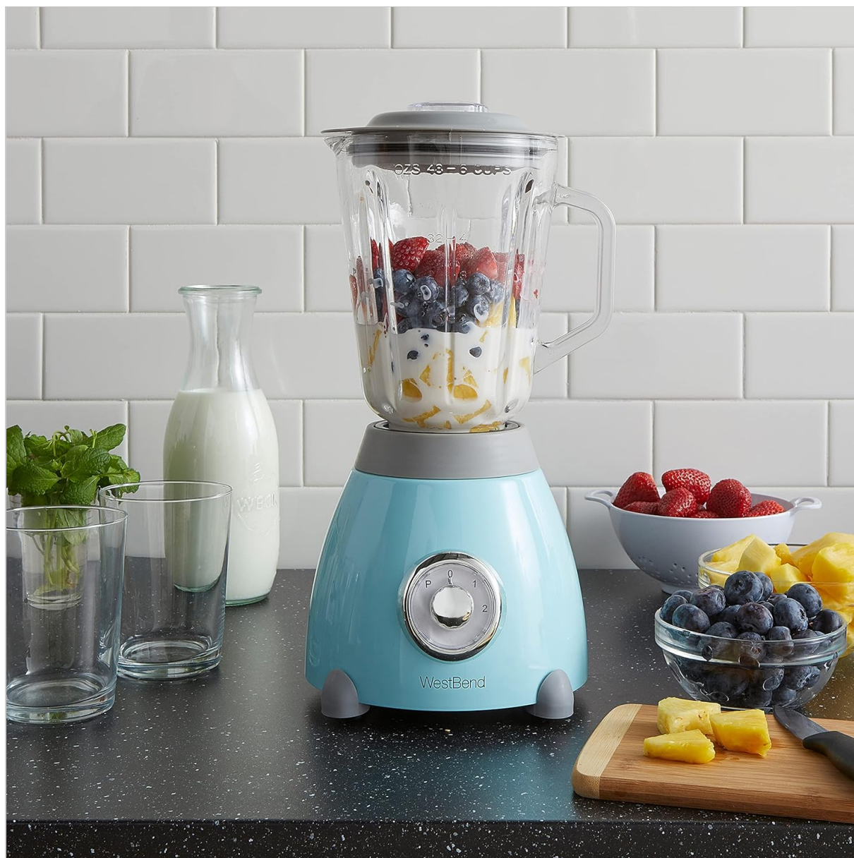
Image: The West Bend blender prepared with fresh fruit and yogurt, ready for blending.