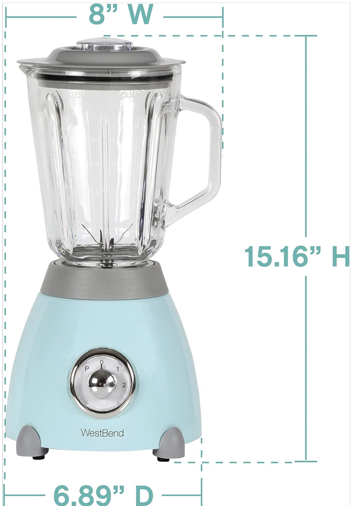
Image: Dimensional overview of the West Bend Retro-Styled Blender.