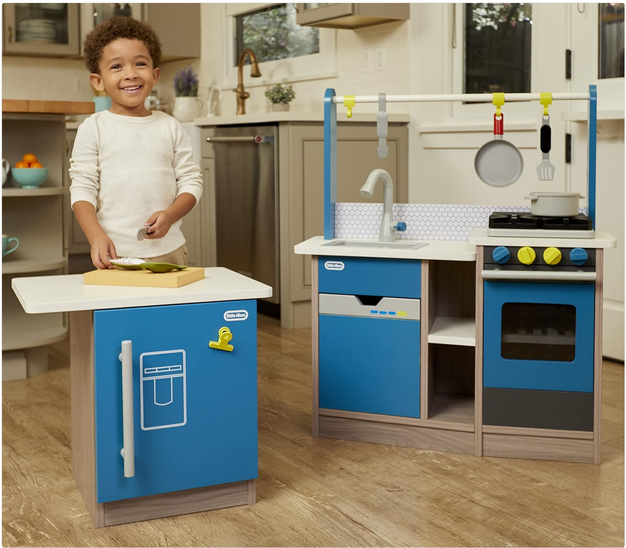
Image: The complete Little Tikes Classic Cook's Kitchen with Island playset, showing the main kitchen unit and the separate island, with a child interacting with the island.