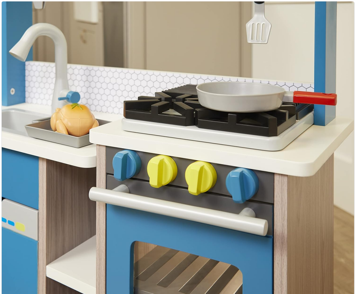
Image: A close-up view of the stovetop with play food (steak, egg, bacon) in a frying pan, demonstrating the interactive cooking area.