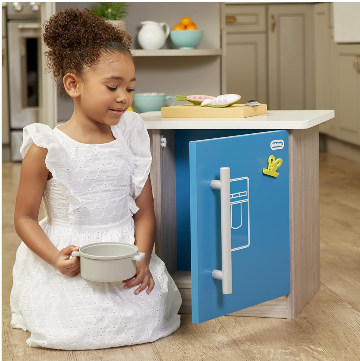
Image: A child interacting with the refrigerator door on the kitchen island, showing its opening mechanism.

Your browser does not support the video tag.