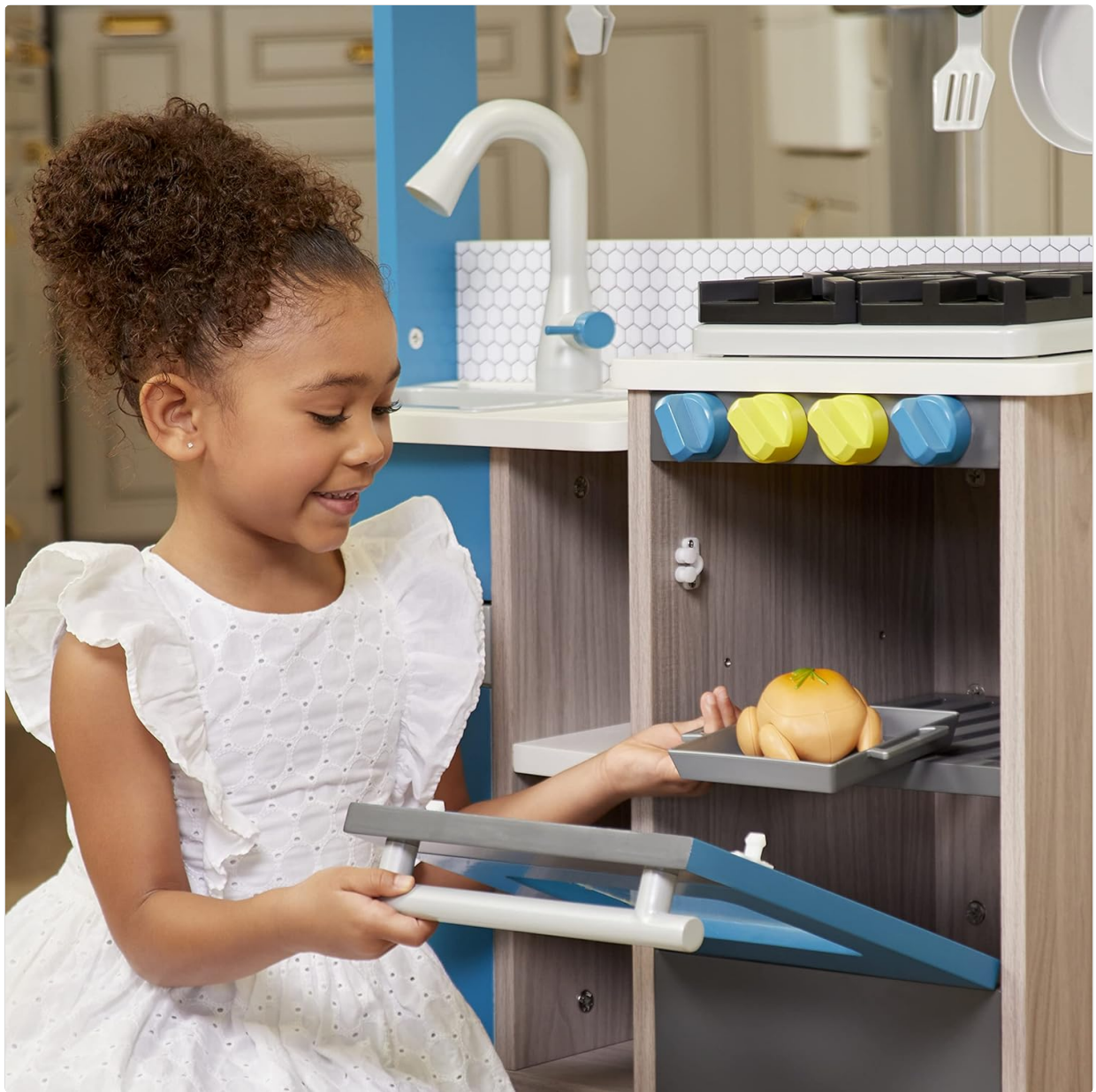
Image: A child placing a play turkey in the oven, highlighting the functional oven door and interior space.