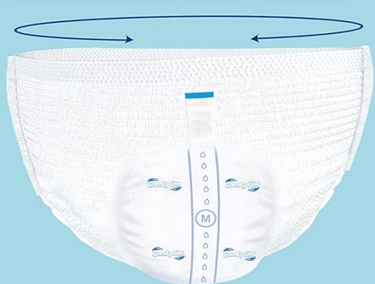
Image: Visual guide for selecting the correct size based on waist measurements.

The pull-up pants are designed with a full-rise waist for a better fit and are equipped with tearable side seams for quick and easy removal. The integrated wetness indicator changes color when in contact with fluid, signaling the need for a change. An easy dispose sticker is included for hygienic disposal after use.