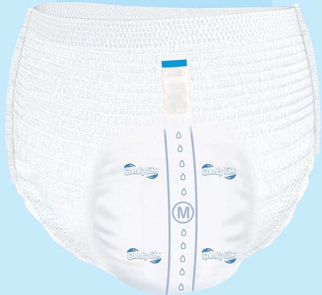
Image: Detailed views of the pull-up pant's front and back for proper orientation.