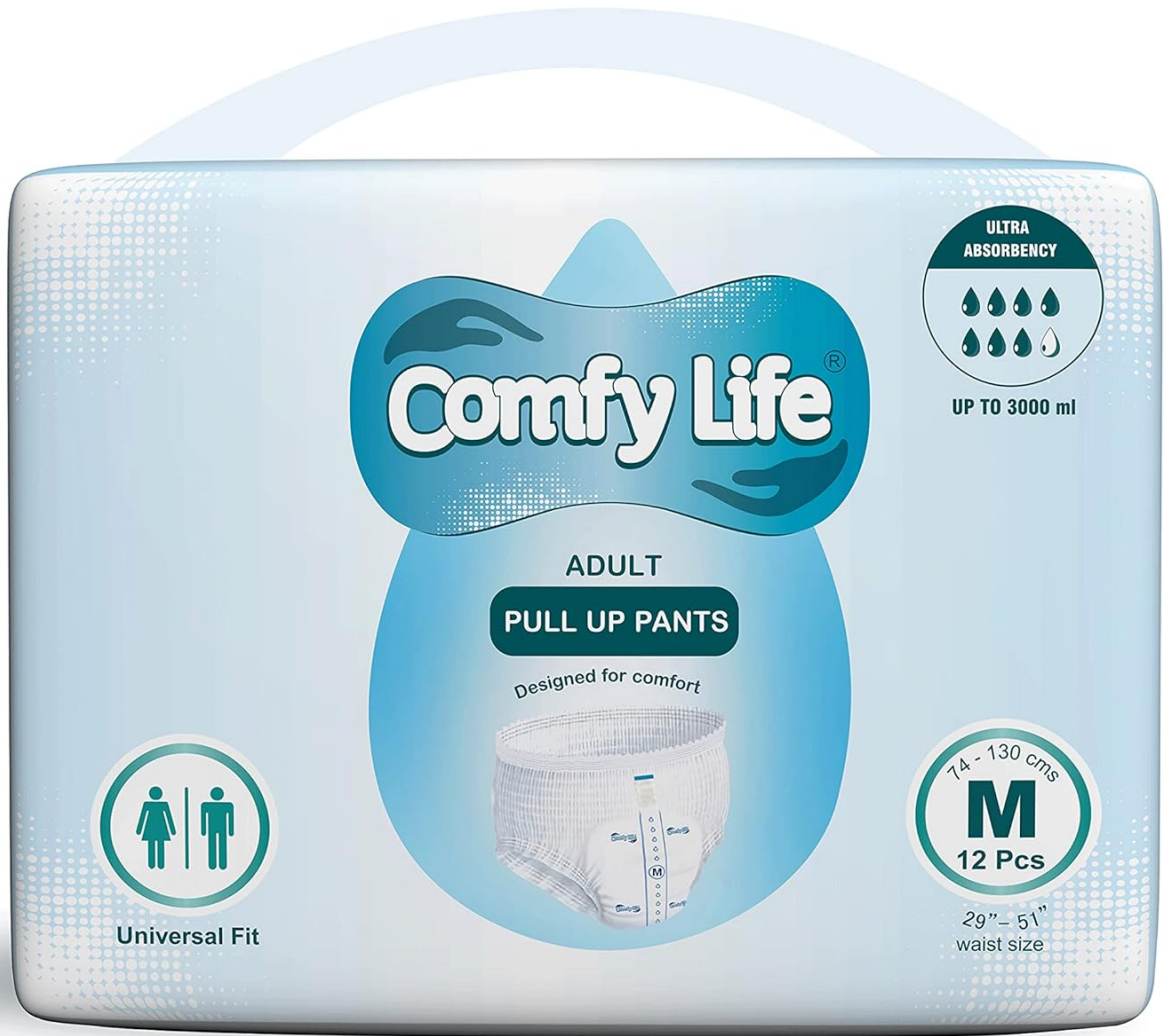
Image: Front view of the Comfy Life Premium Adult Pull Up Pants packaging.